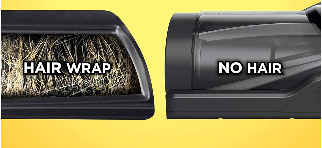
Image: A detailed view of the DuoClean PowerFins nozzle, showing the soft roller and PowerFins for optimal cleaning.