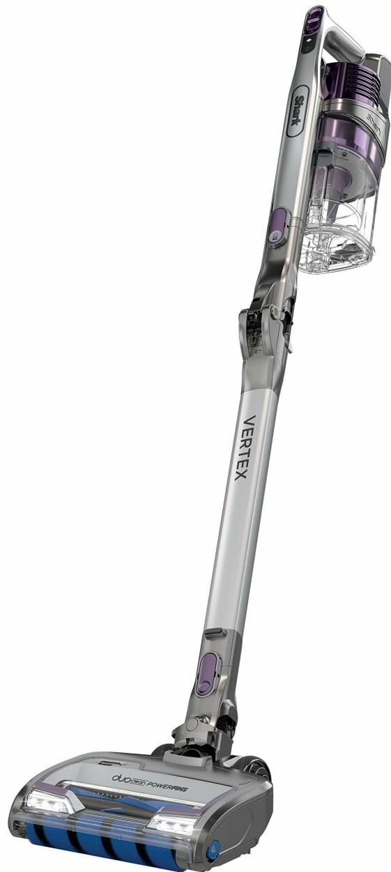
Image: The Shark Vertex vacuum demonstrating powerful cleaning on both hard floors and carpets.