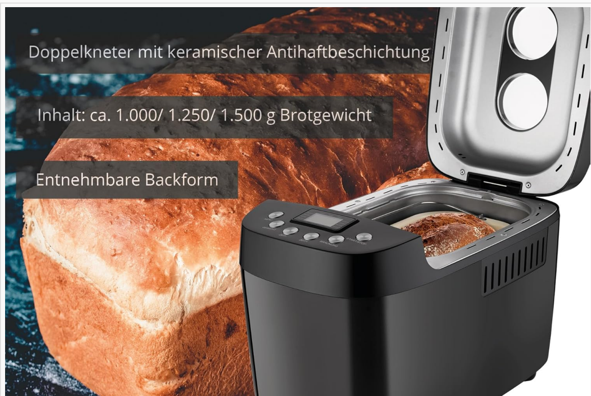
Image: Interior view of the bread maker, highlighting the removable baking pan and kneading blades.