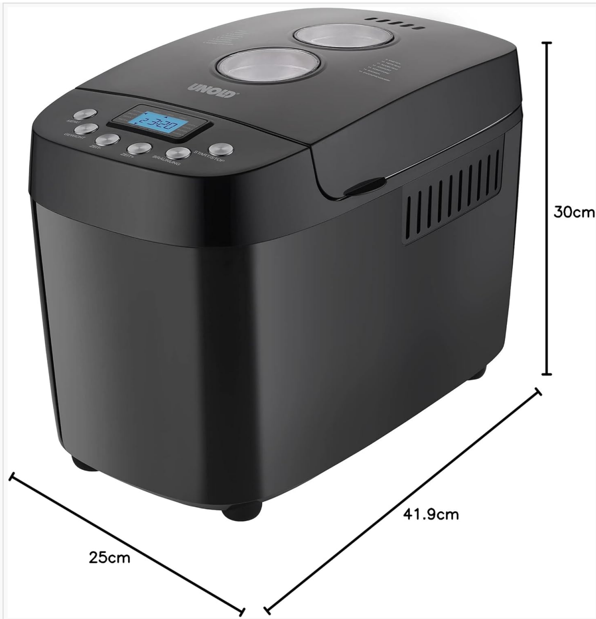
Image: Dimensions of the Unold BACKMEISTER Big bread maker.