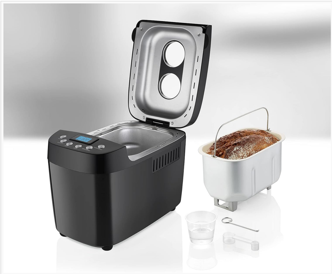
Image: Bread maker with its accessories, ready for initial setup.