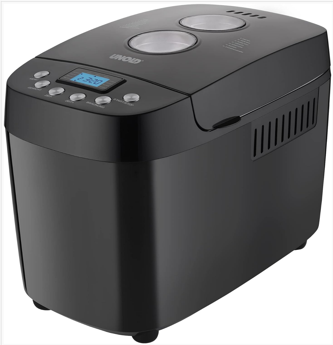
Image: Unold BACKMEISTER Big bread maker with its components.

The Unold BACKMEISTER Big bread maker features a robust design with user-friendly controls and a ceramic non-stick baking pan.