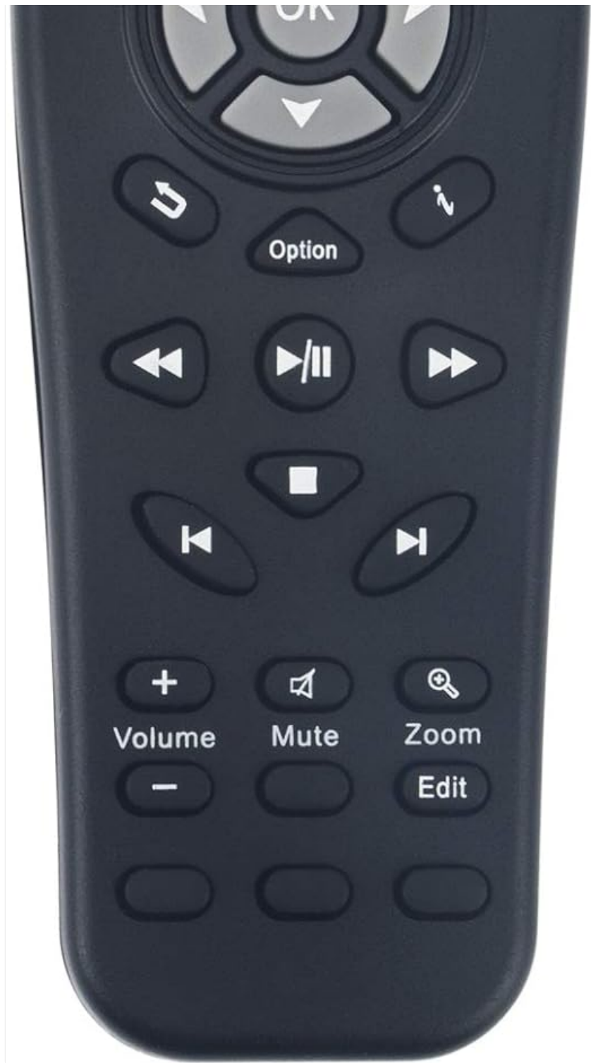
Figure 1: Front view of the WINFLIKE OPLAY021 Replaced Remote Control. The remote is black with grey and black buttons, including a central navigation pad with an OK button, playback controls, volume, mute, and zoom buttons.