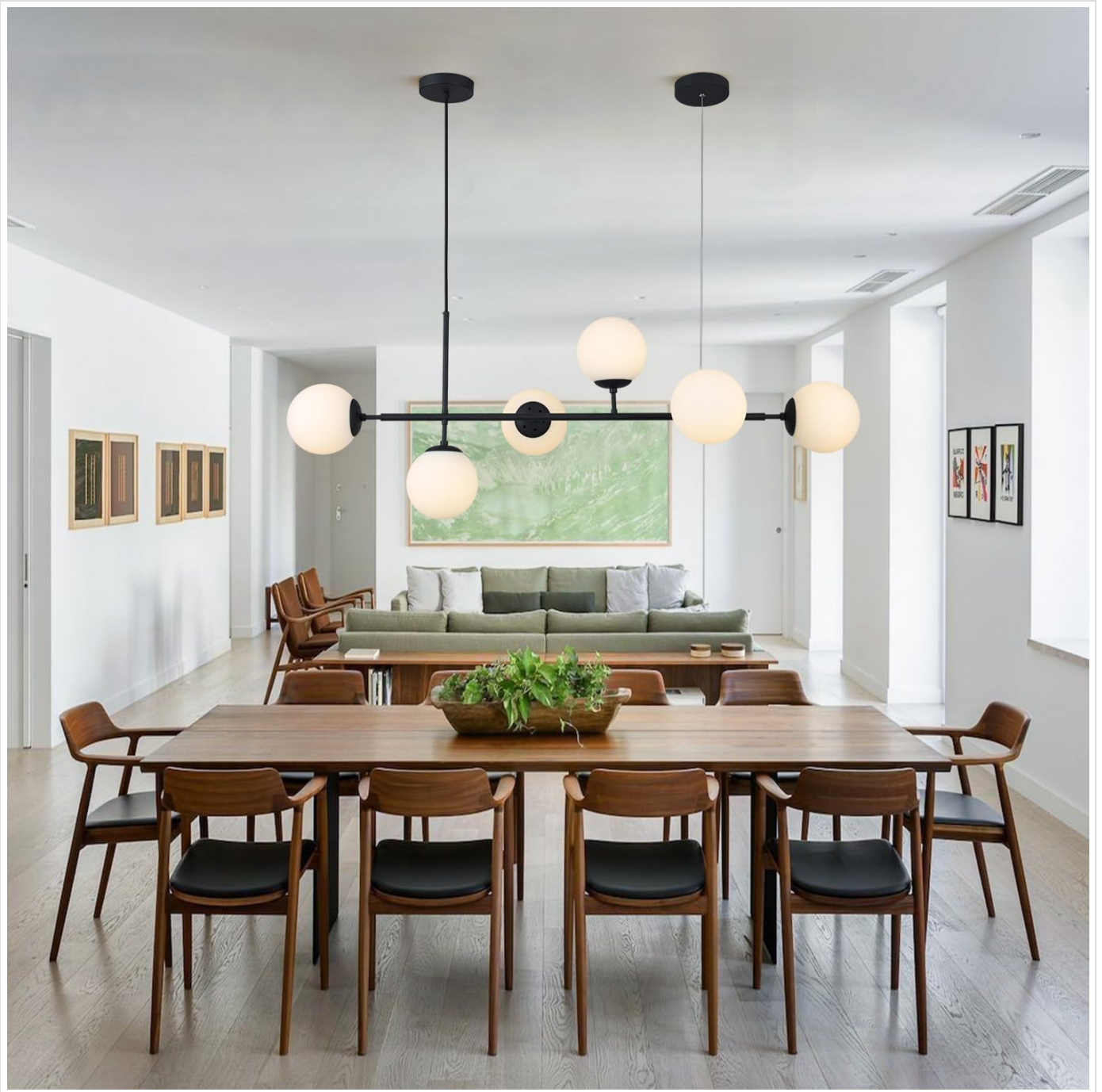
Figure 3: Chandelier in a dining room, demonstrating its aesthetic appeal and lighting coverage.