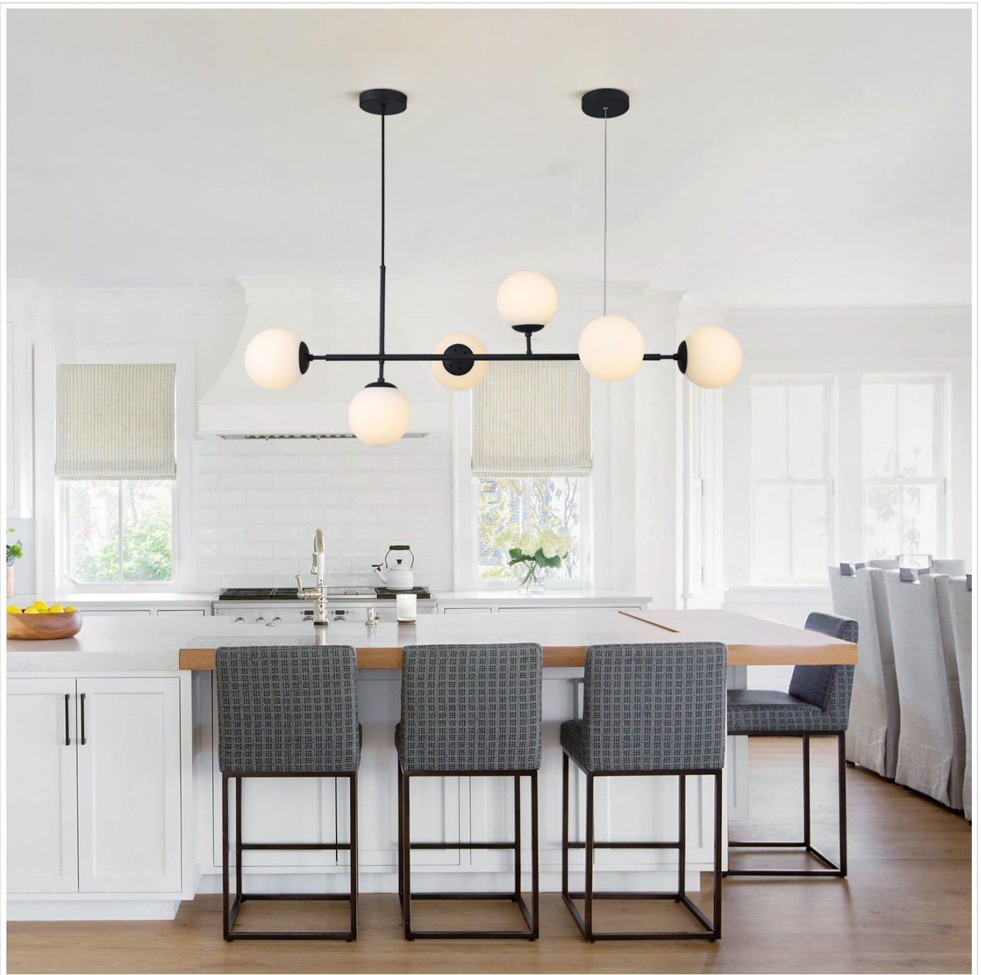
Figure 4: Chandelier positioned over a kitchen island, highlighting its suitability for kitchen spaces.