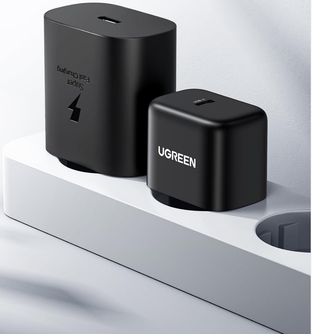
Image: The compact UGREEN 25W USB-C charger shown next to a larger, standard charger, highlighting its smaller footprint.

50% kleiner dan de originele Samsung 25W lader