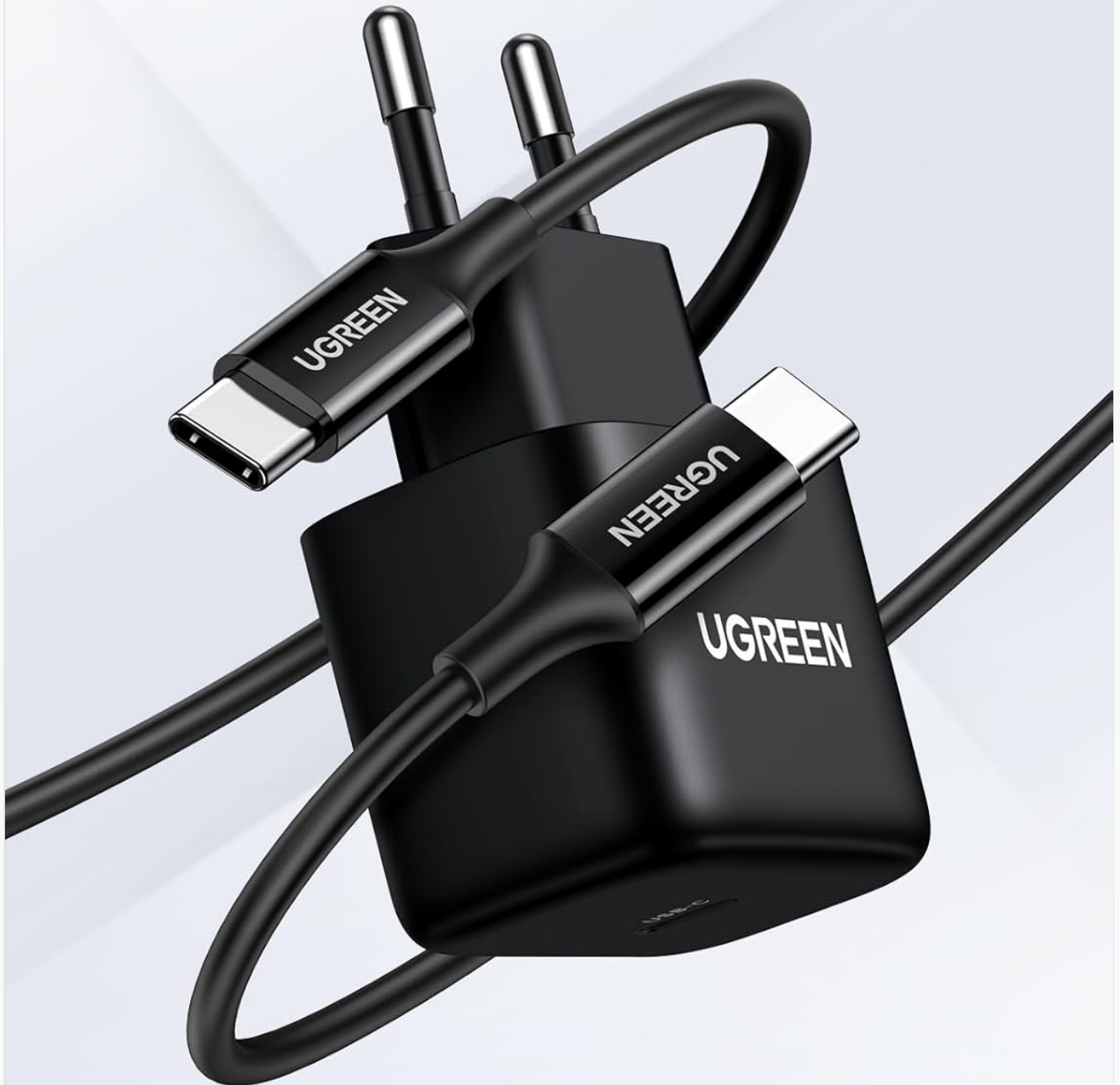
Image: Detailed view of the UGREEN 25W USB-C charger and its USB-C port, alongside the durable USB-C cable.