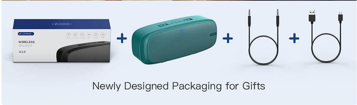
Image: The LENRUE A10 speaker, illustrating its impressive 12-hour playtime on a single charge, perfect for extended use.