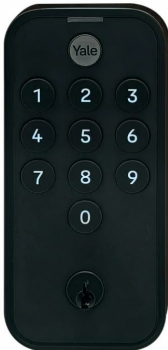
Image: Front view of the Yale Tye Digital Door Lock, showcasing the keypad and mechanical key slot.