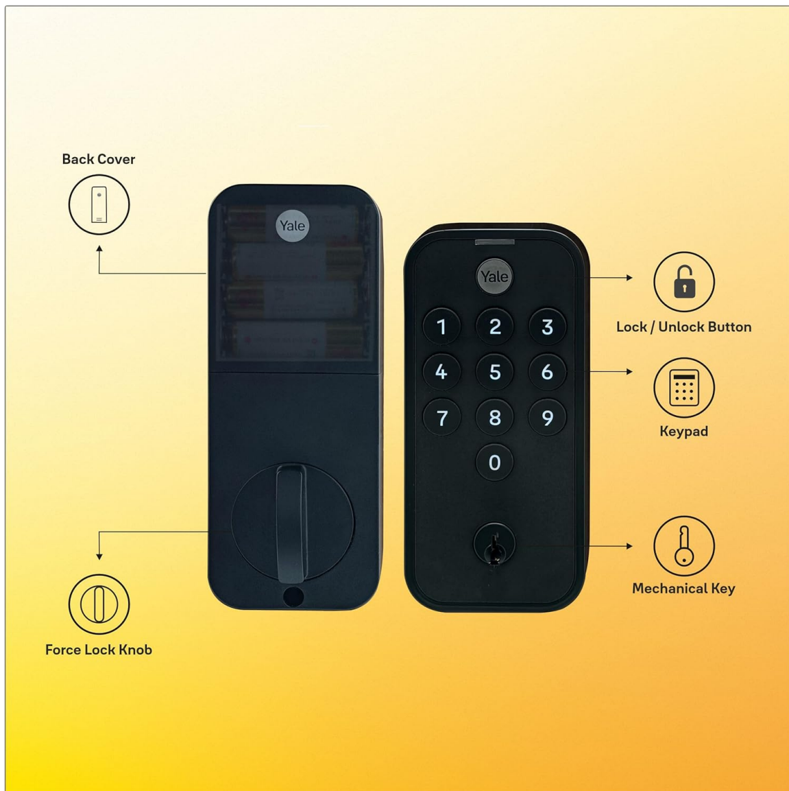
Image: The Yale Tye Digital Door Lock installed on a wooden door, showing both the exterior keypad and the interior unit.

8. Test Operation: Perform initial tests to ensure the lock operates smoothly and correctly.