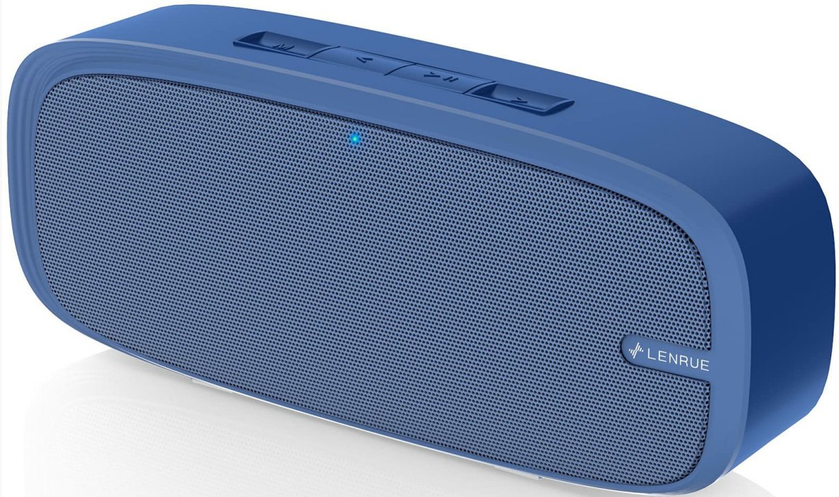
Image: The LENRUE Bluetooth Speaker, showcasing its compact and sleek design in blue.