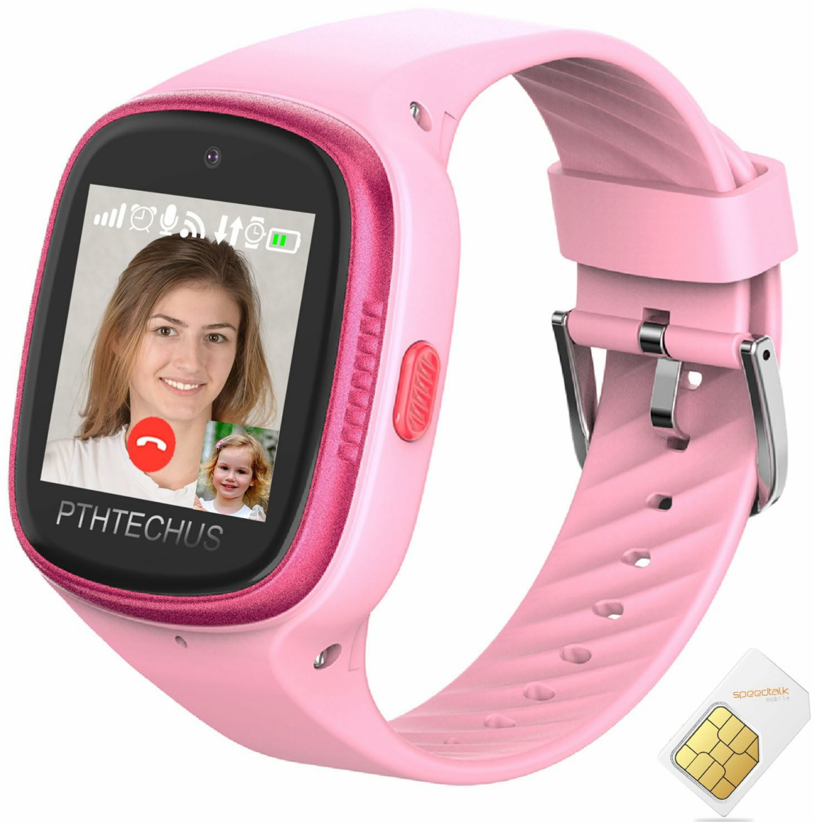
Figure 1: PTHTECHUS 4G Kids Smartwatch Phone