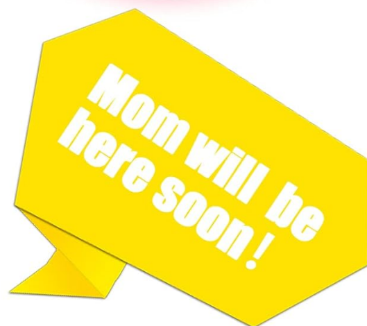
Image: Voice message functionality for quick communication.