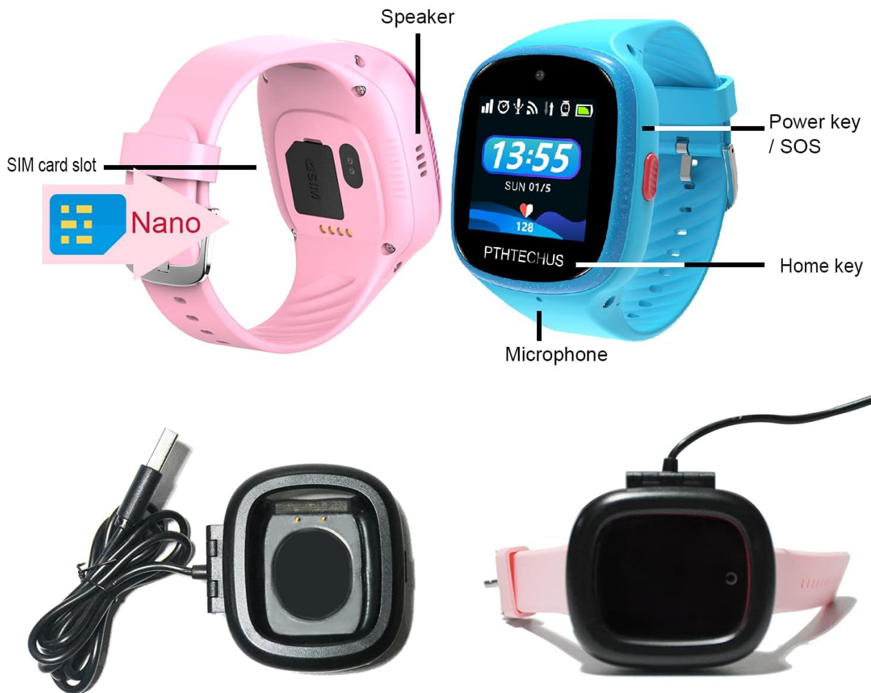
Image: Diagram highlighting key physical features and components of the smartwatch.