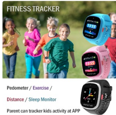
Image: The pedometer tracks steps and promotes an active lifestyle.

The built-in pedometer tracks steps and activity levels. This data can be viewed on the watch and synchronized with the parent app to encourage physical activity.