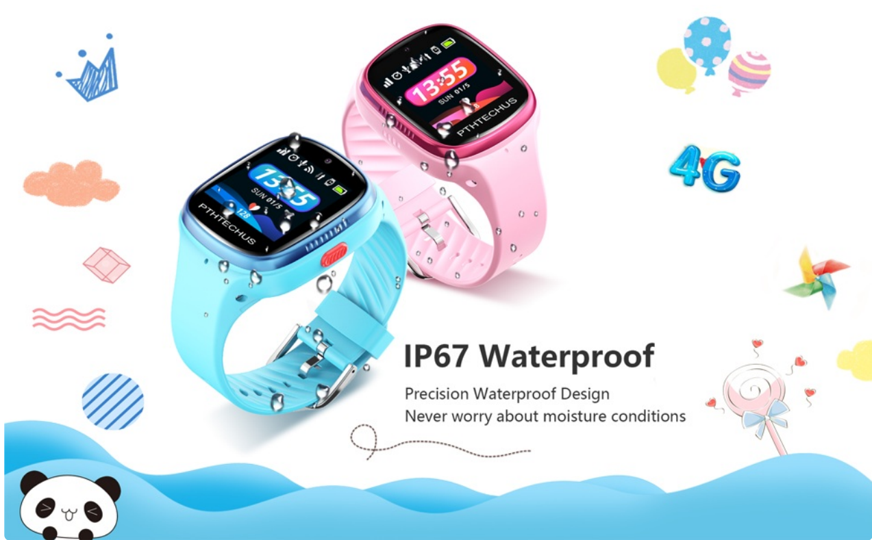
Image: The smartwatch features IP67 water resistance for everyday use.