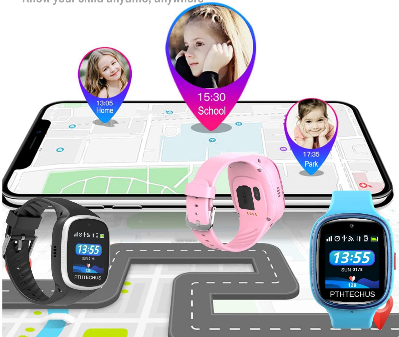
Image: Real-time location tracking using GPS, WiFi, and LBS.