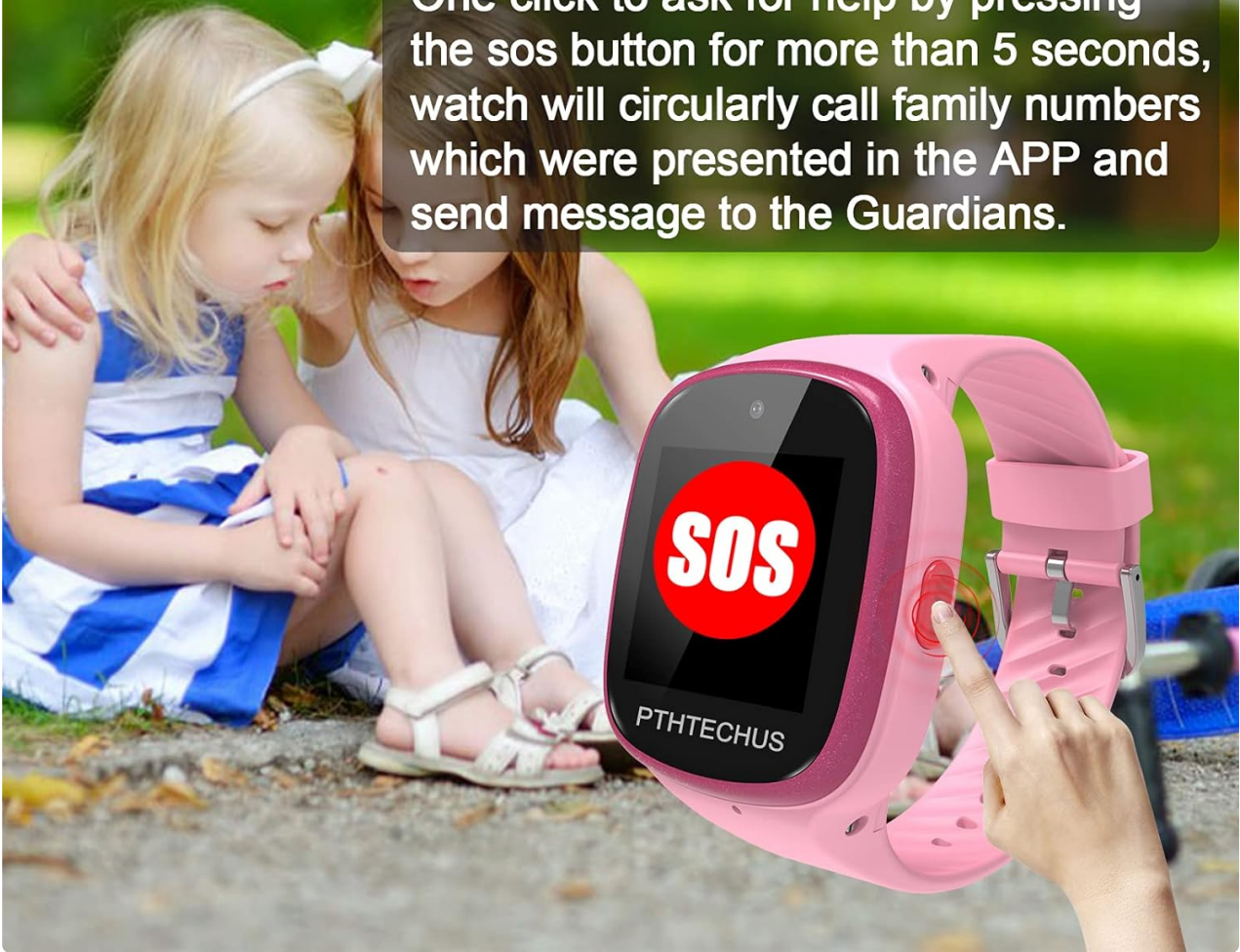
Image: The SOS button provides immediate emergency contact capabilities.

One click to ask for help by pressing the sos button for more than 5 seconds, watch will circularly call family numbers which were presented in the APP and send message to the Guardians.