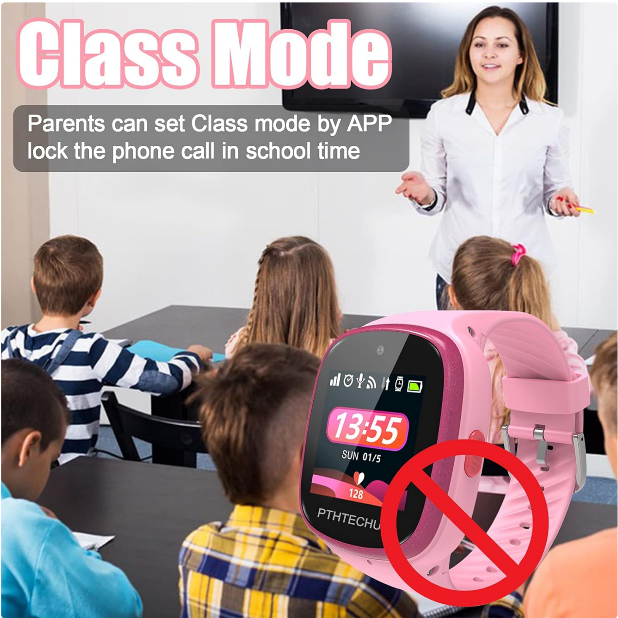
Image: Class Mode helps minimize distractions during school hours.

Parents can set Class mode by APP lock the phone call in school time