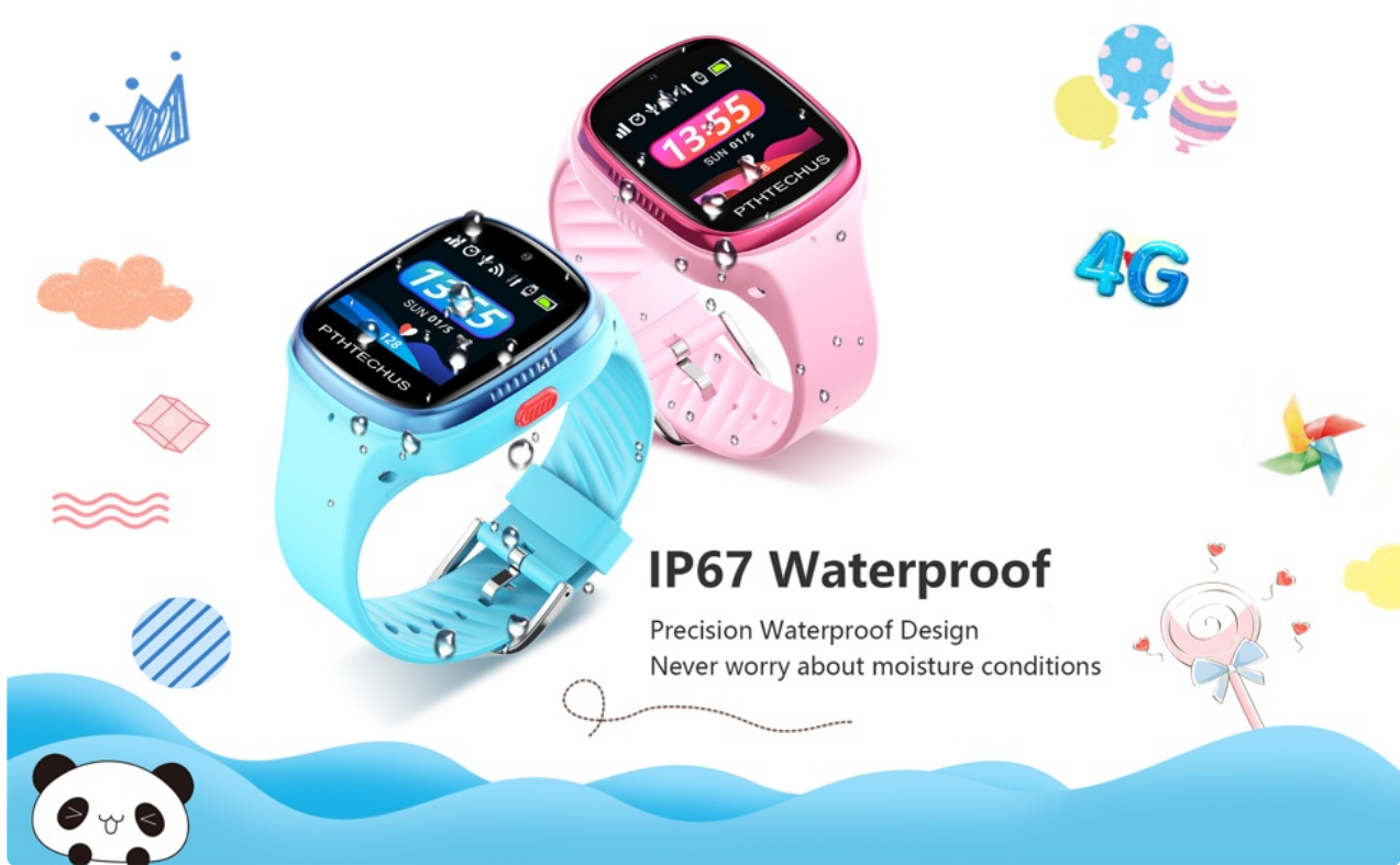
Image: The smartwatch supports 4G video calls and voice calls.