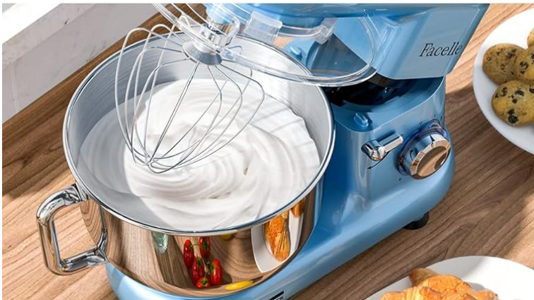
Figure 4.1: 3 Attachments Use Guide