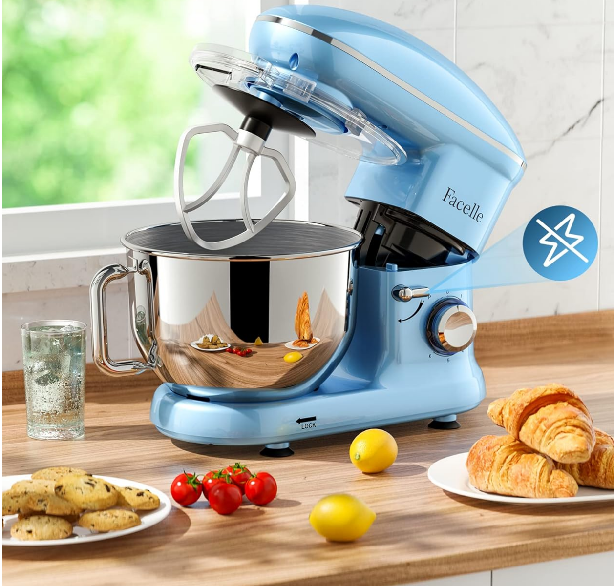
Figure 3.1: Tilt-Head Mechanism for Easy Access