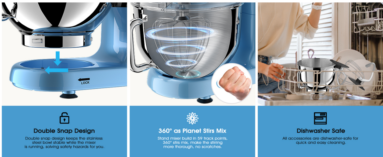
Figure 5.1: Dishwasher Safe Components