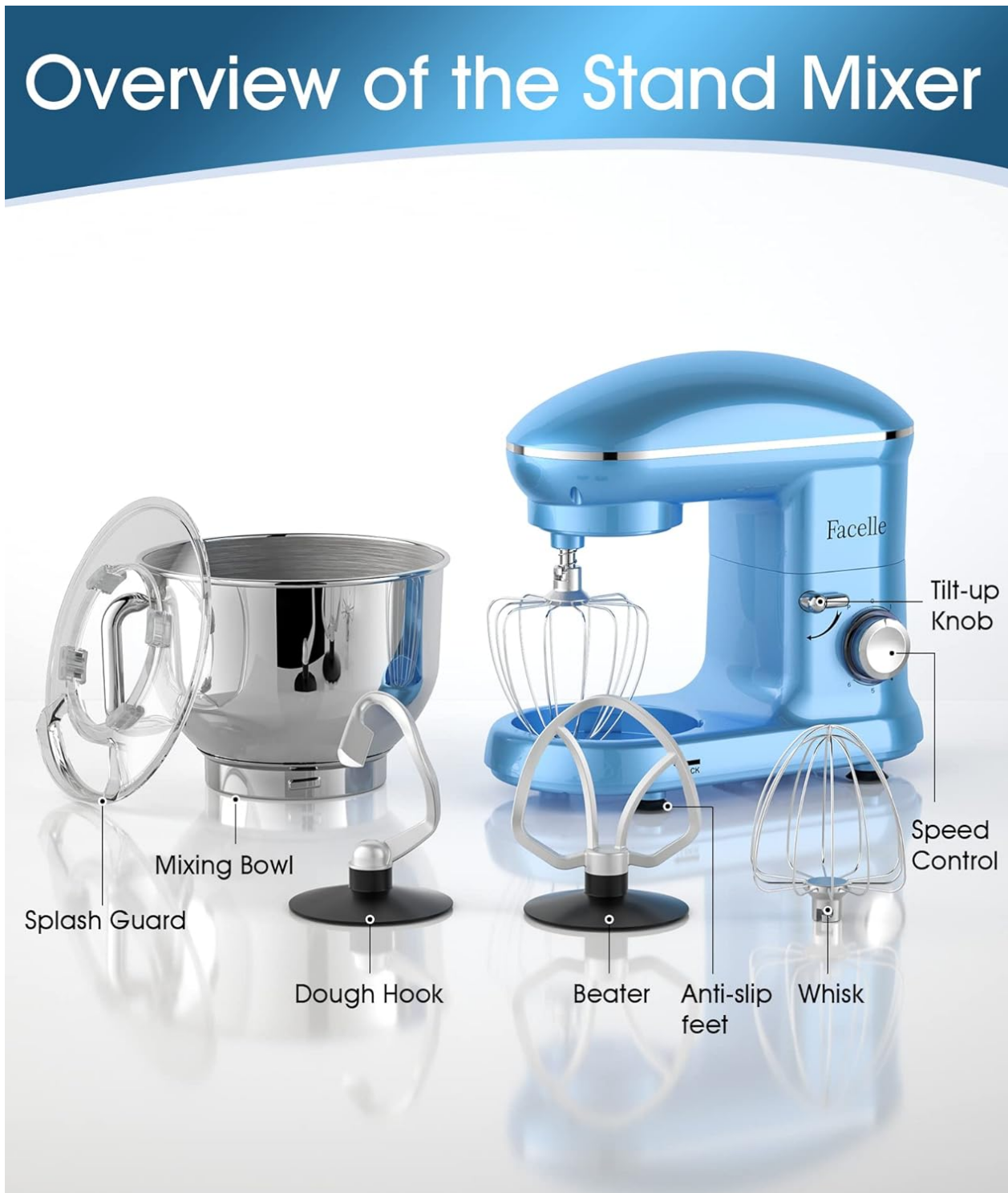
Figure 2.1: Overview of Facelle Stand Mixer Components