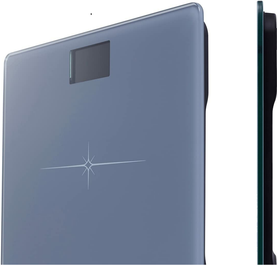
Image: Side profile of the scale, illustrating its slim design and the durable tempered glass surface.

Equipped with high-performance explosion-proof glass, it is small and slim, with a strong sense of design.