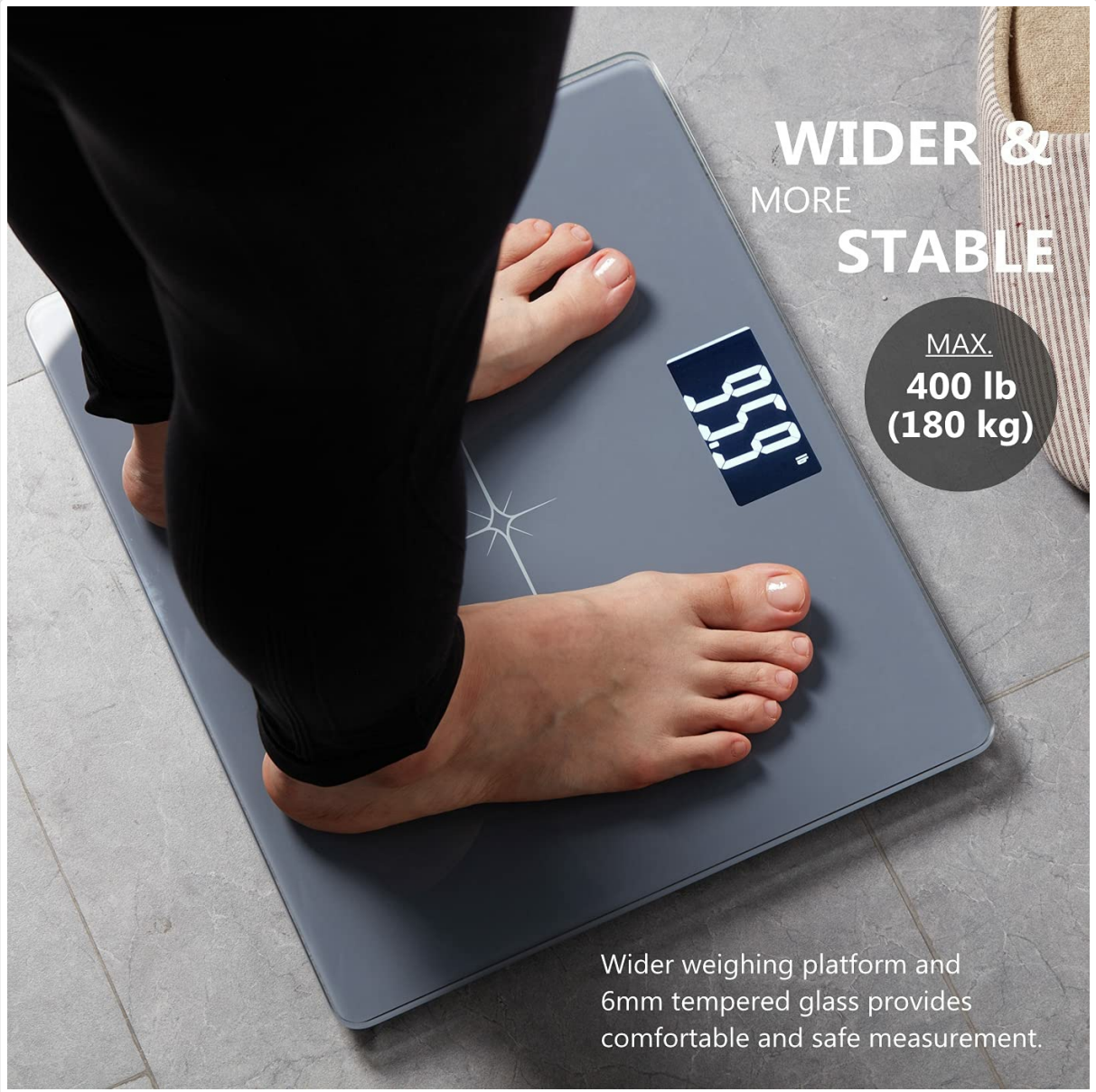
Image: A person standing on the scale, demonstrating the wide platform and digital display during a weight measurement.