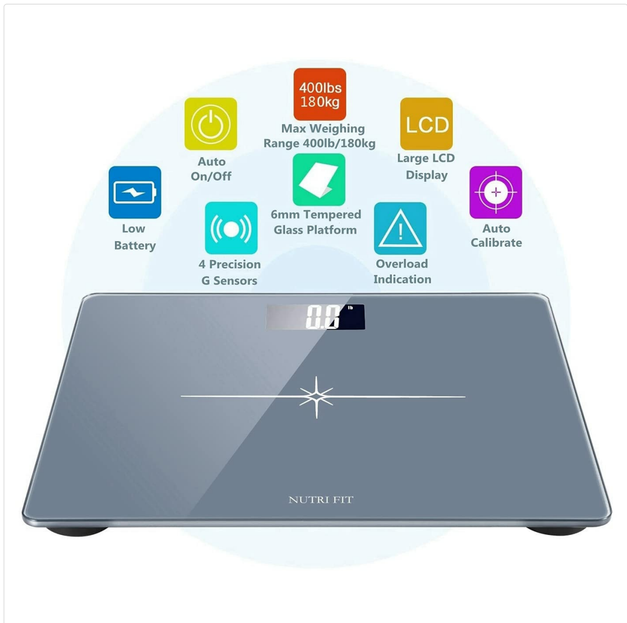
Image: Overview of the NUTRI FIT EB9233 Digital Bathroom Scale's key features, including weight capacity, display type, and sensor technology.