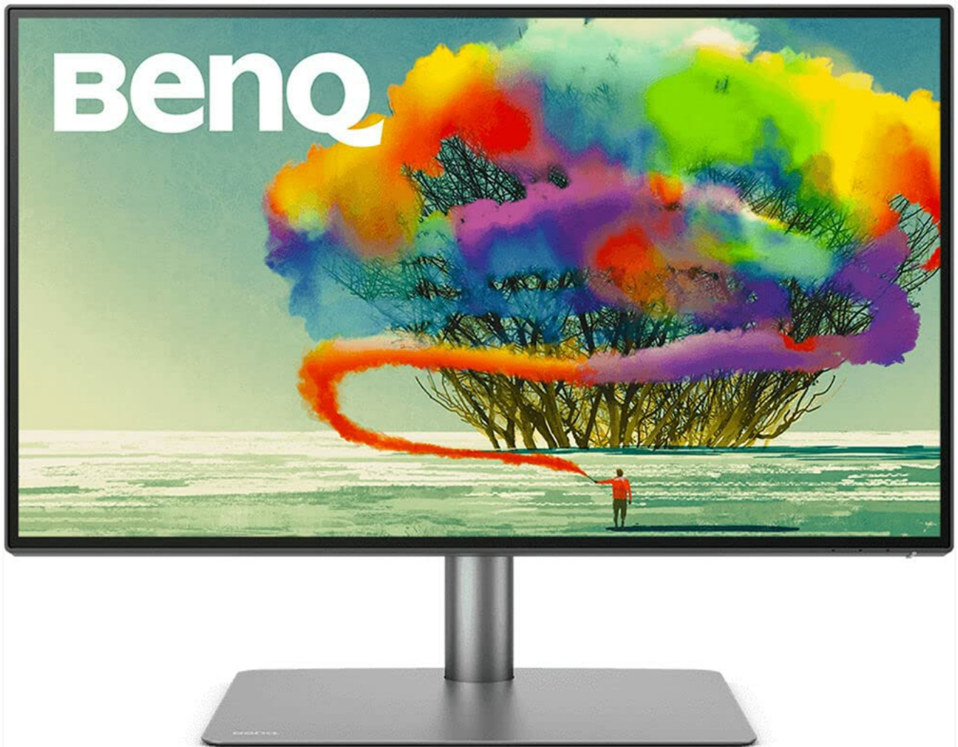
Figure 1: Front view of the BenQ PD2725U monitor.