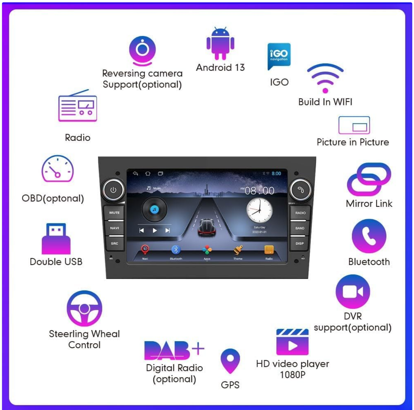
Figure 3.2: This image presents a visual summary of the headunit's extensive features through a series of icons. These include support for reversing cameras, Android 13 OS, iGO navigation, built-in Wi-Fi, radio, picture-in-picture mode, optional OBD, Mirror Link, dual USB ports, Bluetooth, optional DVR, Steering Wheel Control, optional DAB+, 1080P HD video playback, and GPS.