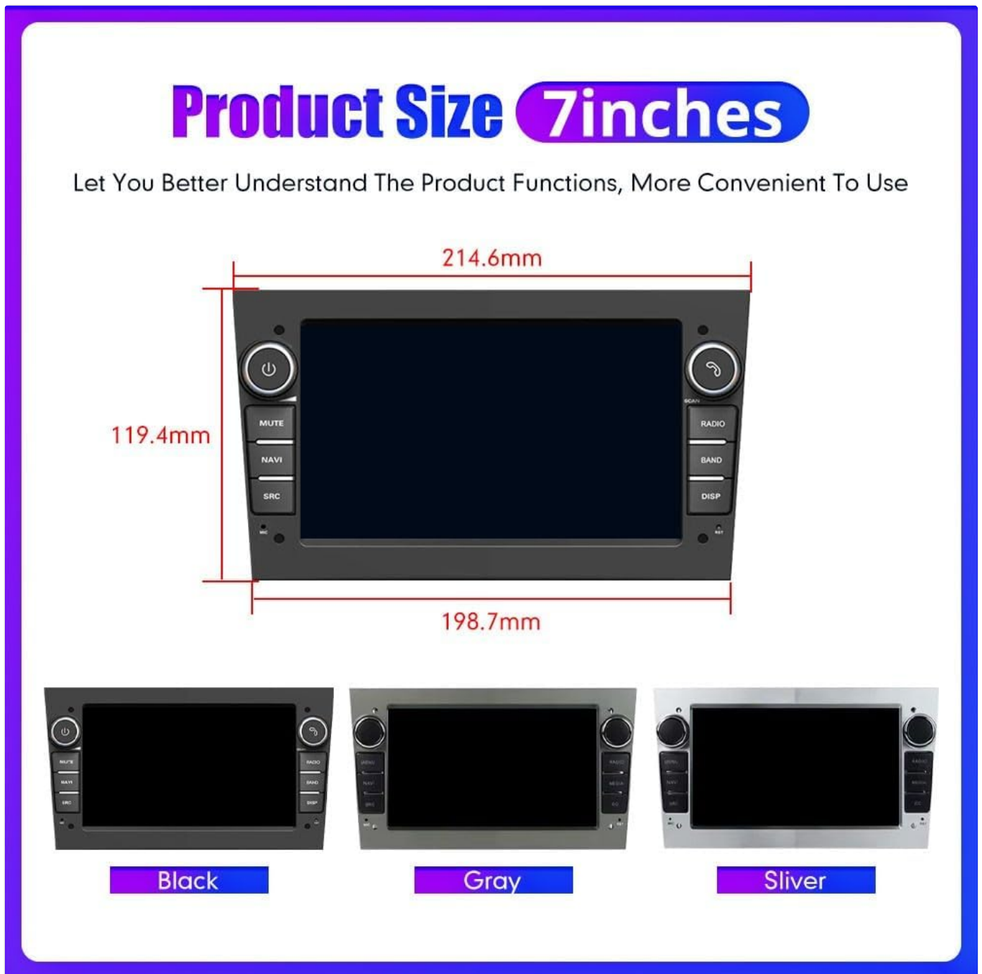
Figure 6.1: This diagram provides precise measurements for the 7-inch KUNFINE headunit, including its width (214.6mm), height (119.4mm), and bottom width (198.7mm). These dimensions are crucial for verifying fitment in compatible vehicle dashboards.