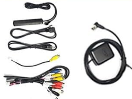
Figure 2.2: This image displays the typical contents of the KUNFINE headunit package. It includes the main headunit (available in black, grey, or silver), various cables (power, USB, RCA), a CANbus decoder, and either a Quad Core or Octa Core harness depending on the specific model purchased.