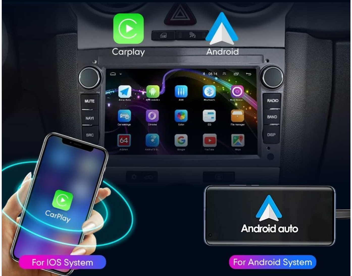
Figure 3.1: This graphic illustrates the integration of CarPlay for iOS devices and Android Auto for Android devices with the KUNFINE headunit. It shows a smartphone connected to the headunit, displaying the respective CarPlay and Android Auto interfaces, emphasizing seamless connectivity and mirroring capabilities.

Integrate your iPhone with your vehicle , Support Carplay , Android Auto Mirrorlink and other functions