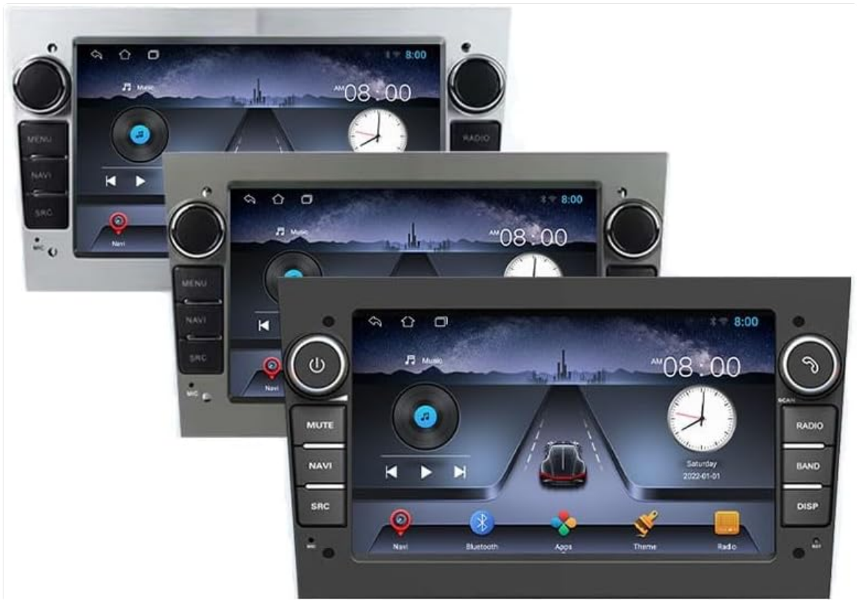
Figure 1.1: The KUNFINE 7-inch IPS touchscreen headunit shown in three available color options: black, grey, and silver. This image displays the front panel with physical buttons for functions like MUTE, NAVI, SRC, RADIO, BAND, and DISP, alongside the large central touchscreen interface.