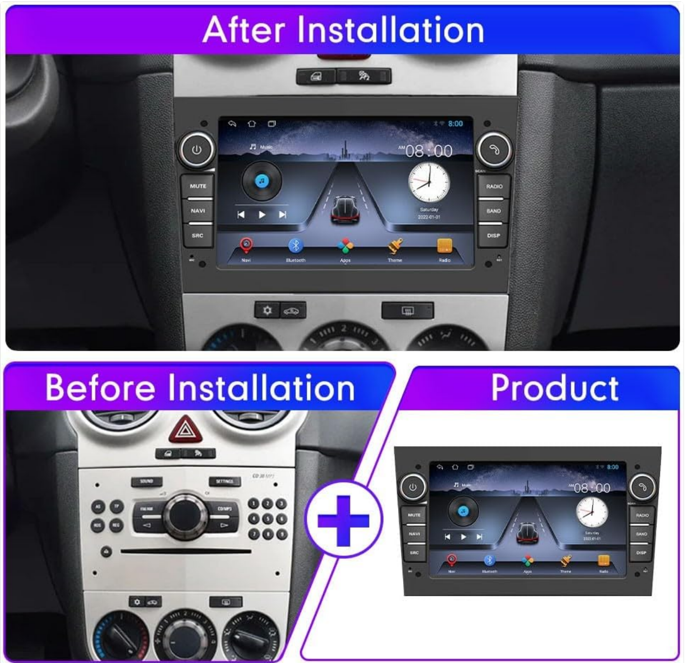
Figure 2.1: This image illustrates the visual transformation of a car's dashboard. The "Before Installation" section shows the original factory stereo, while the "After Installation" section displays the KUNFINE headunit seamlessly integrated into the dashboard, highlighting its fit and finish.