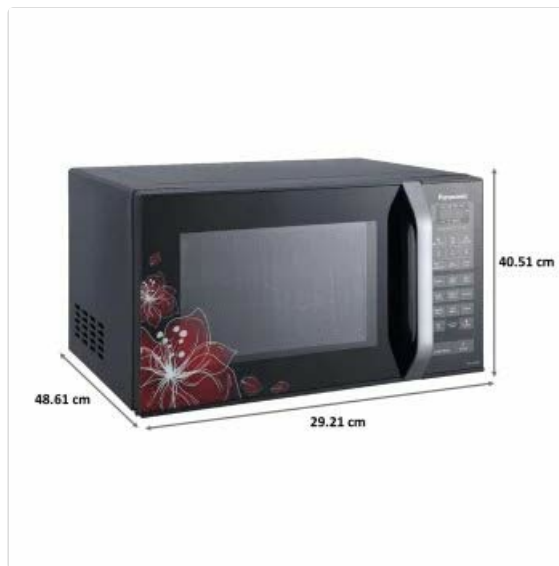
Image 5: Diagram showing the dimensions of the Panasonic 23 Litres Convection Microwave Oven, with measurements of 48.61 cm (width), 29.21 cm (depth), and 40.51 cm (height).