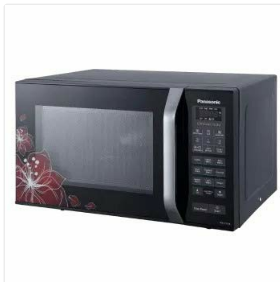
Image 3: Angled view of the Panasonic 23 Litres Convection Microwave Oven, providing a perspective of its overall design and compact