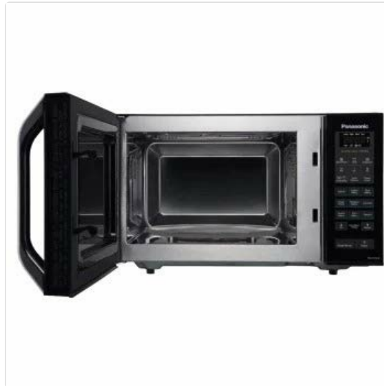
Image 4: Interior view of the Panasonic 23 Litres Convection Microwave Oven with the door open, showing the stainless steel cavity and turntable area.