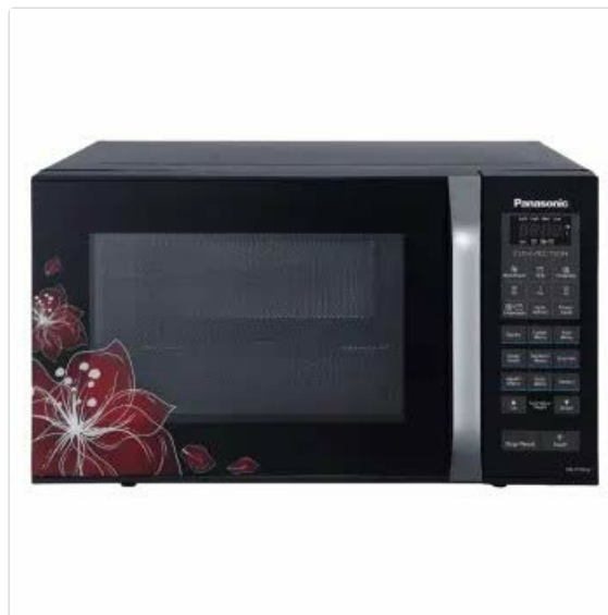
Image 2: Front view of the Panasonic 23 Litres Convection Microwave Oven, showing the control panel on the right and the door with floral design.

Familiarize yourself with the components of your microwave oven.