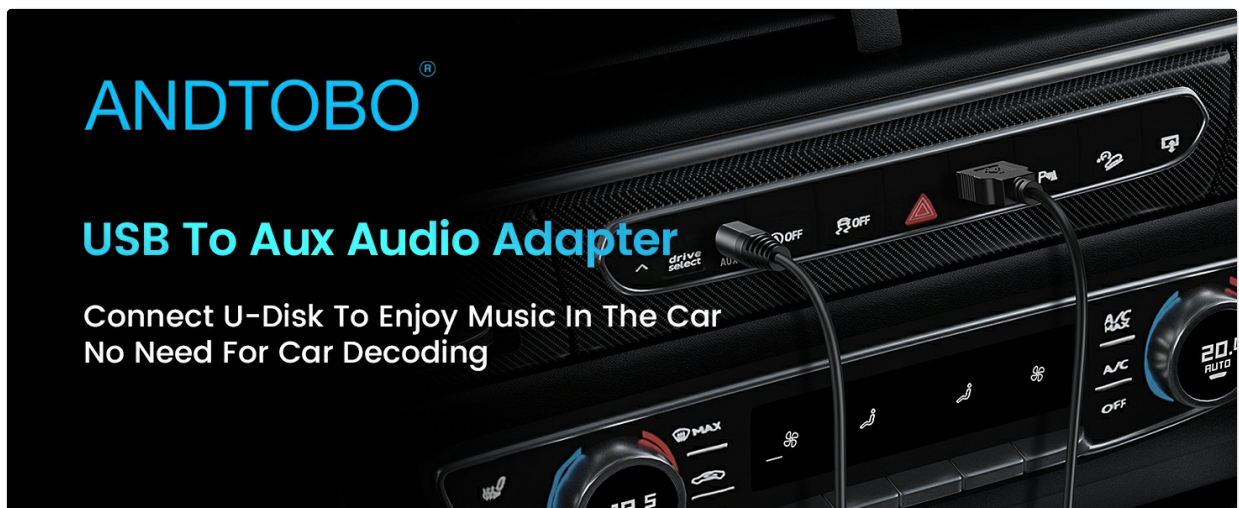
Image: The ANDTOBO USB to Aux Audio Adapter connected to a car's AUX input, with a USB flash drive inserted.

The ANDTOBO USB to Aux Audio Adapter is designed to enable playback of MP3 music files from a USB flash drive through your car's AUX input or older speaker systems with a 3.5mm connector. This adapter acts as an MP3 decoder, converting digital audio from your USB drive into an analog signal for your audio system.