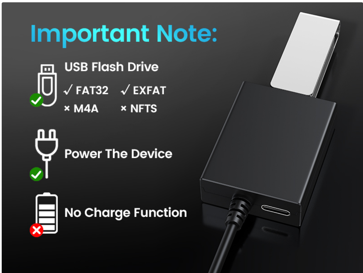
Image: Detailed diagram showing the adapter's ports and connections.