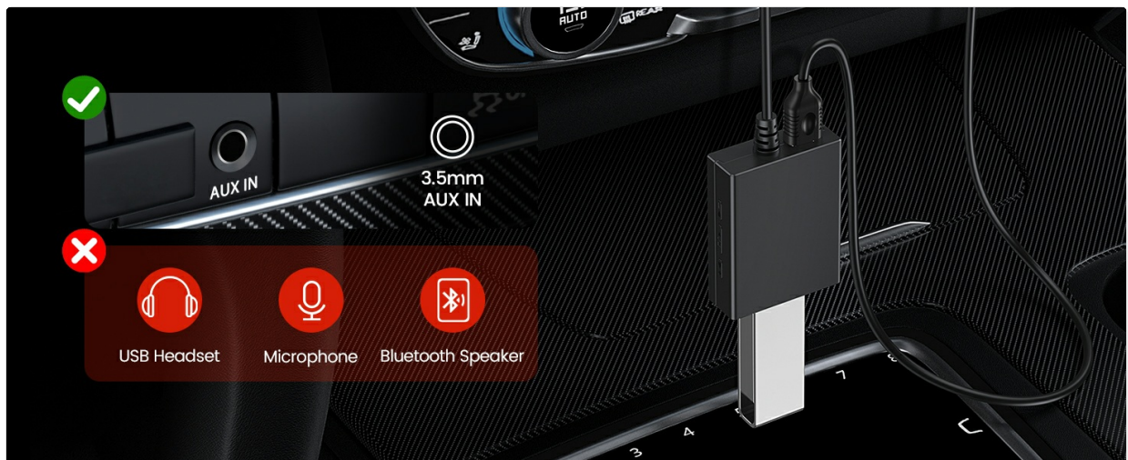
Image: Visual summary of important notes and incompatible devices for the adapter.