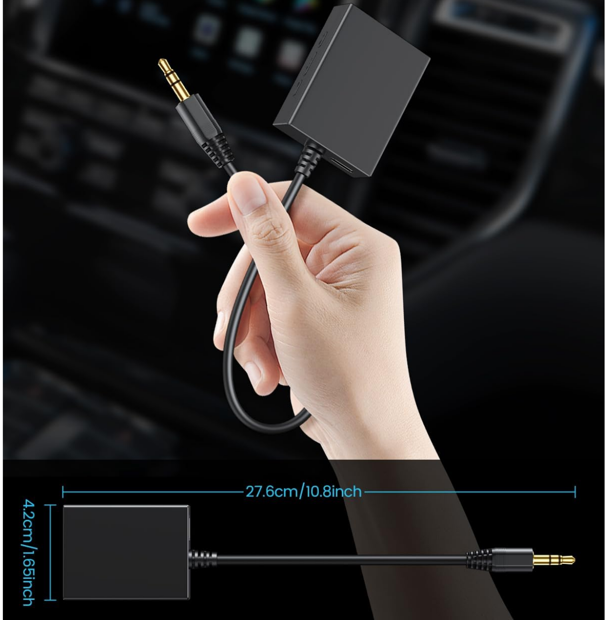
Image: The adapter with its physical dimensions indicated.