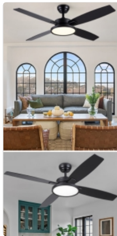
LED Light Board