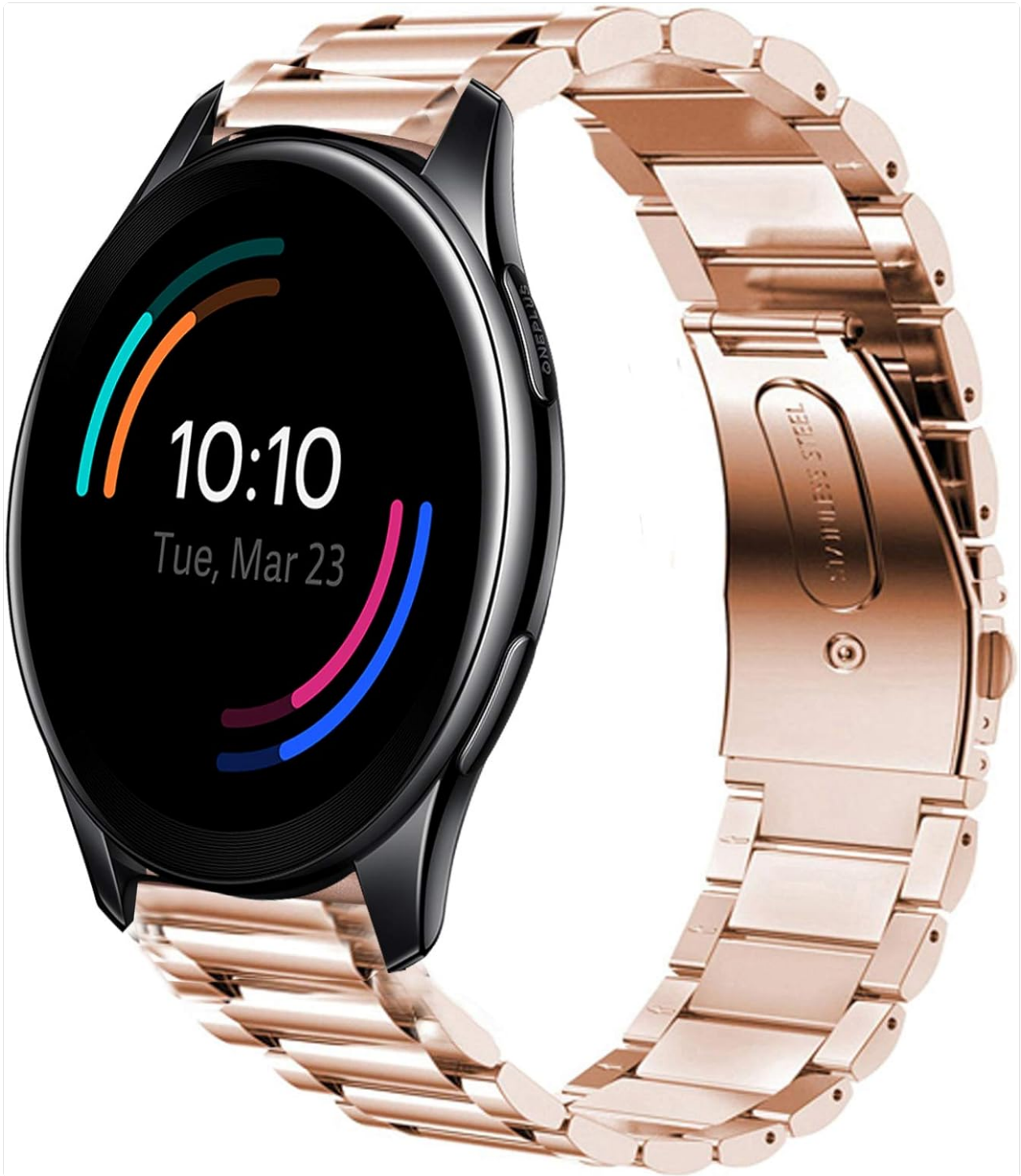
Figure 2.1: OnePlus Watch fitted with the YOUkei Rose Gold Stainless Steel Band.