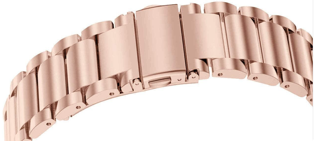
Figure 2.2: Detail of the double button folding clasp, designed for secure locking and easy unlocking.

Security buckle, easily to lock and unlock.