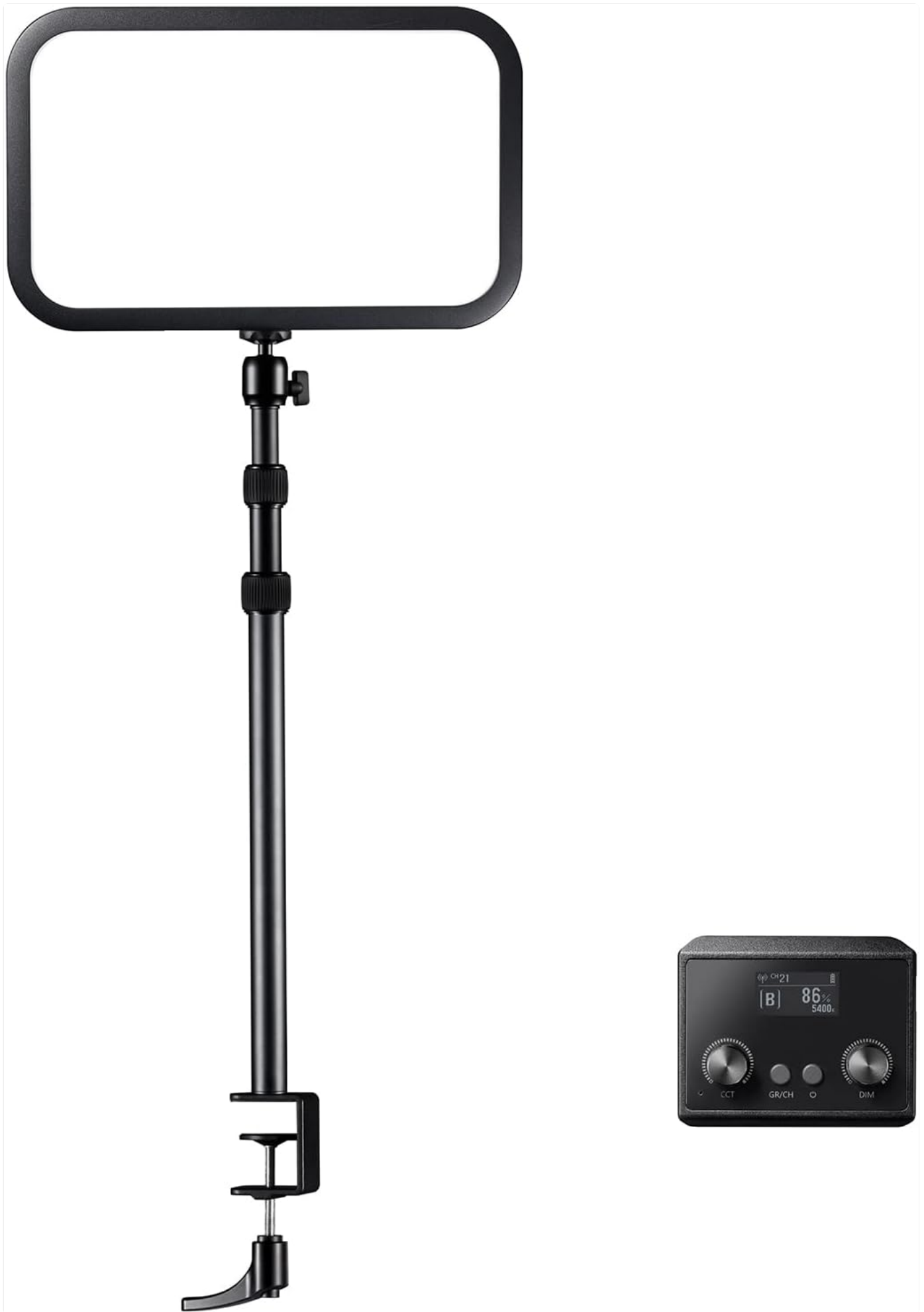
Figure 1.1: Godox ES45 Key Light with its magnetic remote and extendable desk stand.