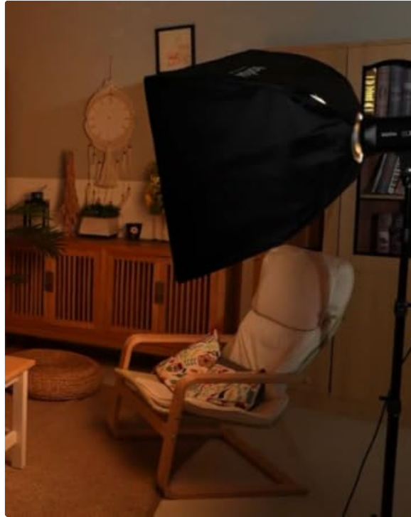
Figure 3.1: Assembly steps for the ES45 Key Light, highlighting 360° rotation, easy adjustment, and fast installation.