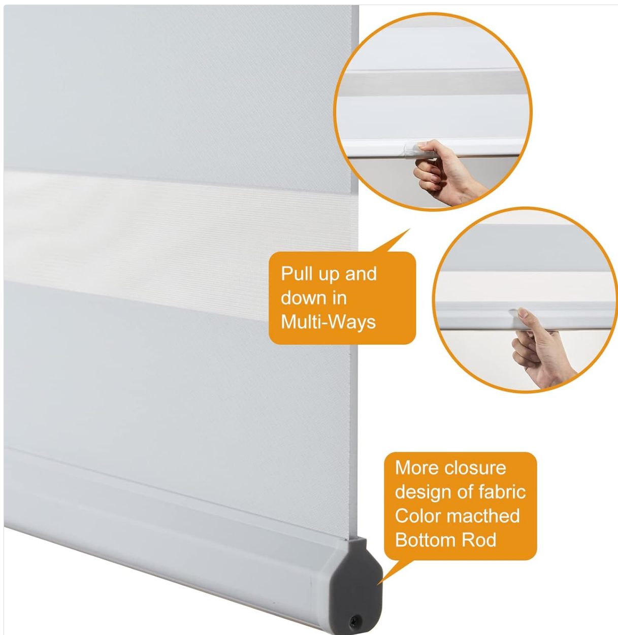
Figure 4: Demonstrating the multi-way pull-up and pull-down operation of the cordless blinds.

Your browser does not support the video tag.