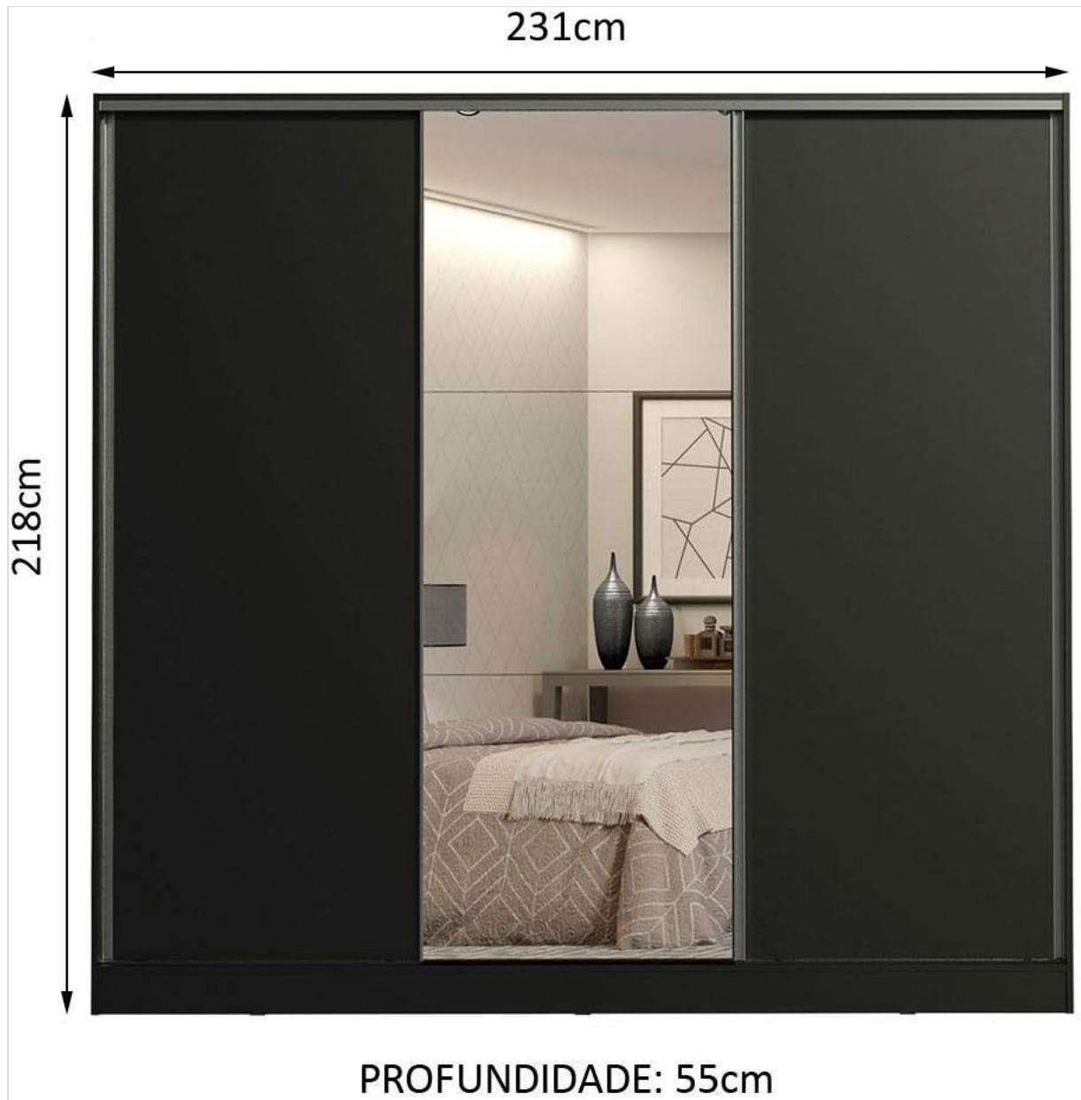
Image 1: Overall dimensions of the Madesa Royale Wardrobe. The wardrobe measures 218 cm in height, 231 cm in width, and 55 cm in depth.