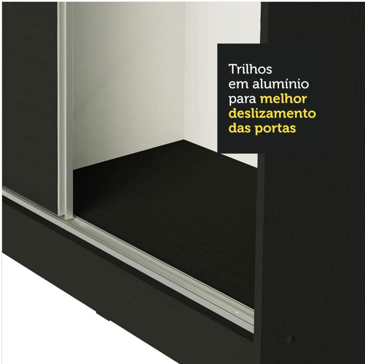
Image 5: View of the aluminum tracks, designed for improved sliding of the doors.