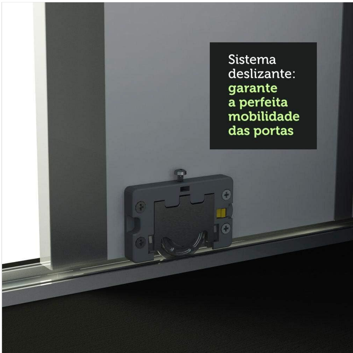
Image 4: Detail of the sliding system, highlighting the mechanism that ensures smooth door mobility and prevents derailment.