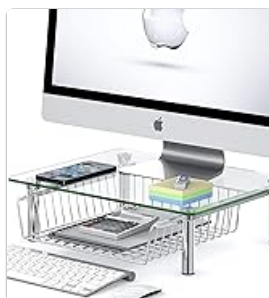
Figure 4.1: Detail of monitor stand installation.