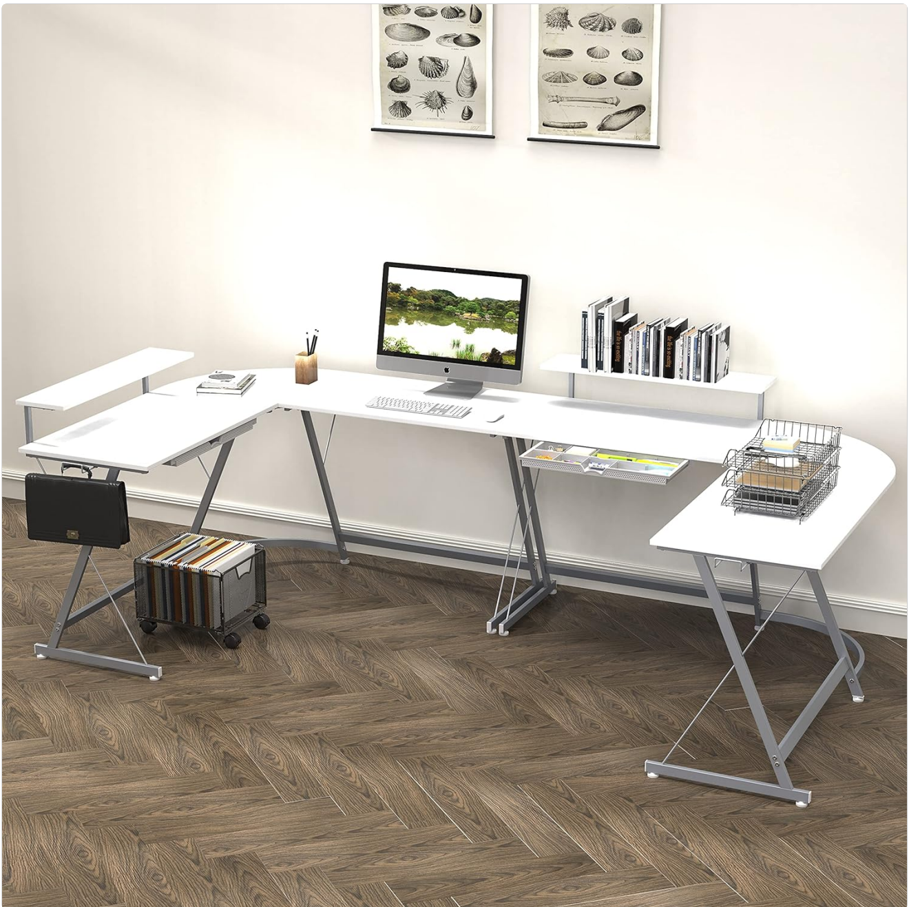
Figure 5.2: The desk configured for a multi-monitor setup in a home office environment.