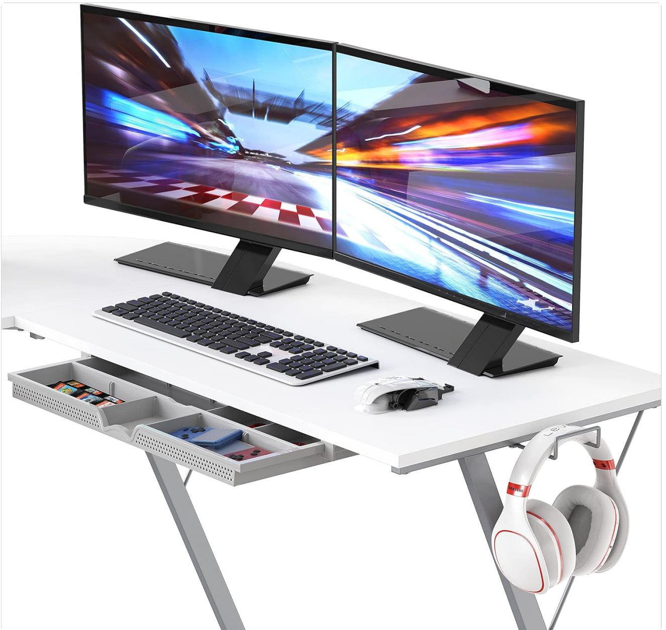
Figure 5.1: Detail of the monitor stand and integrated drawer in use.