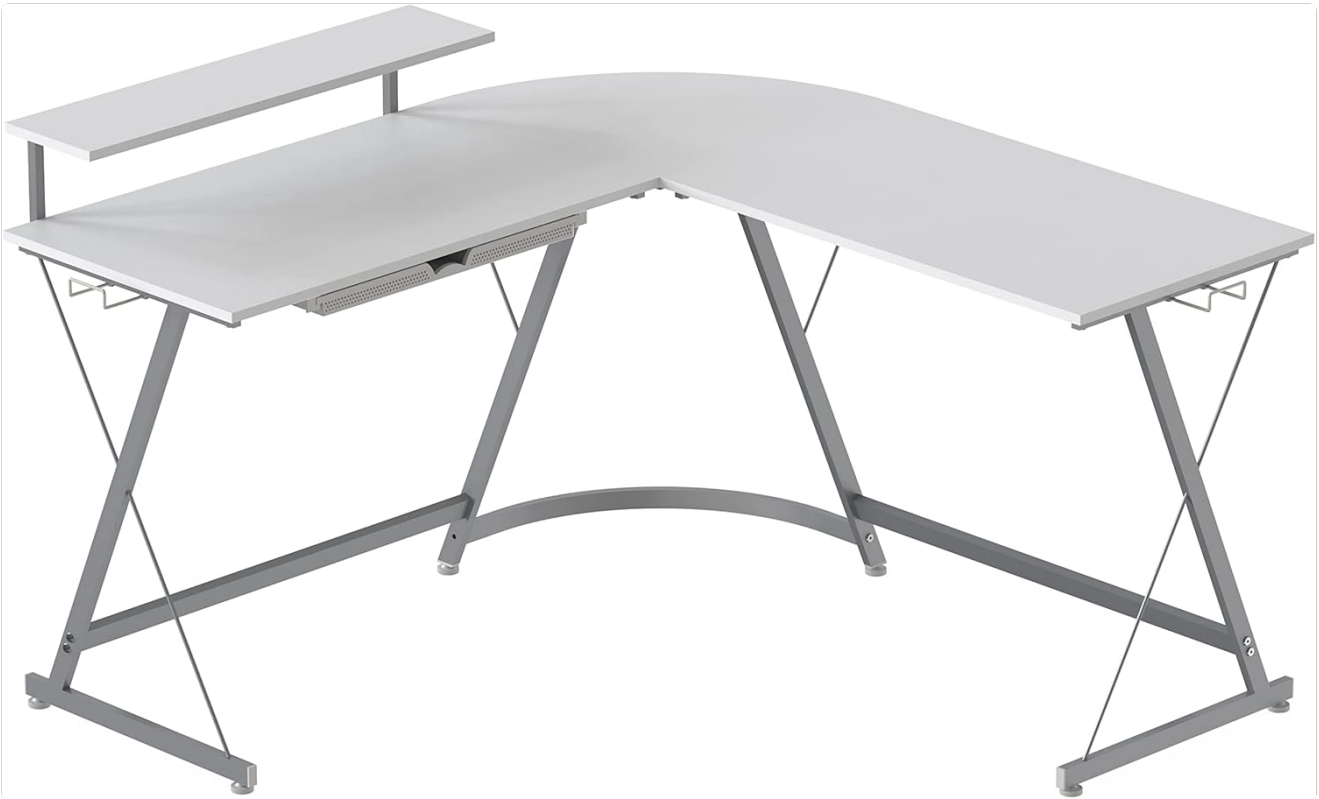
Figure 3.1: Illustration of desk components, including the main desktop sections and metal support structure.