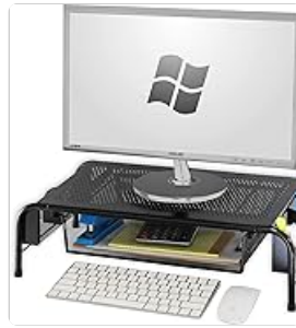
Figure 4.2: Detail of the integrated storage drawer.