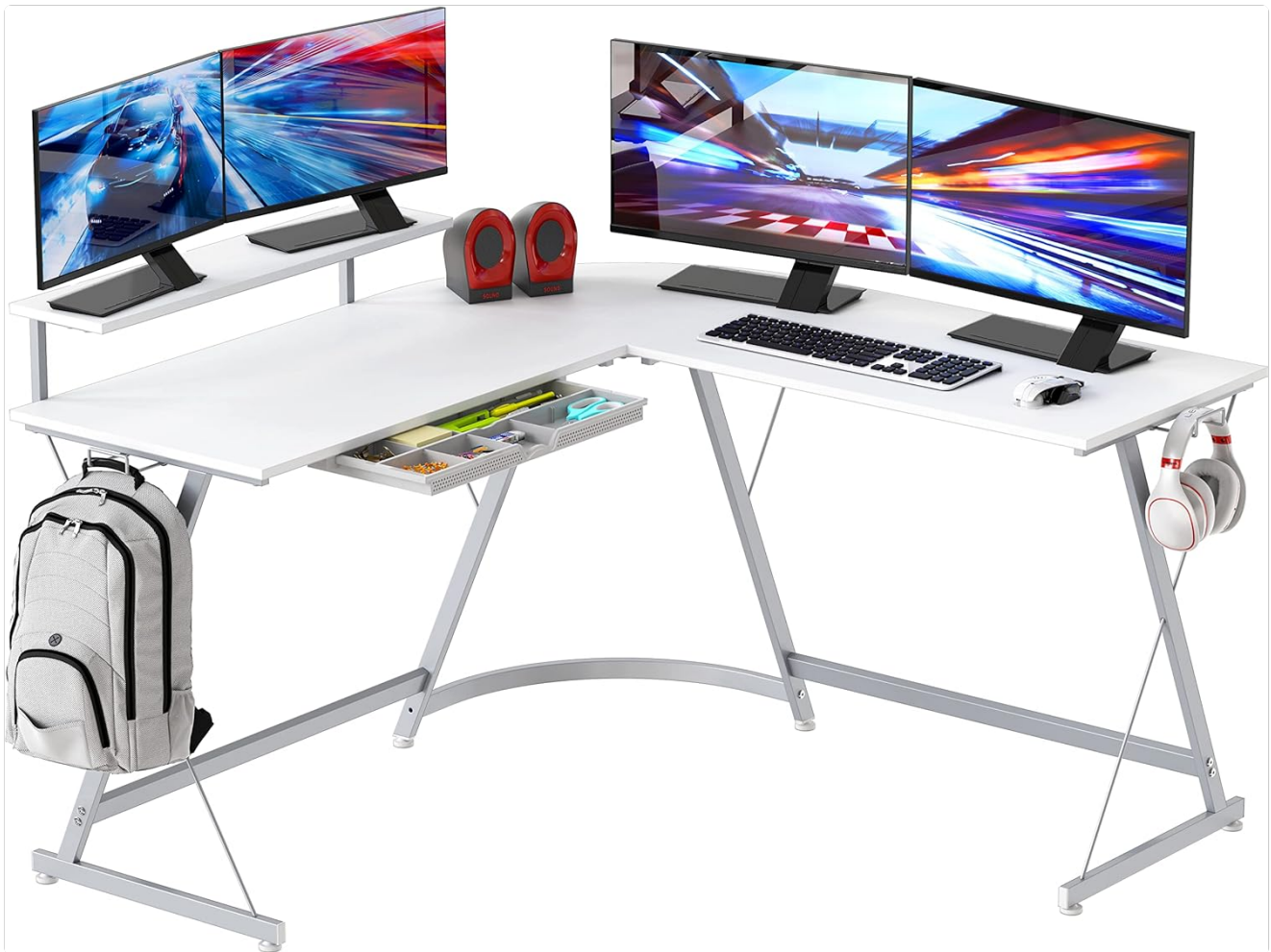
Figure 1.1: Overview of the SHW Vista L-Shaped Desk, showcasing its spacious design and integrated features.