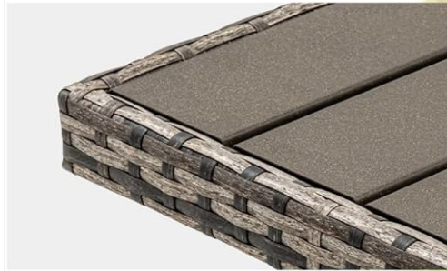
Iron Slats Table Top