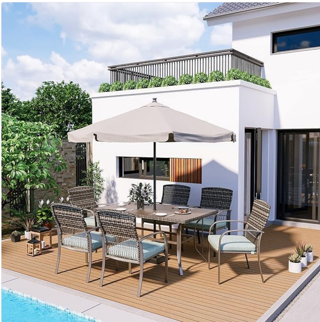
Image: The patio dining set positioned on a wooden deck, demonstrating its use with an outdoor umbrella for shade.