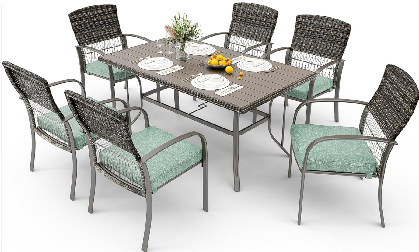
Image: The complete Pamapic 7-Piece Patio Dining Set, showcasing the rectangular table and six chairs with green cushions.

The Pamapic 7-Piece Patio Dining Set is designed for outdoor use, providing a comfortable and durable dining solution for your backyard, garden, deck, or poolside area. It features an iron slats table top, PE rattan chairs with removable cushions, and a sturdy construction built to withstand various weather conditions.