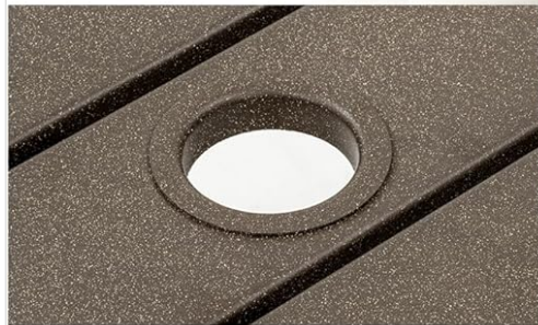
Hole of umbrella