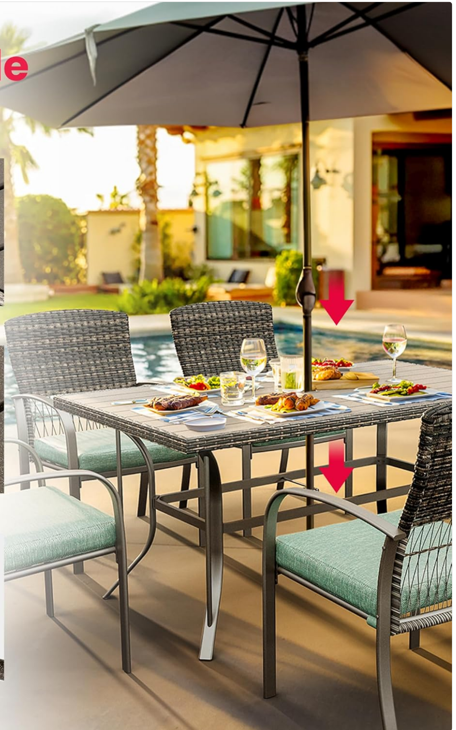
Image: Detailed view of the iron slats table top and the integrated umbrella hole, highlighting the durable construction.