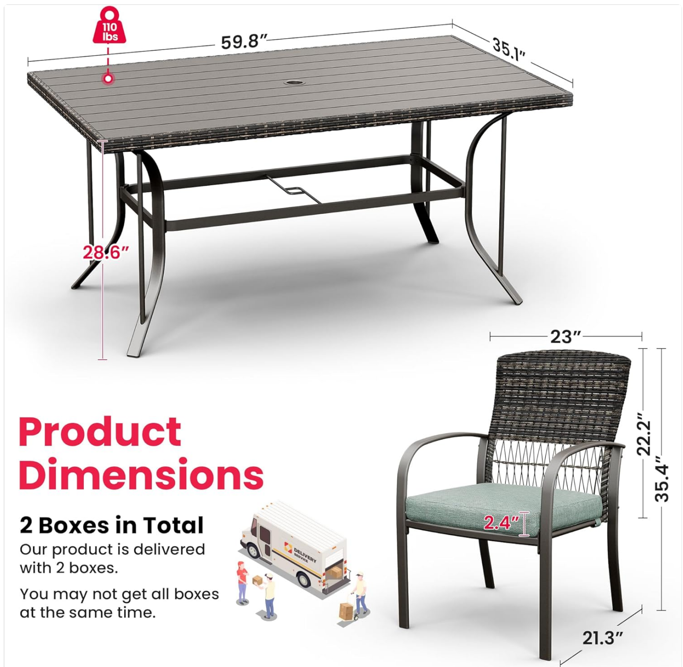
Image: Diagram showing the dimensions of the table and chair, and indicating that the product ships in two boxes.