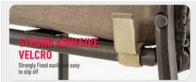
Image: Close-up of the strong adhesive Velcro strap on the cushion, designed to keep it firmly fixed and prevent slipping.