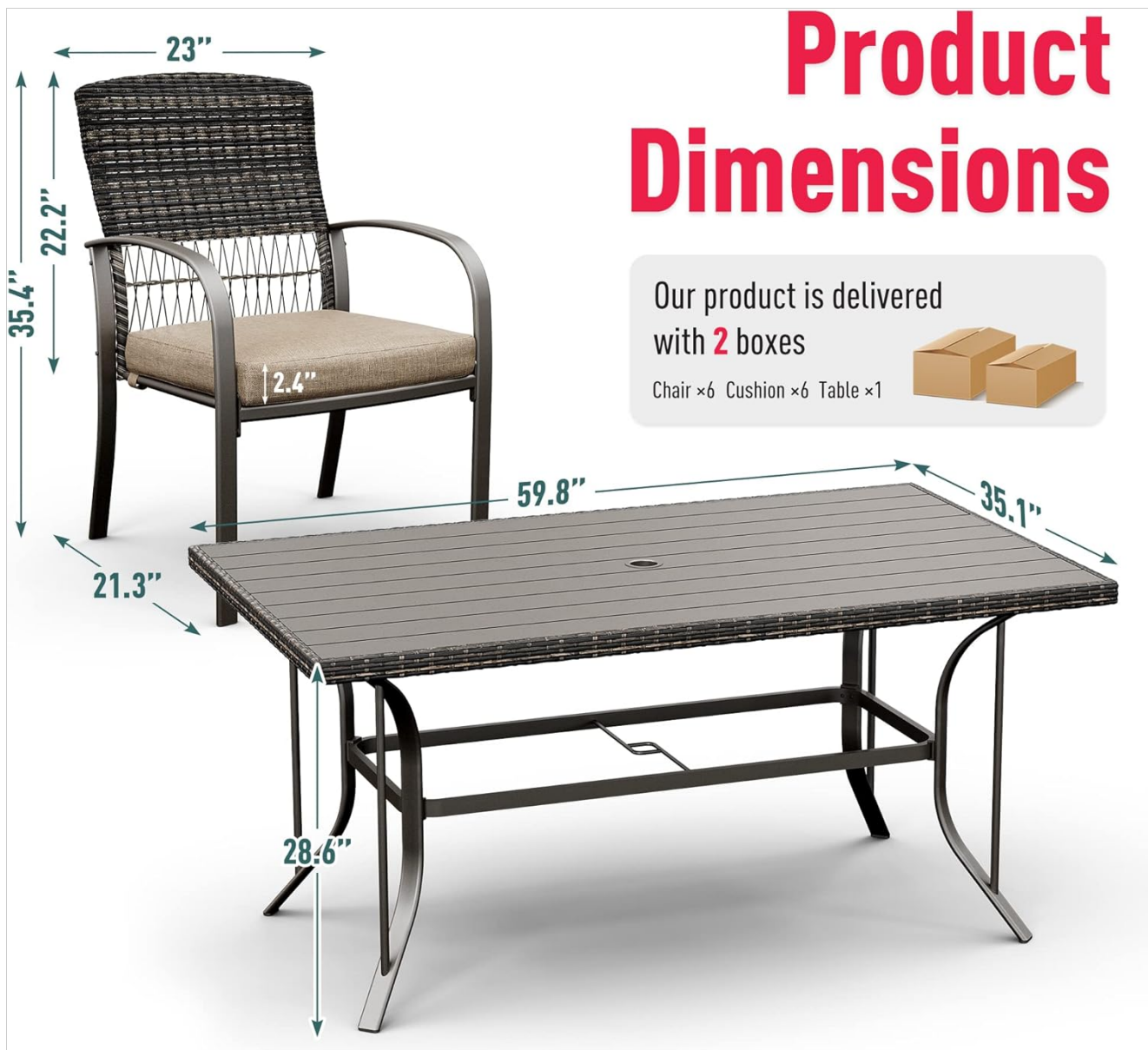
Image: A diagram illustrating the detailed dimensions of both the dining table and a single chair, including length, width, height, and cushion thickness.