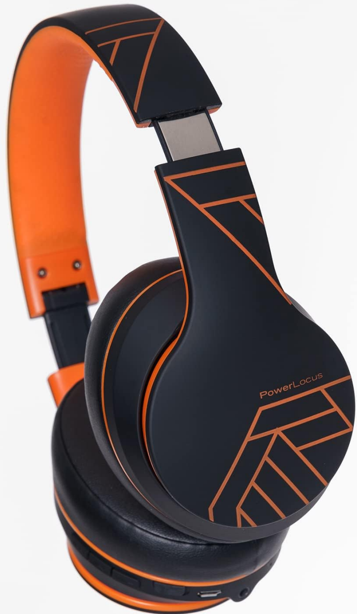
Image: Visual representation of the main features of the PowerLocus P6 headphones.