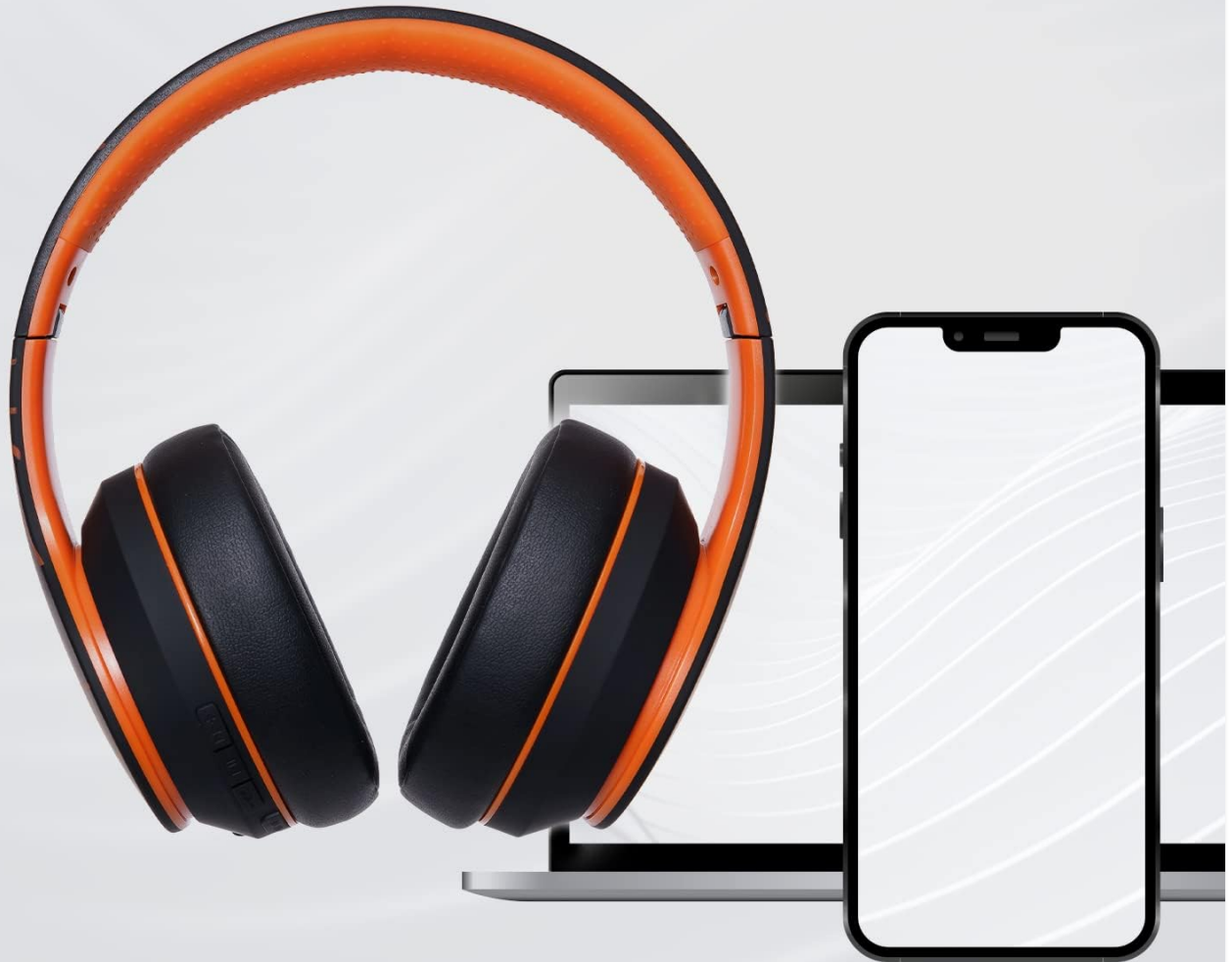
Image: Illustrating the multi-point connection feature, allowing simultaneous connection to two devices.