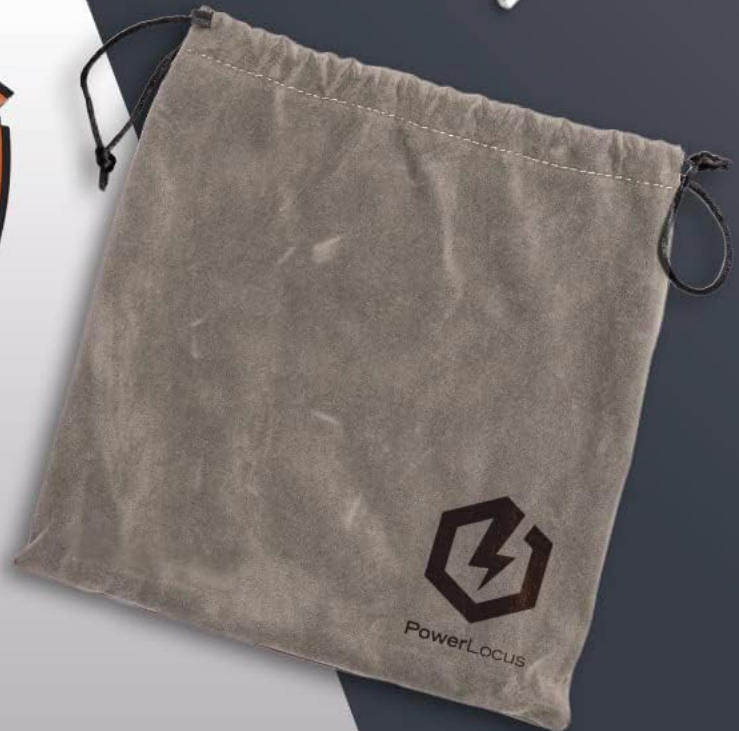
Image: PowerLocus P6 headphones folded and stored in their protective pouch.