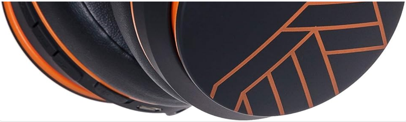
Image: Front view of the PowerLocus P6 Wireless Bluetooth Headphones.