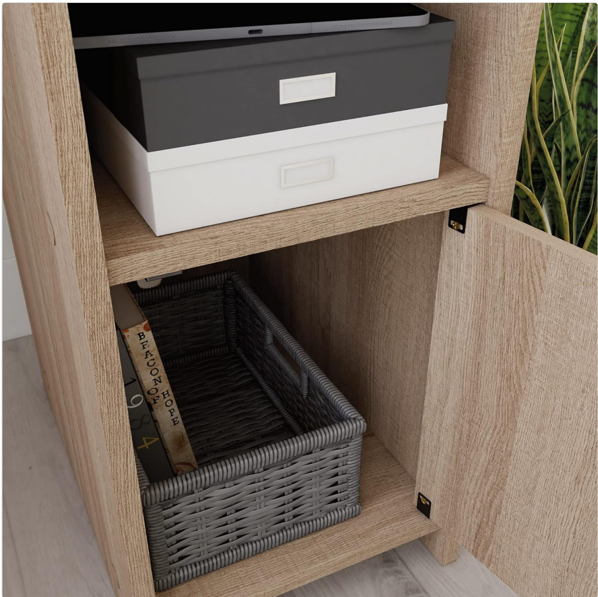
Image: The interior of the hidden storage compartment, illustrating its capacity for various office supplies or personal items.