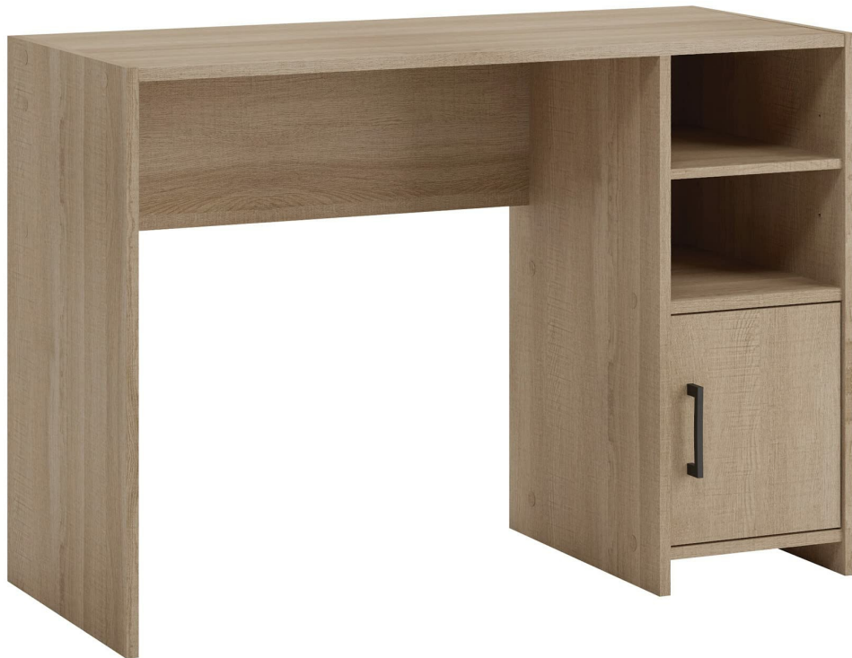
Image: The Sauder Beginnings Desk, featuring a spacious top surface and integrated storage, presented in a Summer Oak finish.