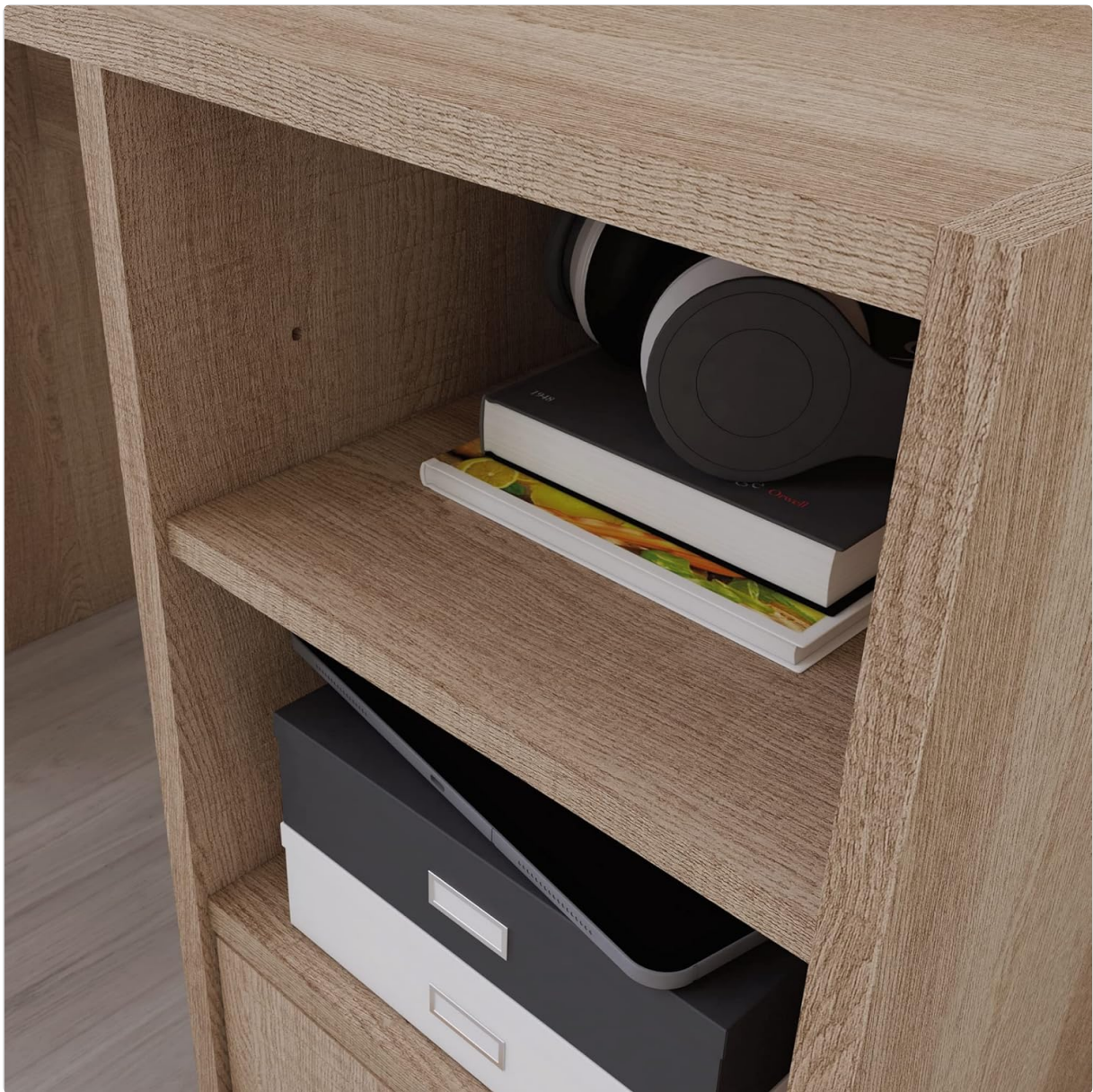
Image: A detailed view of the desk's open shelving, designed to accommodate various items like books or accessories.