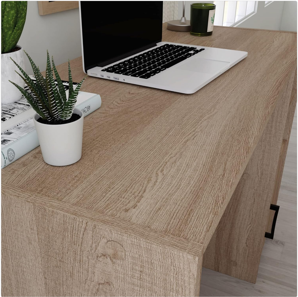
Image: A close-up of the desk's work surface, demonstrating its capacity for a laptop and other small items, showcasing the Summer Oak finish.