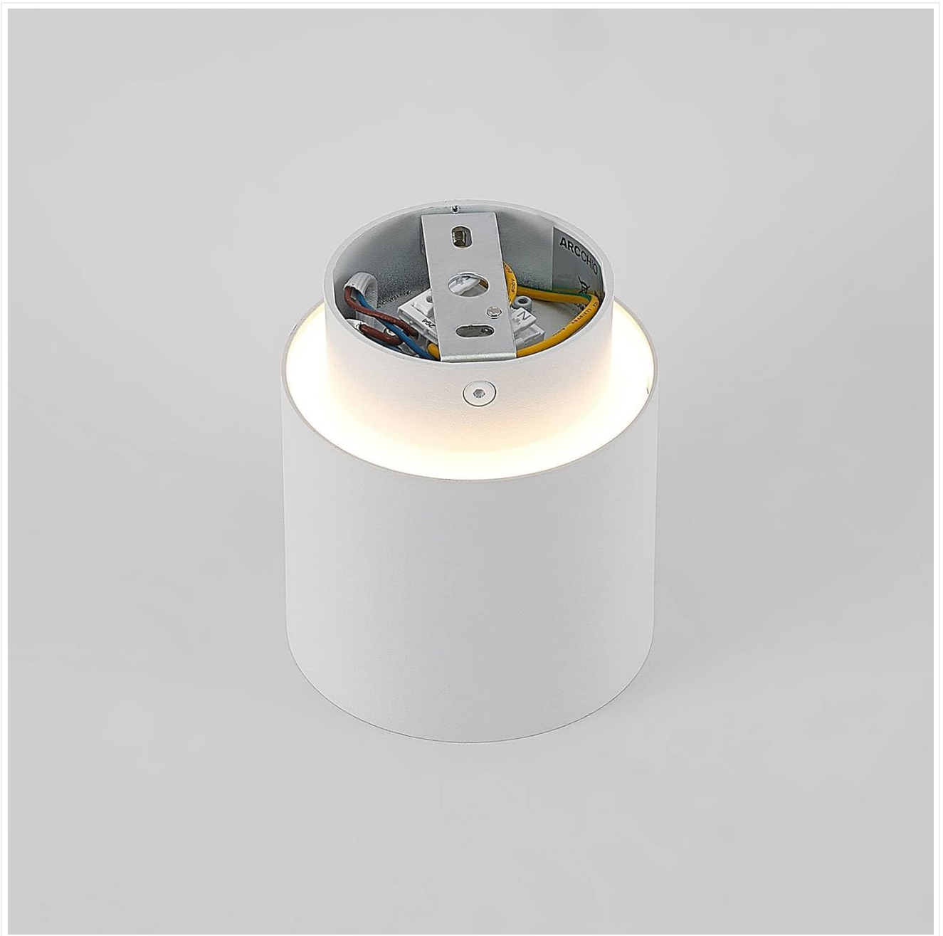
Figure 2: Internal wiring connections of the lamp. Ensure proper connection of Live, Neutral, and Ground wires.