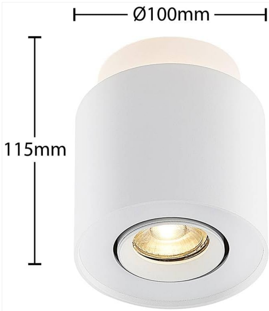
Figure 6: Dimensions of the Arcchio 'Walisa' Ceiling Lamp.

Detailed technical specifications for the Arcchio 'Walisa' Ceiling Lamp.