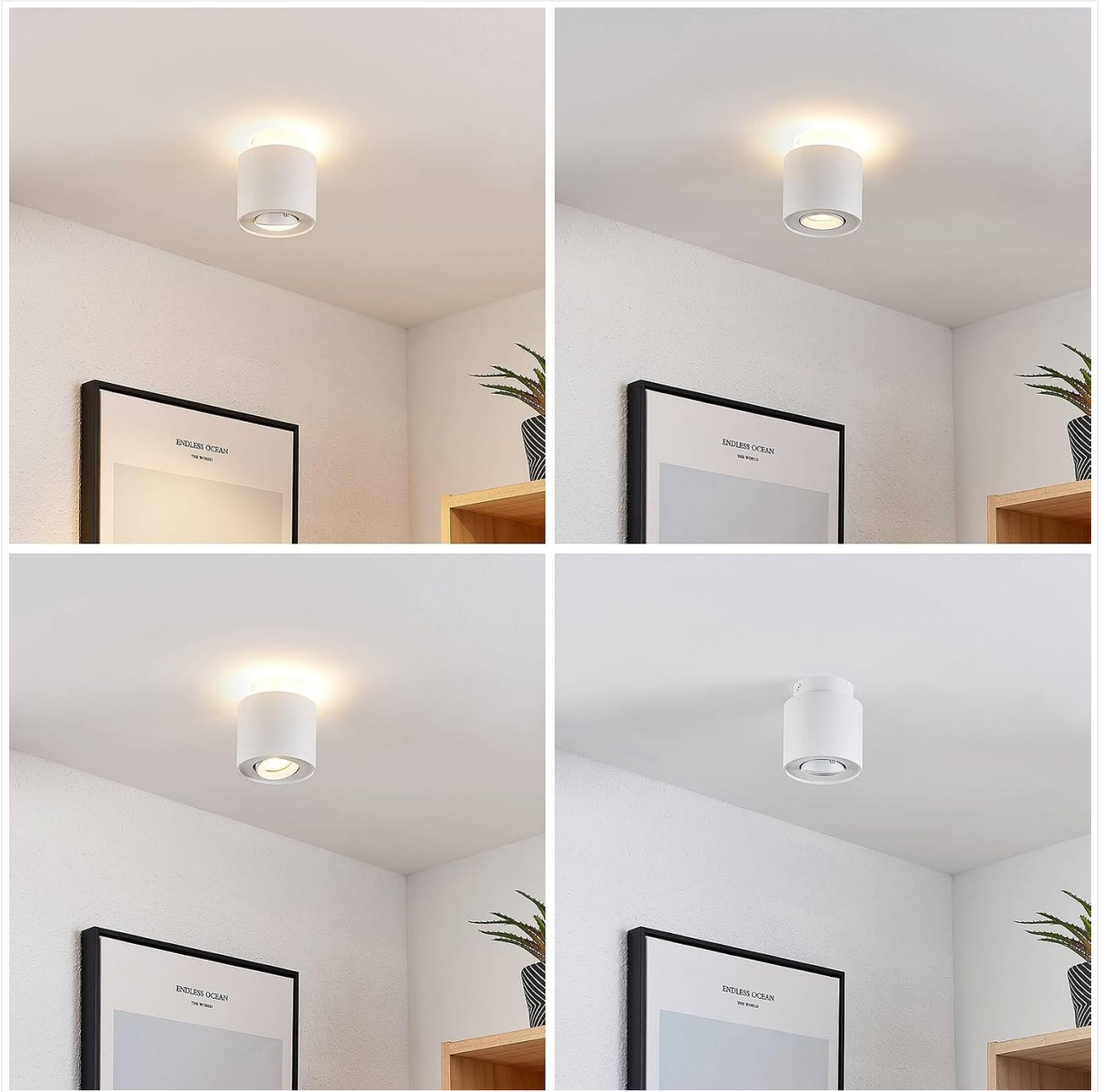
Figure 5: Examples of the lamp's light output and appearance in various settings.