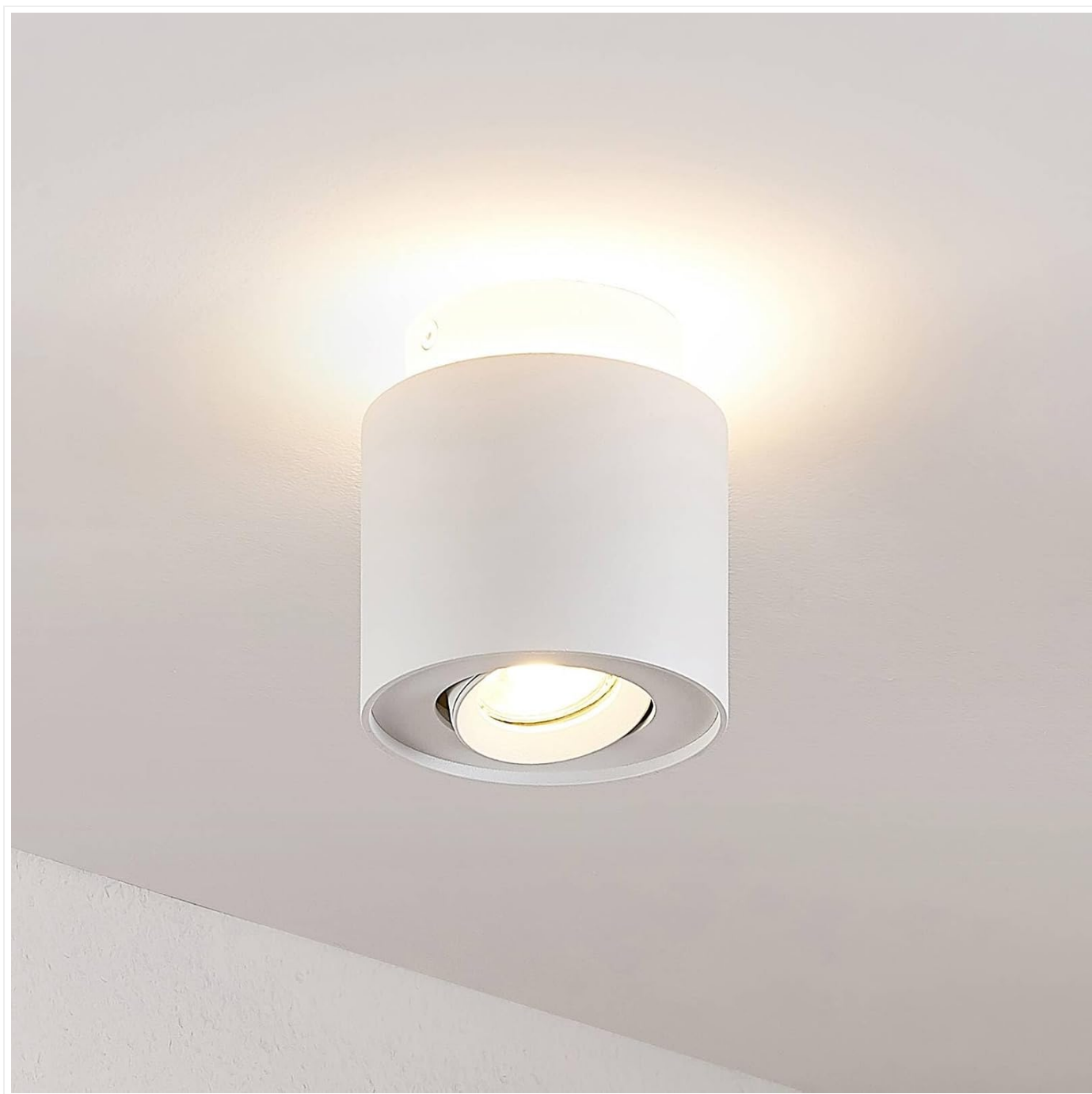
Figure 4: The Arcchio Walisa Ceiling Lamp installed and illuminated, showing both upward and downward light.