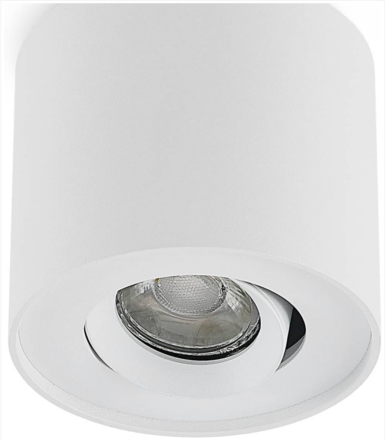
Figure 3: Close-up of the GU10 socket where the bulb is inserted.