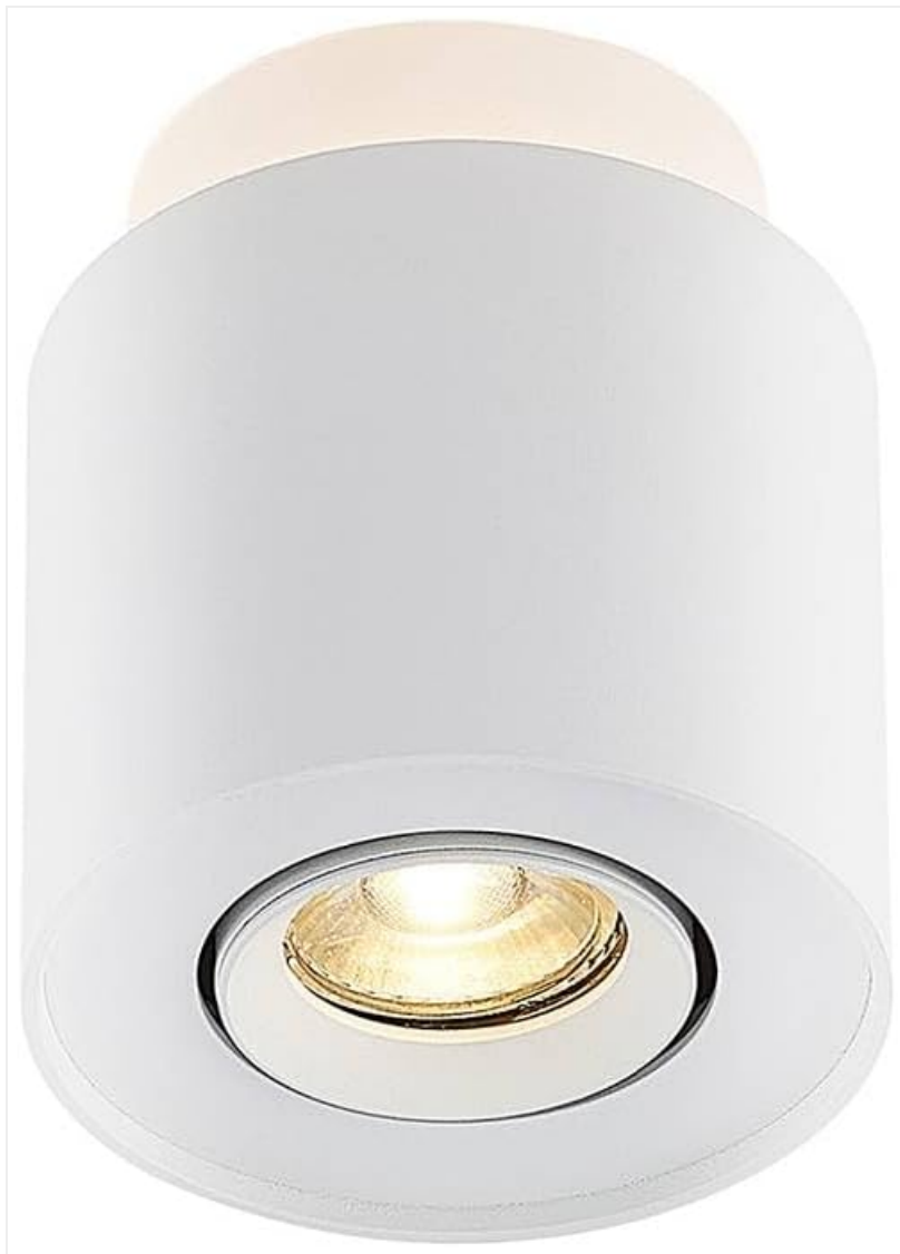
Figure 1: Arcchio 'Walisa' Ceiling Lamp, a modern white aluminum fixture.