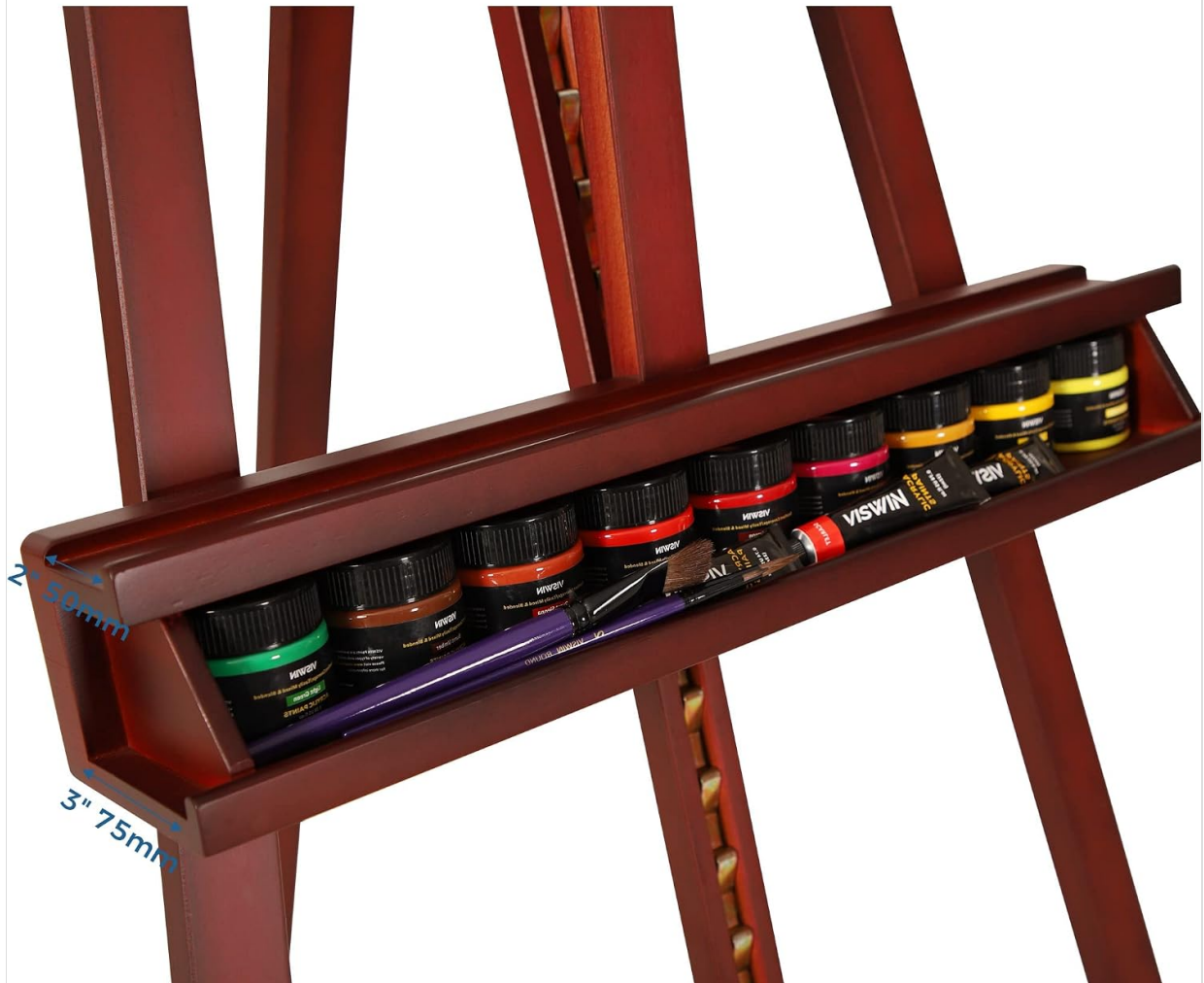
Image: A detailed view of the easel's double-layer tray, which is 75mm (approximately 3 inches) deep, providing ample space to organize and store various art supplies like paints and brushes.