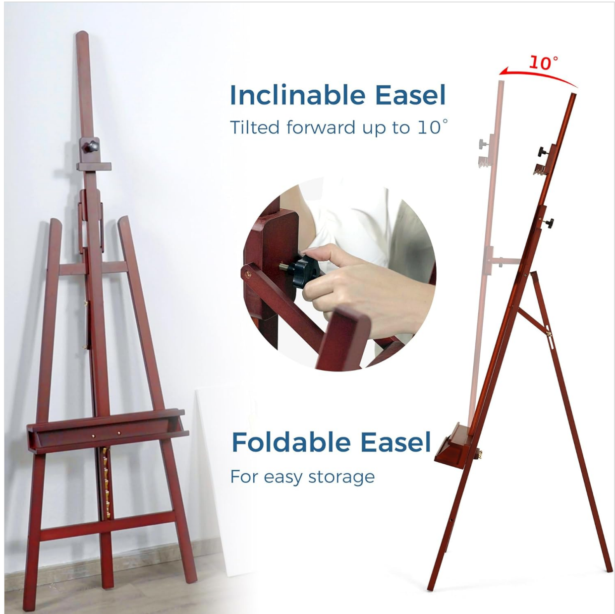
Image: This image displays two key features: the easel's ability to tilt forward by up to 10 degrees to reduce glare, and its foldable design for convenient transport and compact storage.

The central mast can be tilted forward by up to 10 degrees. This feature helps reduce glare on your artwork and improves visibility, especially useful for pastels or glare-sensitive work. Locate the adjustment knob on the side of the mast, loosen it, adjust to the desired angle, and then tighten securely.