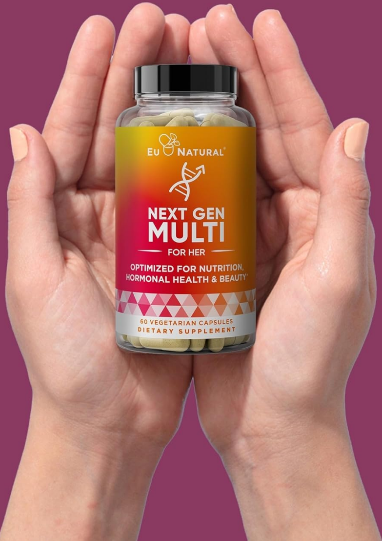
Image: Hands gently holding the multivitamin bottle, with a list of supported health areas: Immunity, Bones, Eyes, Fertility, Skin, Energy, Metabolism, and Heart Health. Text indicates "All in just 1 daily serving."

Video: An official product video from Eu Natural titled "Essentials Multivitamin for Women". This video provides a visual overview of the product, its key benefits, and how it supports women's health, including filling nutritional gaps and supporting immunity, brain, energy, bones, and heart.