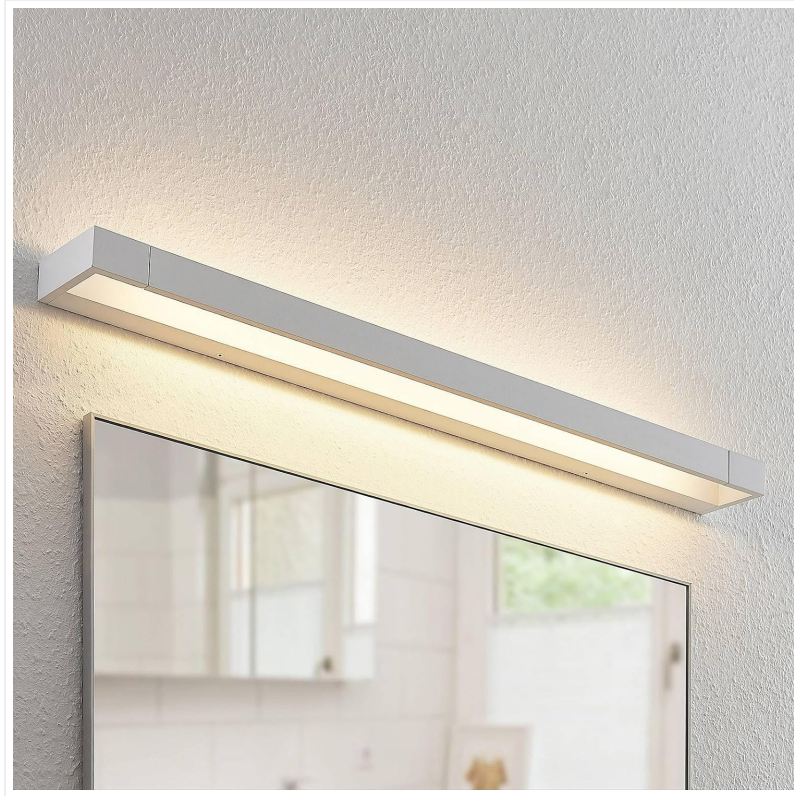
Image: The Arcchio Jora LED Wall Light installed above a bathroom mirror, providing bright, even illumination.

8. Restore Power: Once installation is complete, restore power at the main fuse box.