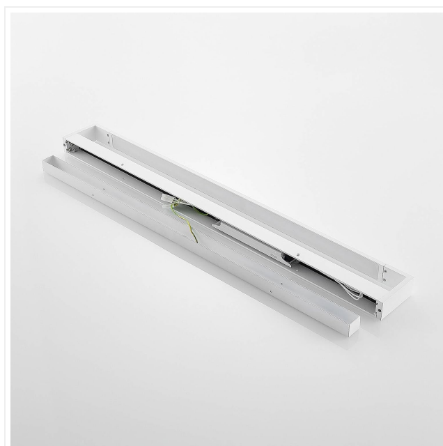
Image: Internal view of the Arcchio Jora LED Wall Light, showing the wiring compartment and integrated LED strip.