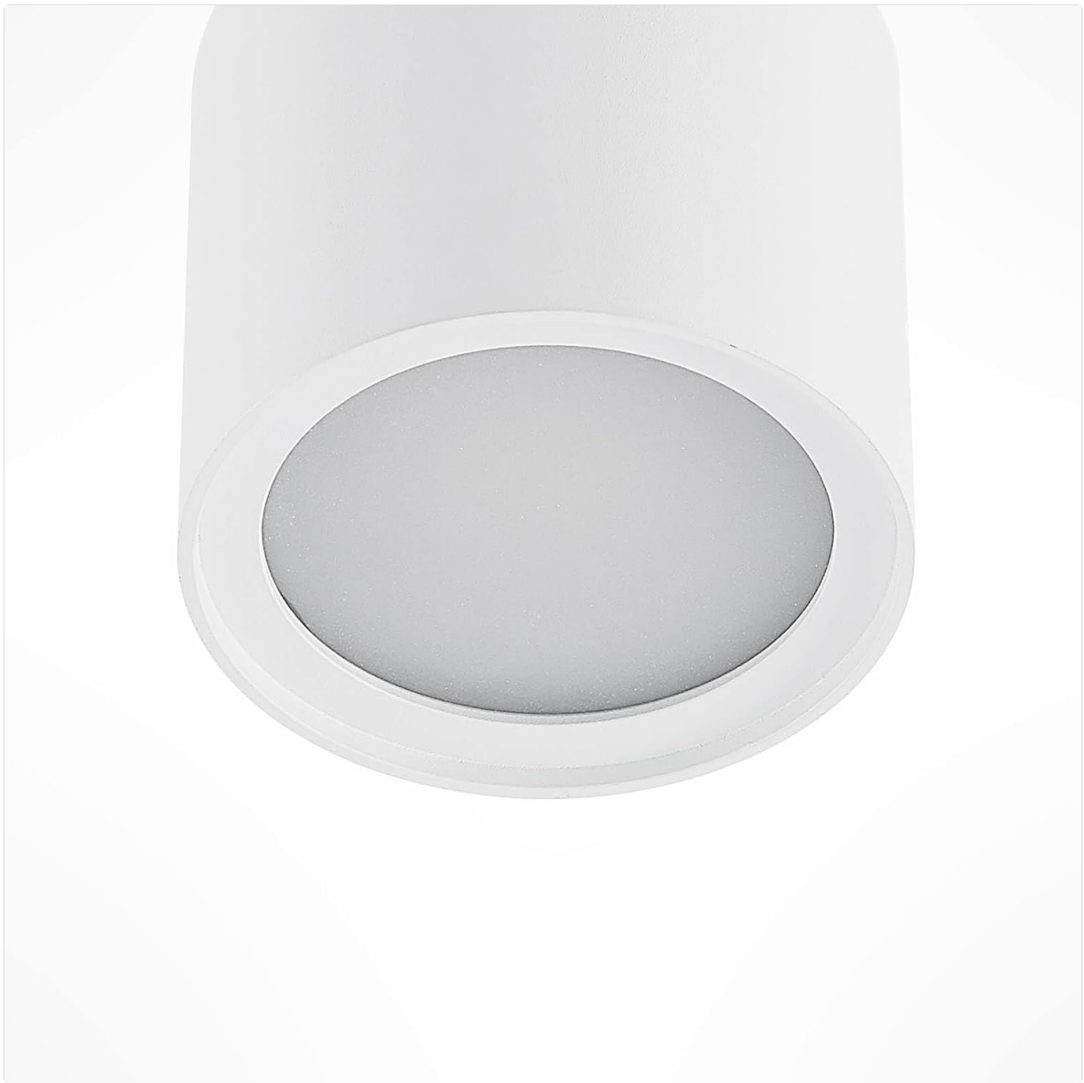
Image: Detailed view of the spotlight's light source housing, showing the GU10 bulb area.