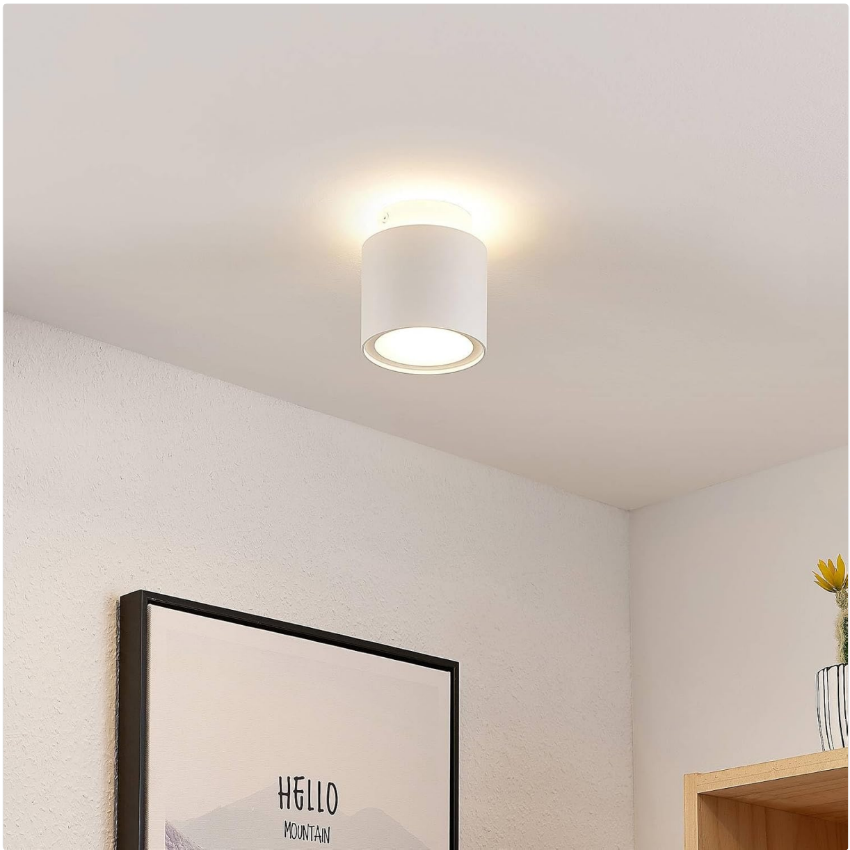
Image: Arcchio Walisa Spotlight illuminated in a room, showcasing its modern design and light output.