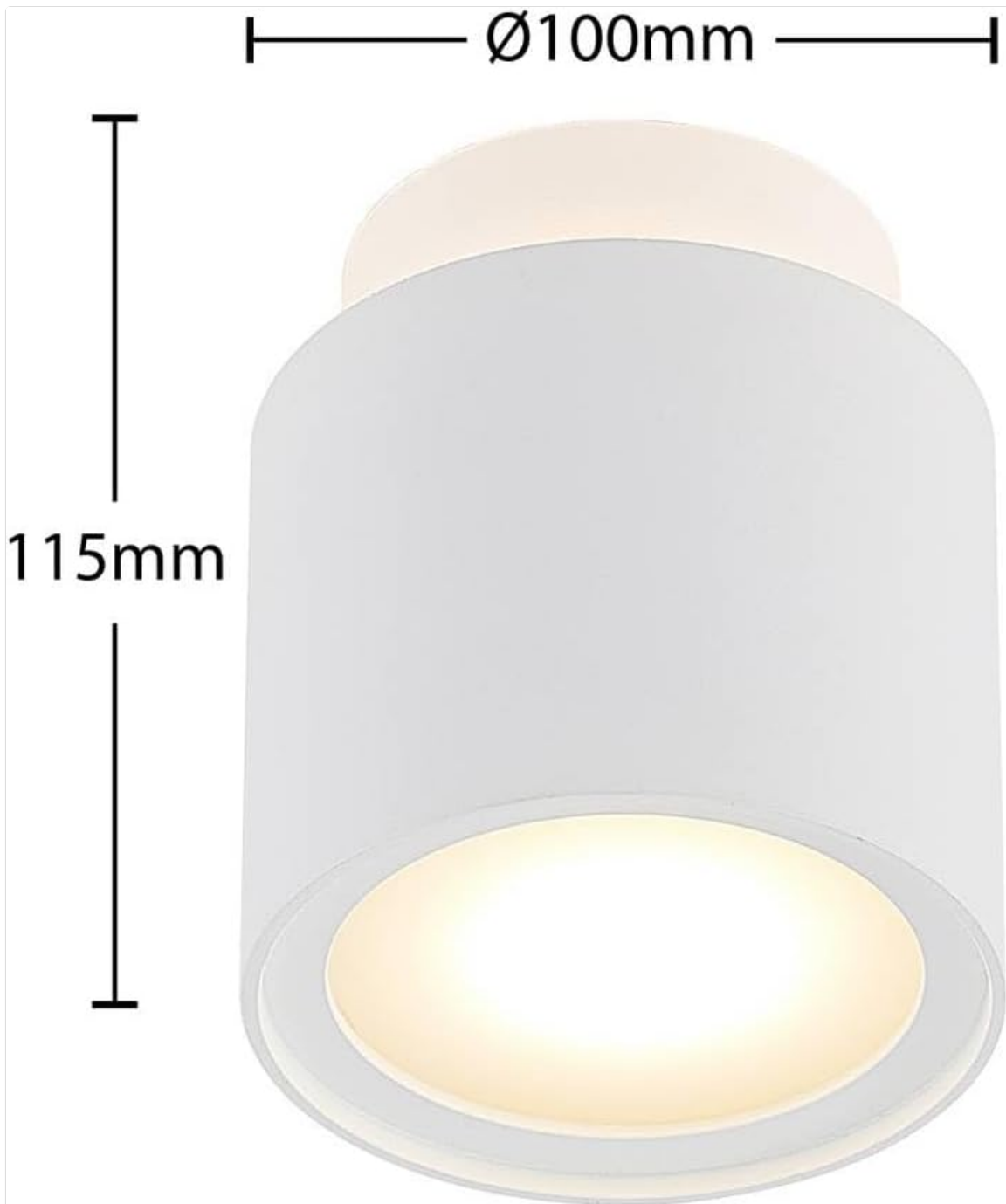
Image: Technical drawing illustrating the dimensions of the Arcchio Walisa Spotlight (100mm diameter, 115mm height).