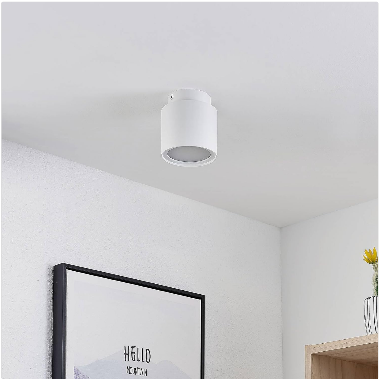
Image: Arcchio Walisa Spotlight mounted on a ceiling, unlit, showing its sleek design.