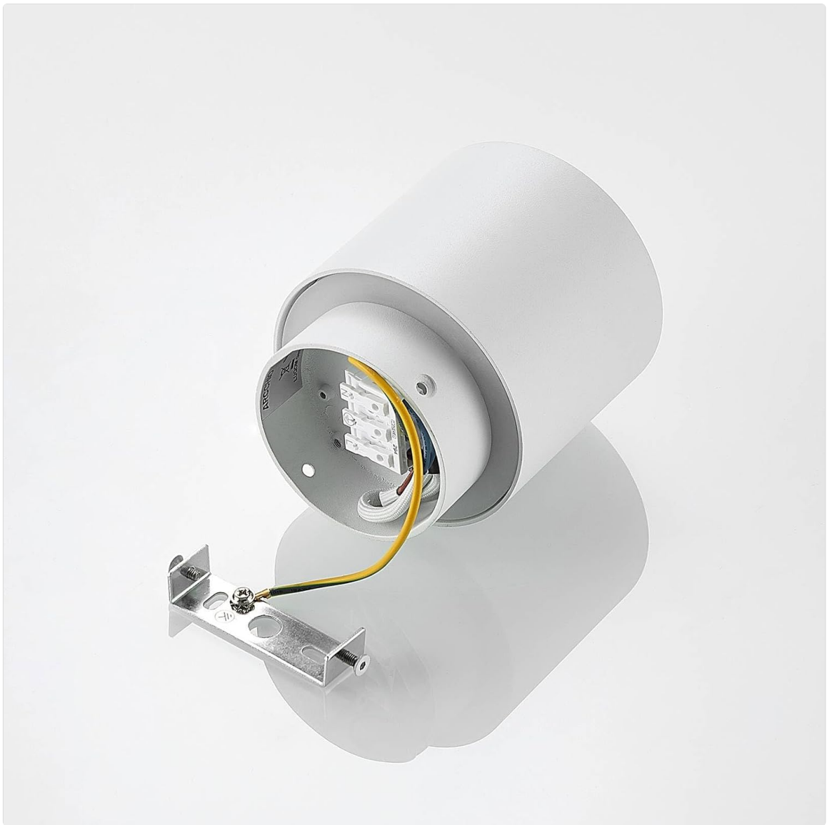
Image: Internal view of the spotlight showing electrical connections and the terminal block.