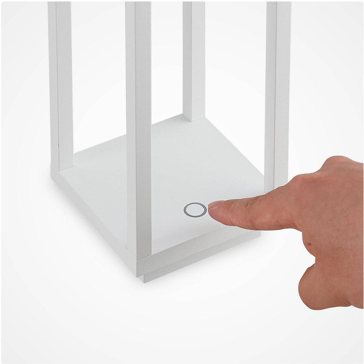
A finger interacting with the touch dimmer control on the base of the Lucande Mirina Lantern.