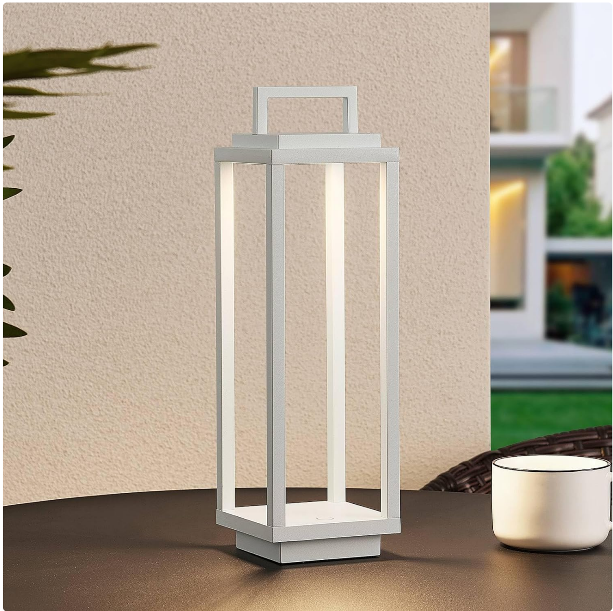
Lucande Mirina LED Lantern illuminated on an outdoor table.