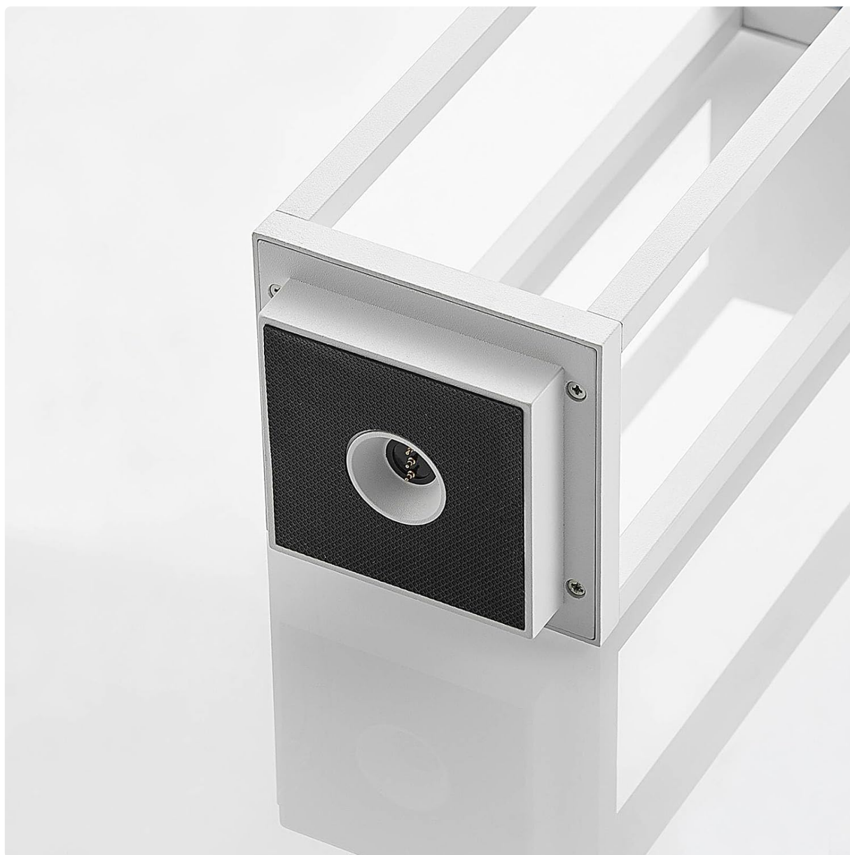
Underside of the Lucande Mirina Lantern showing the magnetic charging contact.