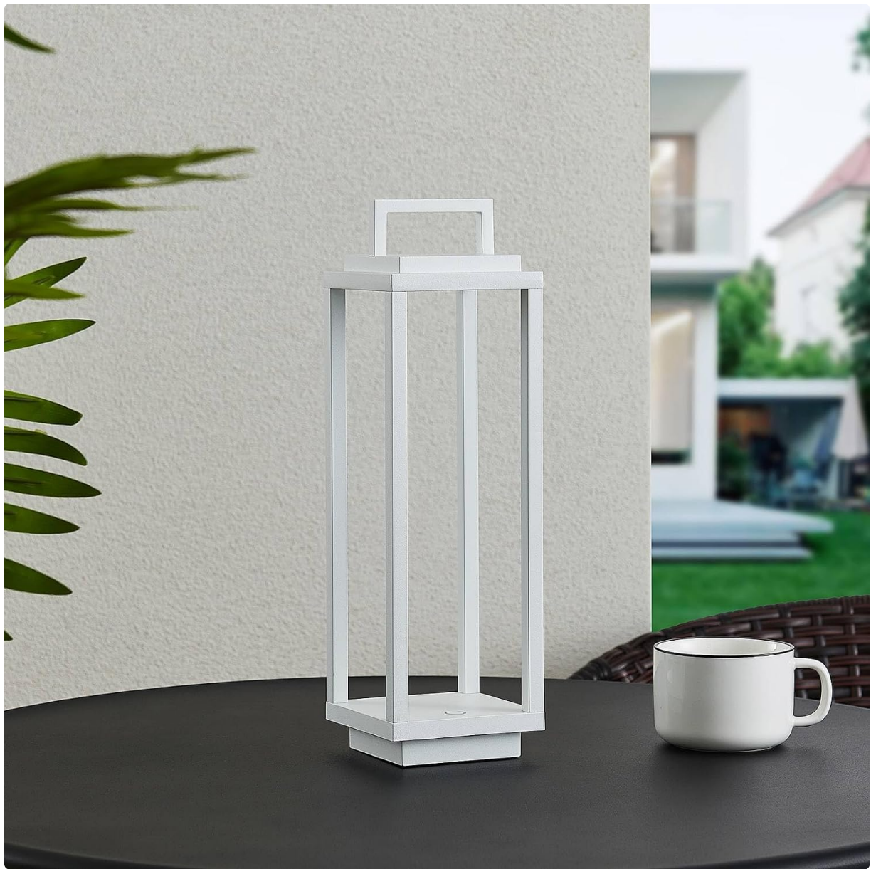
Lucande Mirina LED Lantern unlit on an outdoor table.