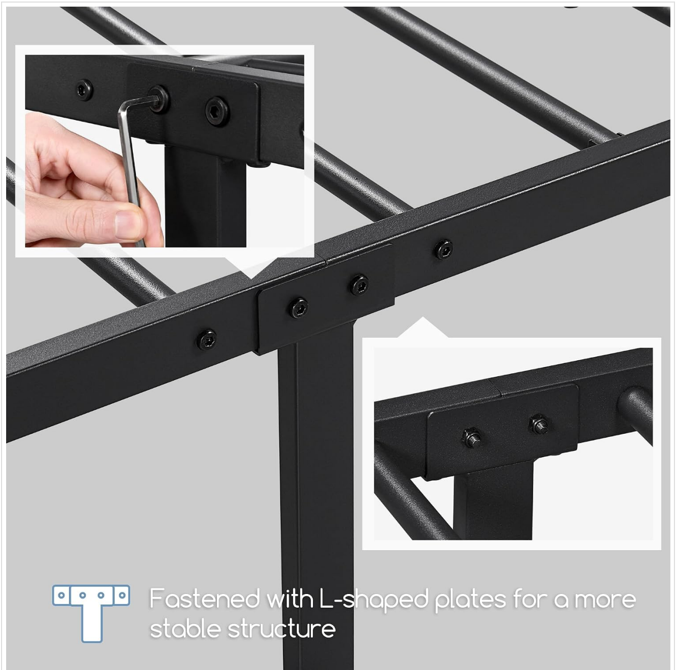
Figure 2: L-shaped plates ensure a stable structure.