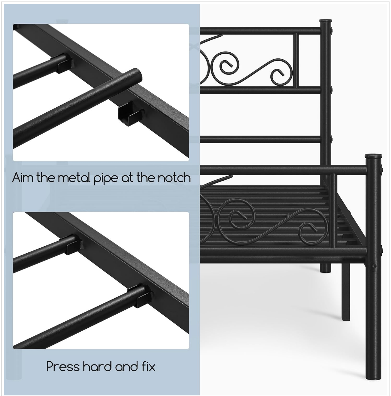
Figure 3: Proper installation of metal slats.