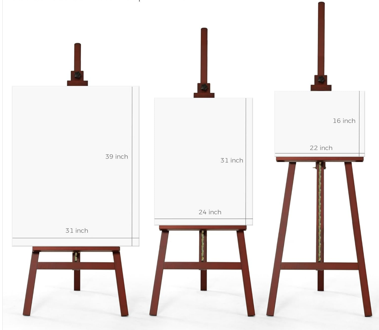
Image: The easel demonstrating adjustable angles and its foldable design for storage.