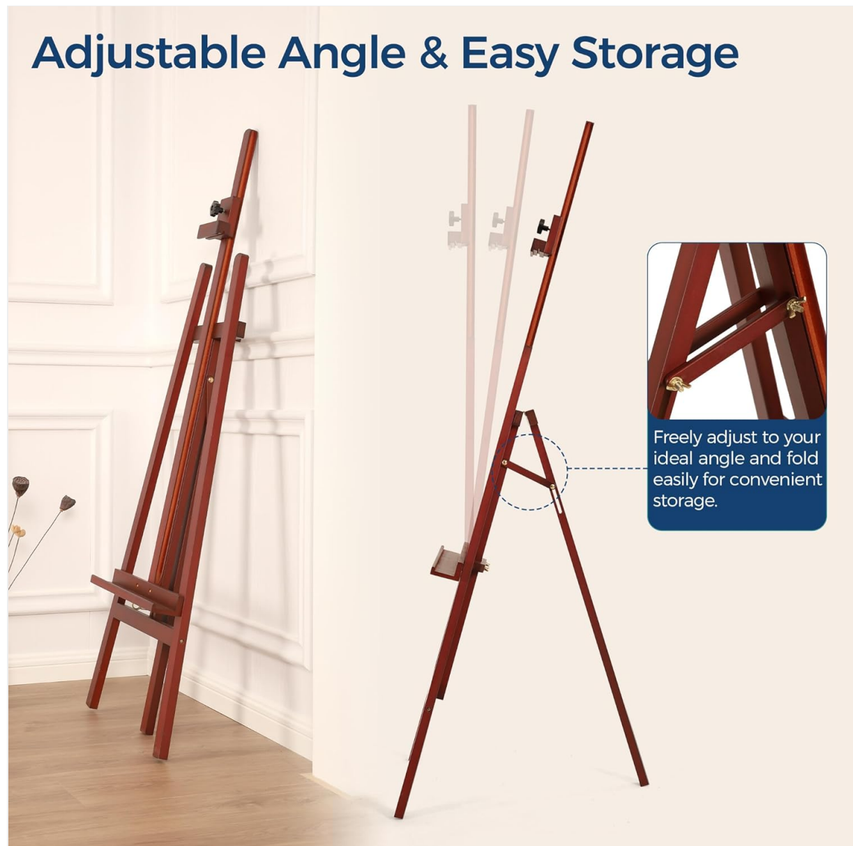
Image: Visual representation of the easel's adjustable height for various canvas sizes.

The top slider can be moved along the central mast to accommodate canvases up to 43 inches in length. Loosen its knob, slide to position, and re-tighten.