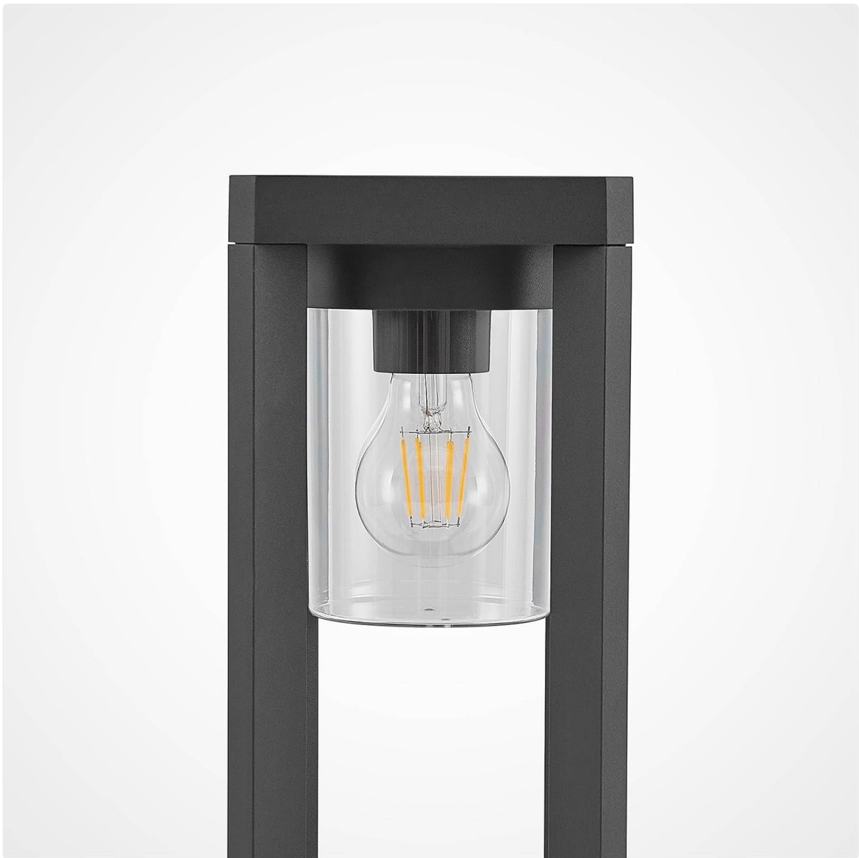
Figure 4: Bulb installation area, showing the E27 bulb socket within the protective glass cylinder.