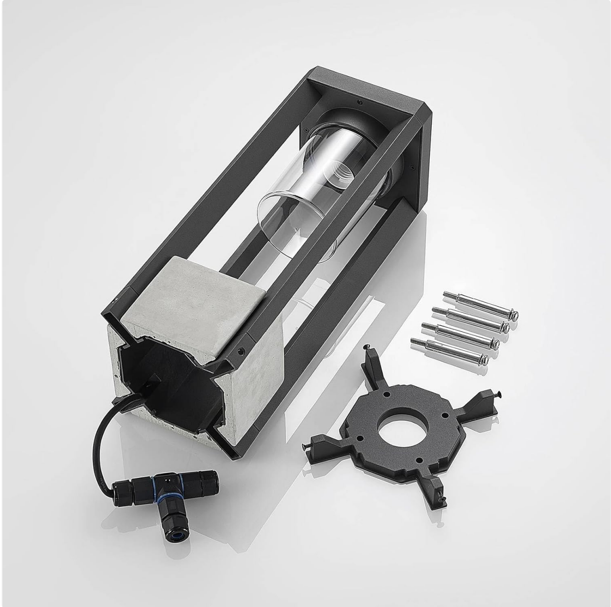
Figure 2: Overview of included components. This image shows the main lamp unit, a separate mounting base, four mounting screws, and a waterproof electrical connector.