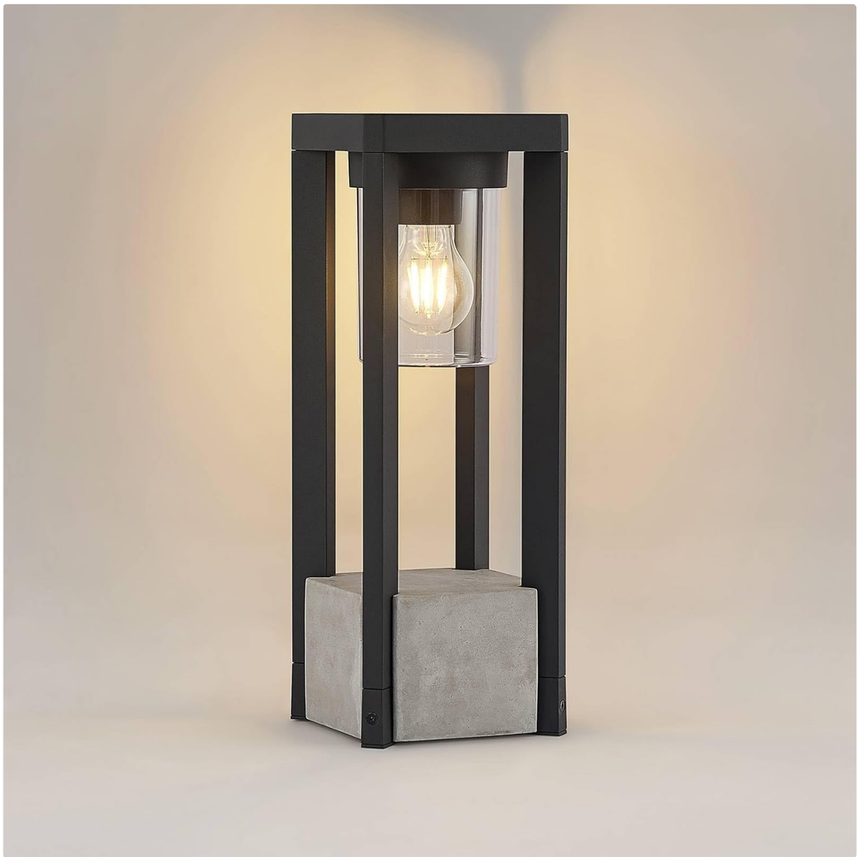
Figure 5: The Kalisa lamp in operation, demonstrating its light output.