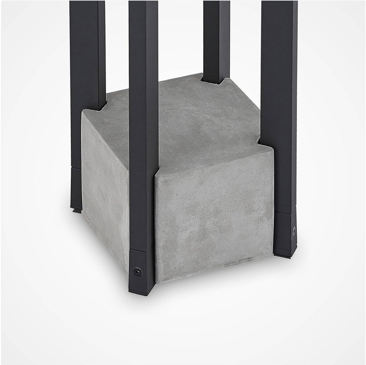
Figure 3: Detail of the lamp's base, illustrating how the aluminum frame connects to the concrete-like pedestal.