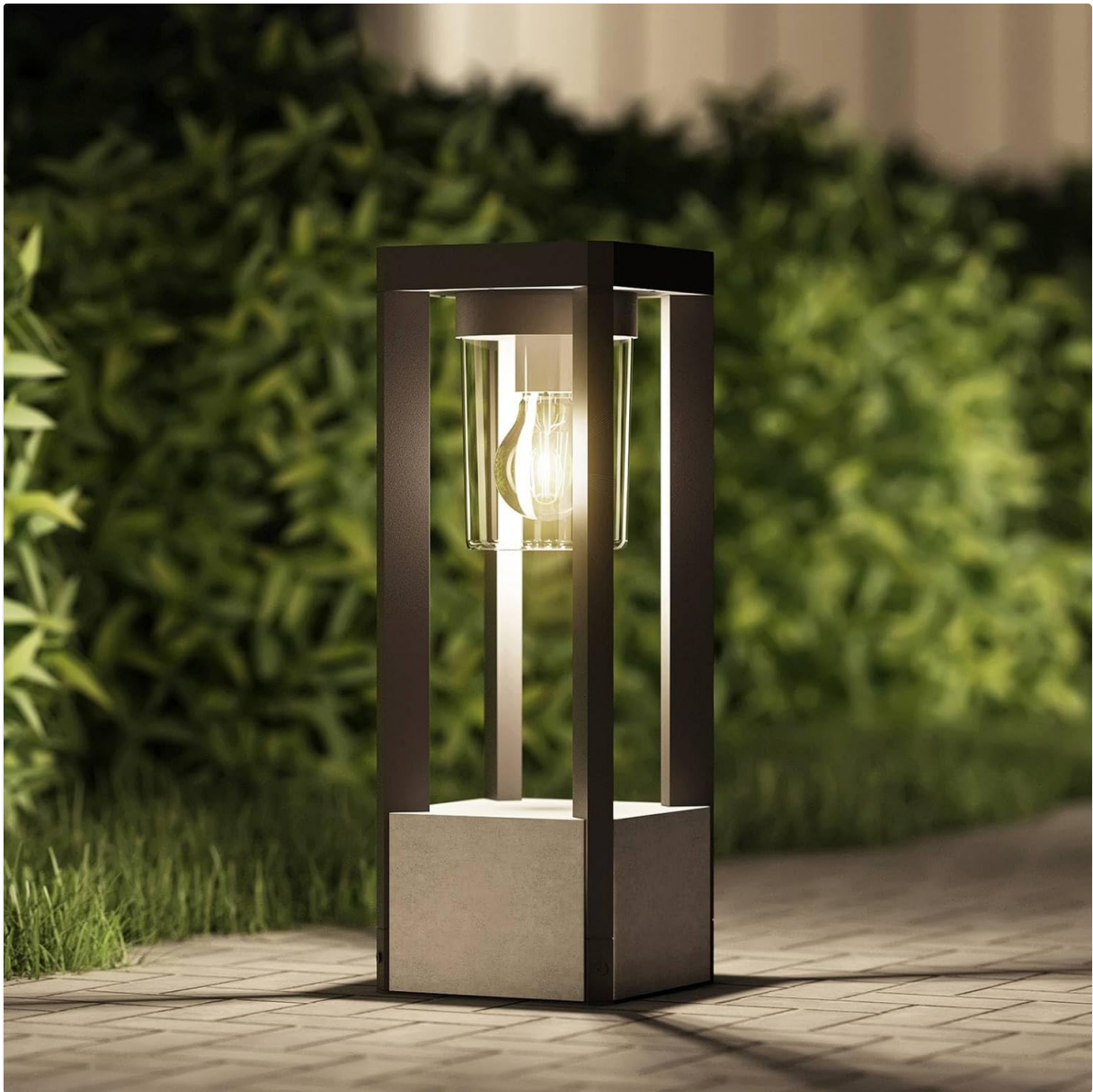
Figure 1: The Lucande Kalisa Pedestal Lamp in an outdoor setting.