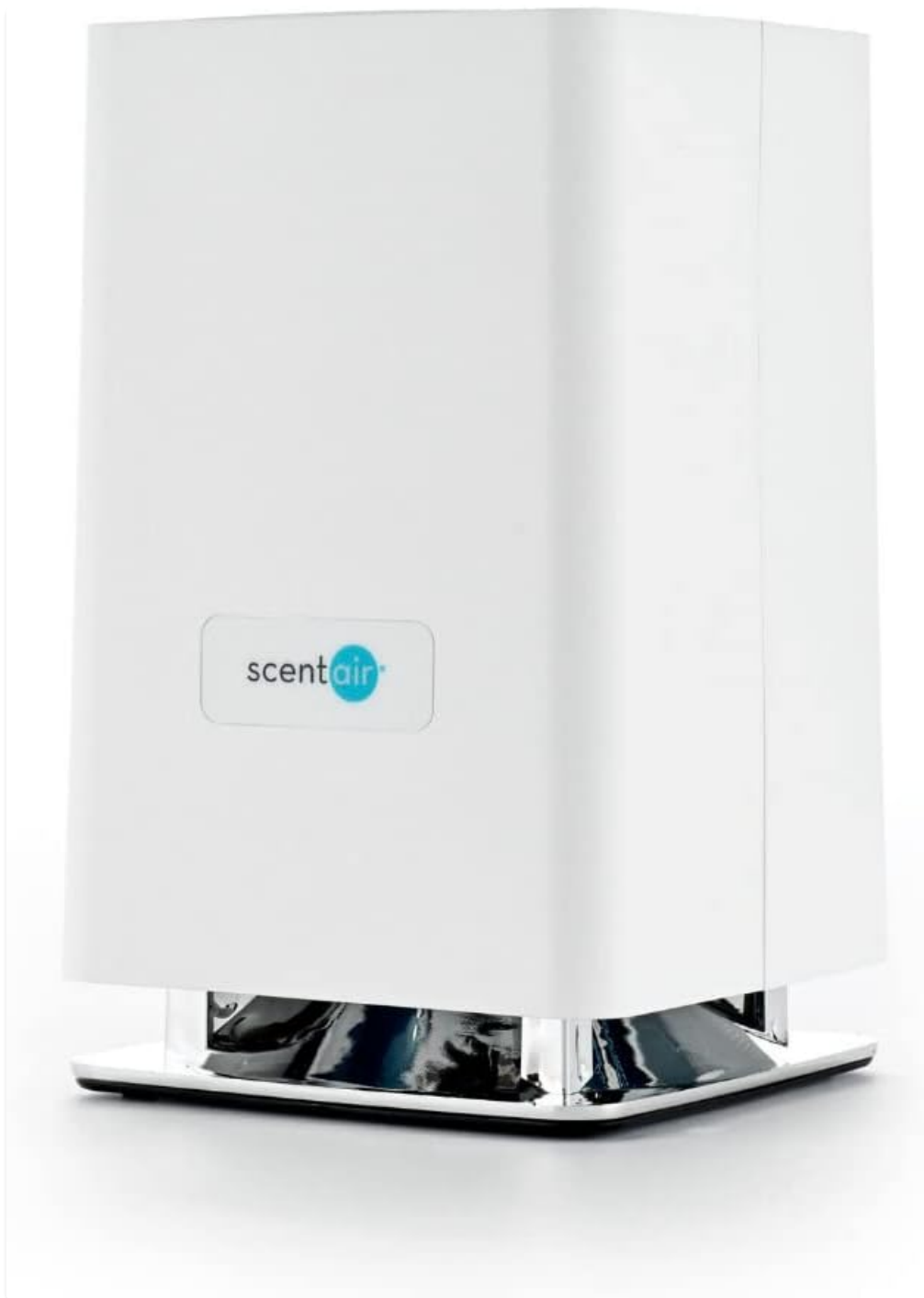
Image: The ScentAir Whisper Home Diffuser Machine, a white rectangular device with the ScentAir logo, designed for home fragrance.