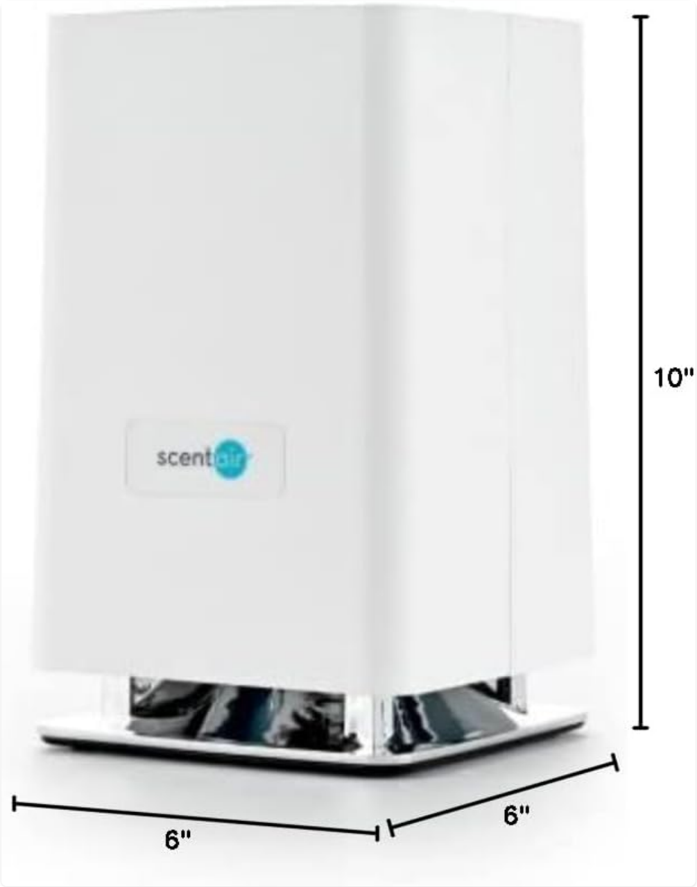
Image: A diagram illustrating the physical dimensions of the ScentAir Whisper Home Diffuser.