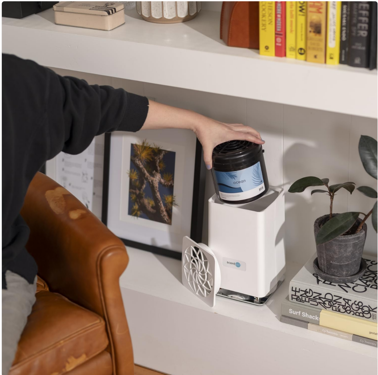
Image: A user demonstrates how to insert a fragrance cartridge into the ScentAir Whisper Home Diffuser.

Fragrance cartridges are sold separately. To insert a cartridge, remove the top cover of the diffuser, place the cartridge into the designated slot, and replace the cover.