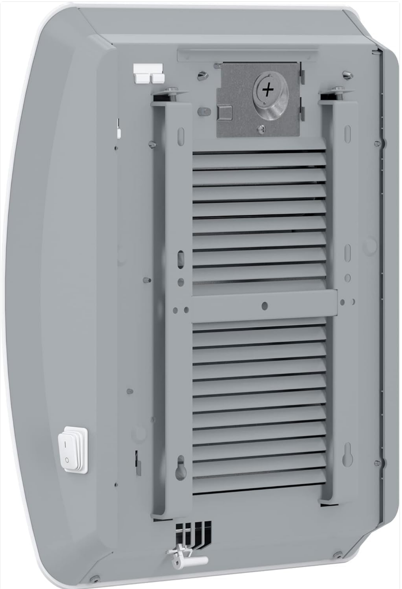
Figure 4.2.1: Rear view of the heater, illustrating the integrated wall-mounting bracket and ventilation grilles.