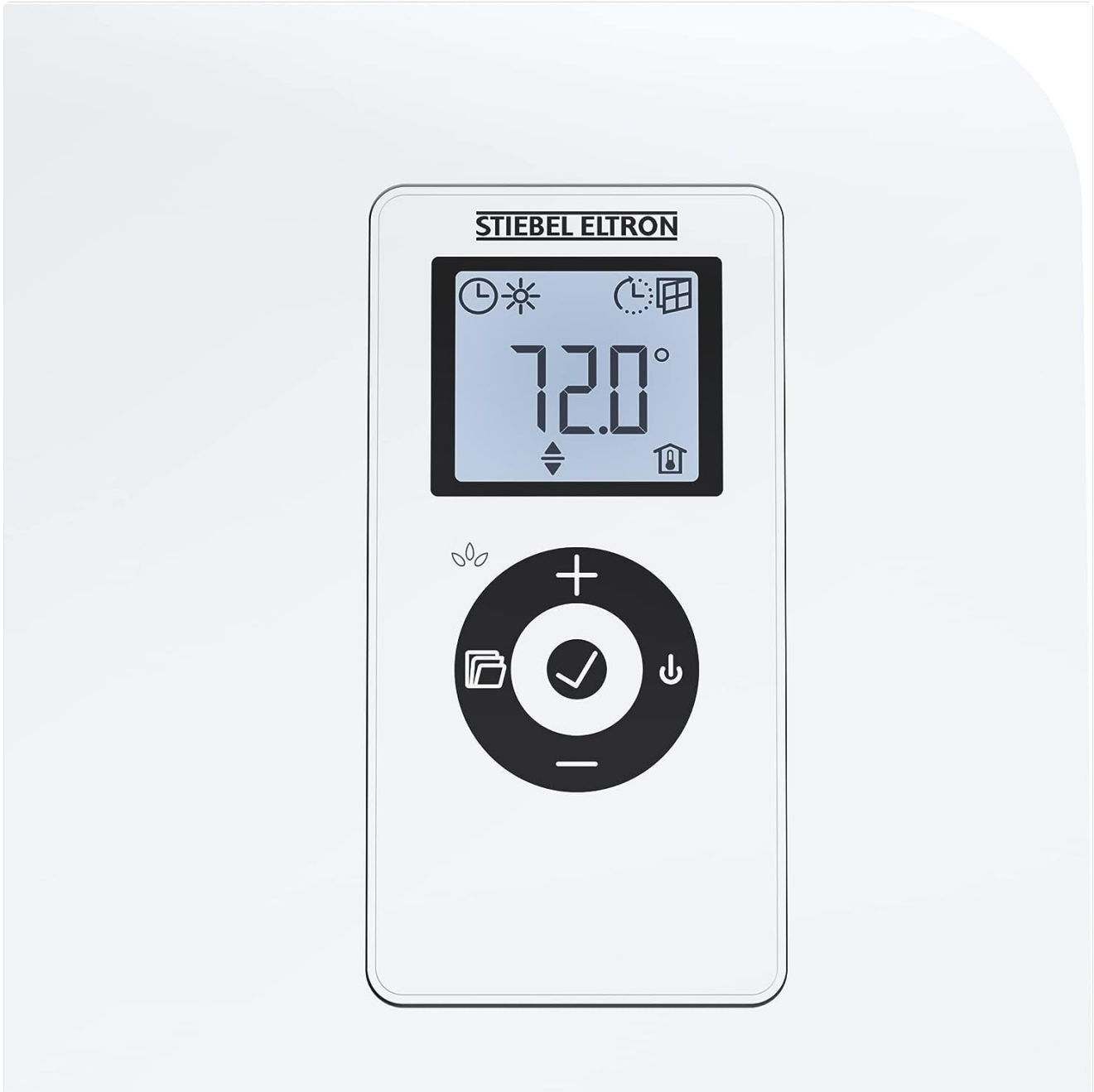
Figure 5.1.1: Digital control panel with illuminated display, showing temperature setting and control buttons.