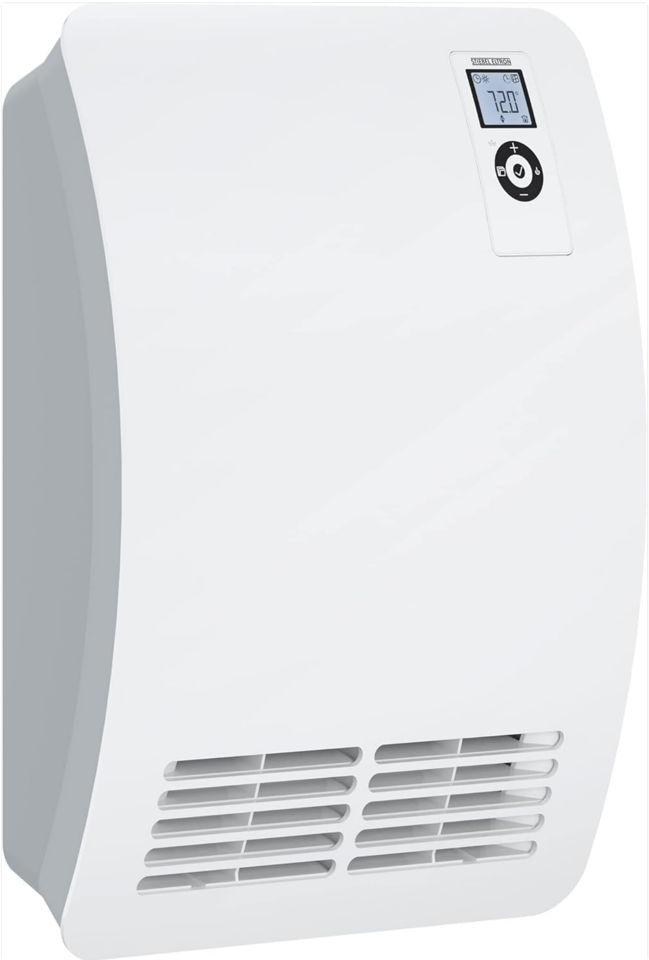
Figure 1.1: The Stiebel Eltron CK 200-2 Premium Heater.

The Stiebel Eltron CK 200-2 Premium Heater is an elegant surface-mount fan heater designed to provide quick and