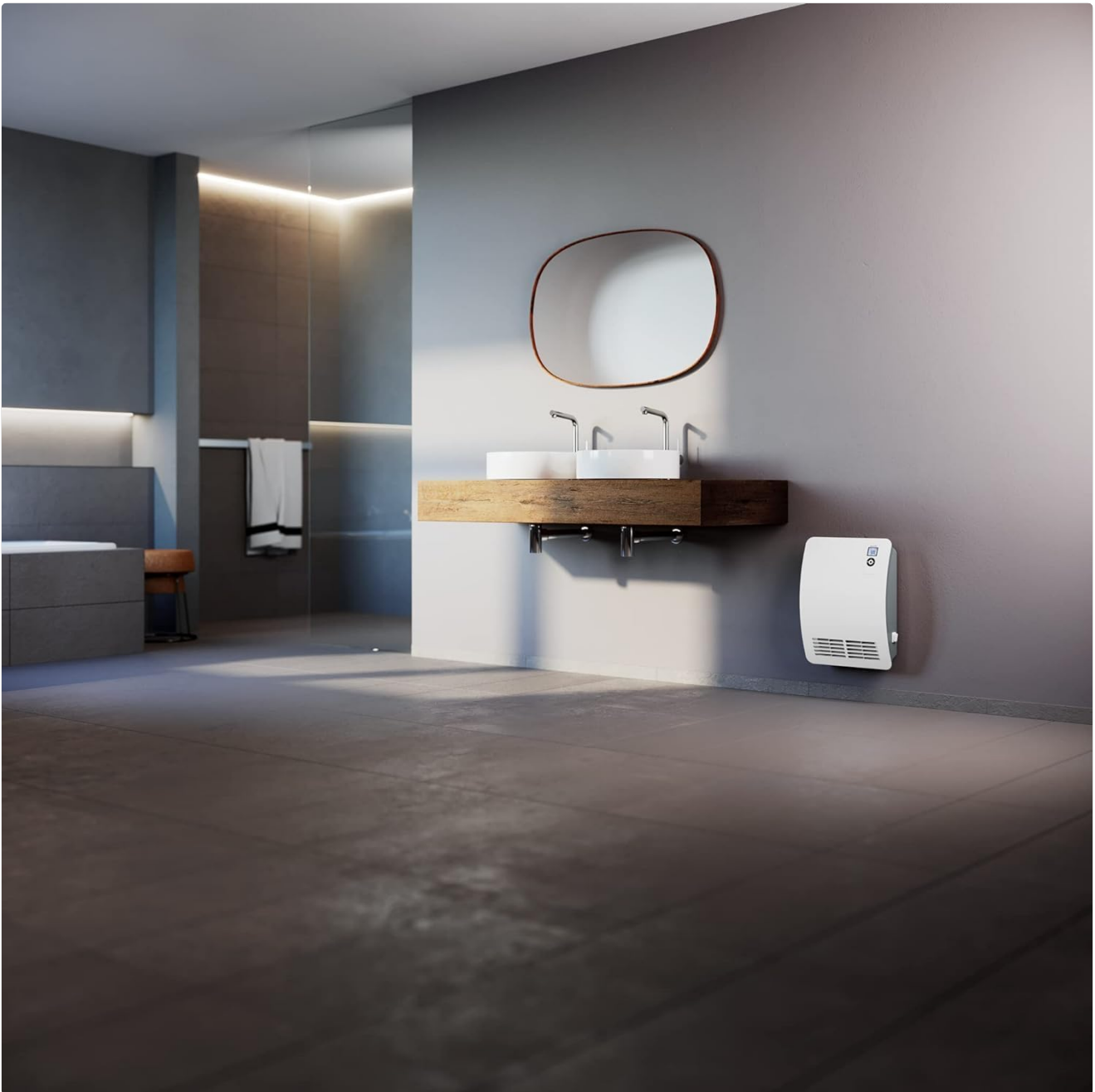
Figure 4.1.1: Example installation of the heater in a bathroom environment.