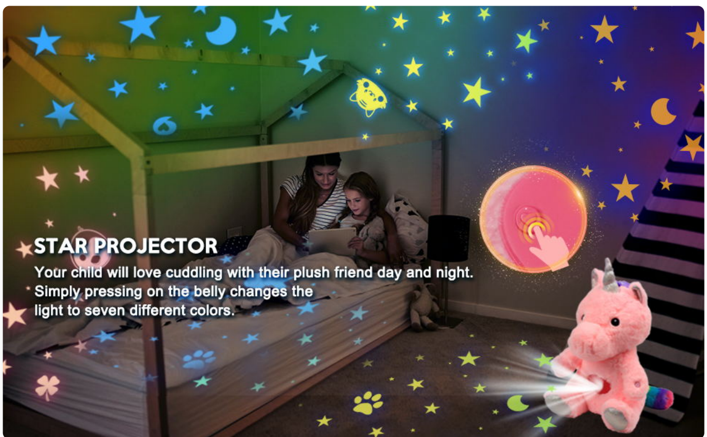
Image 5.2: Examples of the seven soothing projection colors available, including white, purple, blue, pink, green, amber, and multi-color. The projection is most effective in a dark room. The clarity of the projected images may vary with distance from the surface.

The unicorn projects stars and moon patterns onto the ceiling and walls, creating a calming atmosphere.