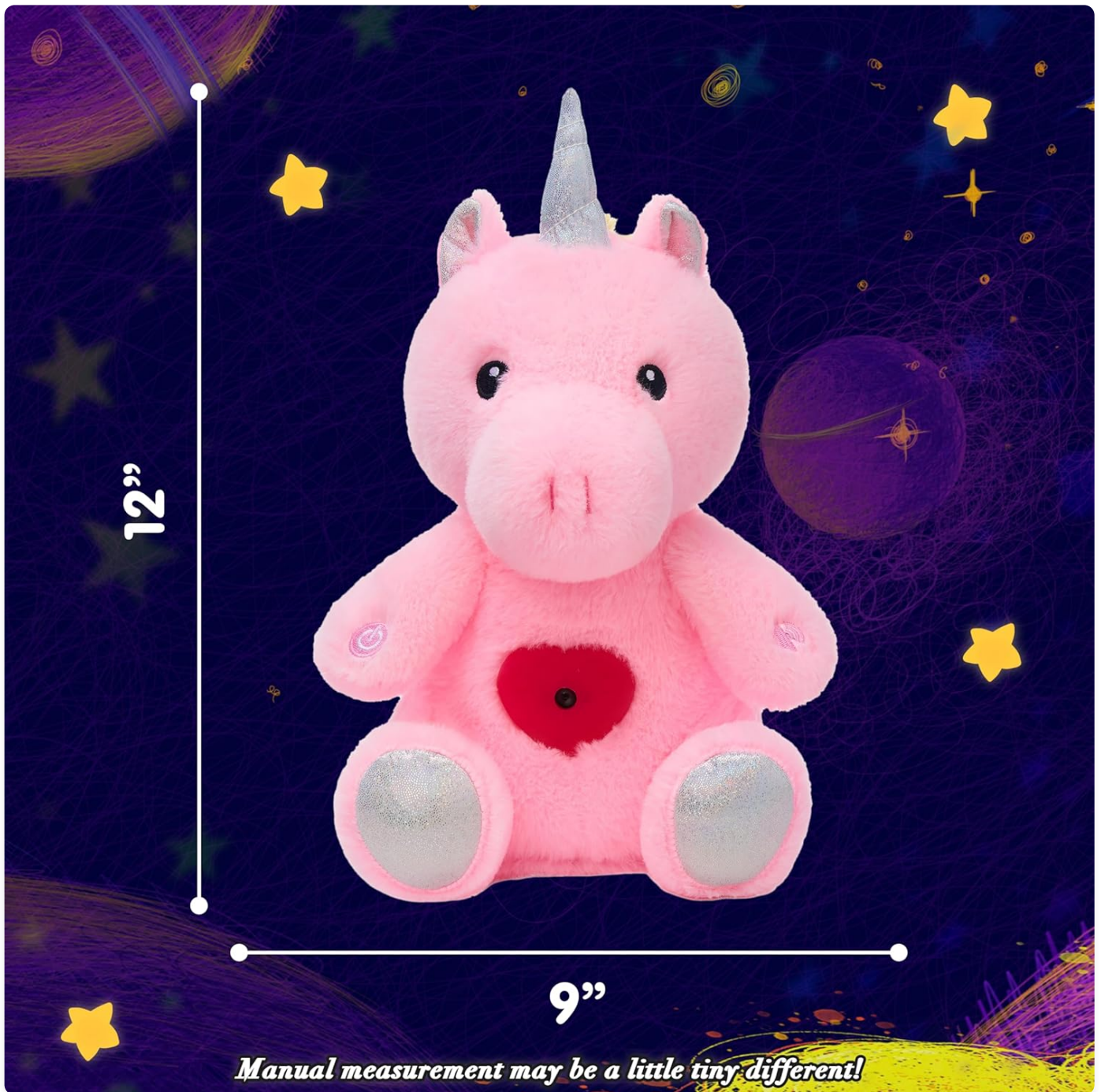
Image 8.1: Approximate dimensions of the Cuteoy Plush Pink Unicorn Star Projector, measuring 12 inches in height and 9 inches in width.