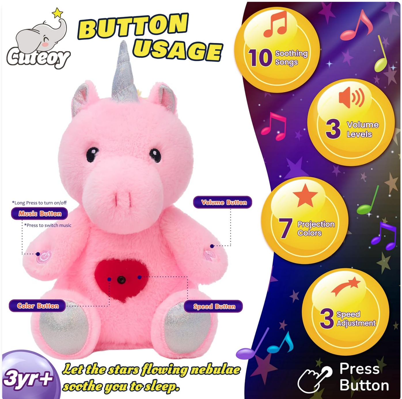
Image 5.1: Illustration of button locations and their corresponding functions on the unicorn projector.