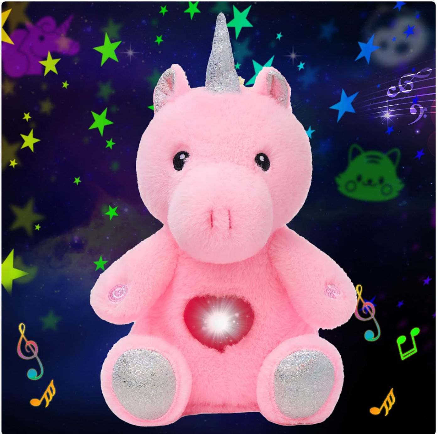
Image 1.1: The Cuteyo Plush Pink Unicorn Star Projector, showcasing its soft pink plush and glowing heart projector.