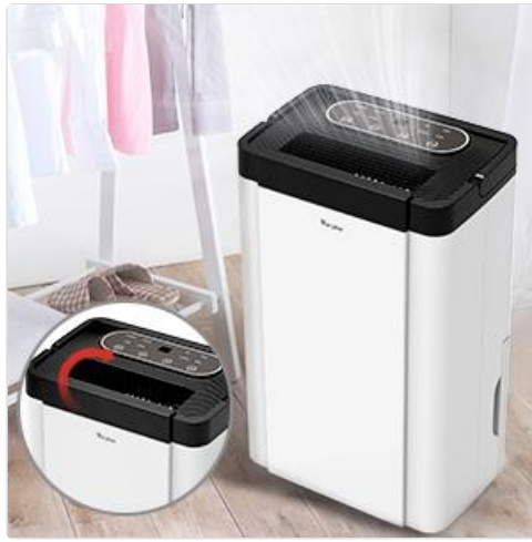
Figure 5.1: Detailed view of the control panel buttons and indicators.