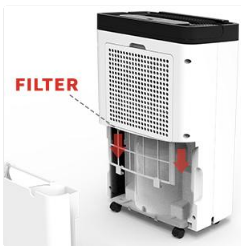
Figure 7.1: Steps for removing the air filter for cleaning.