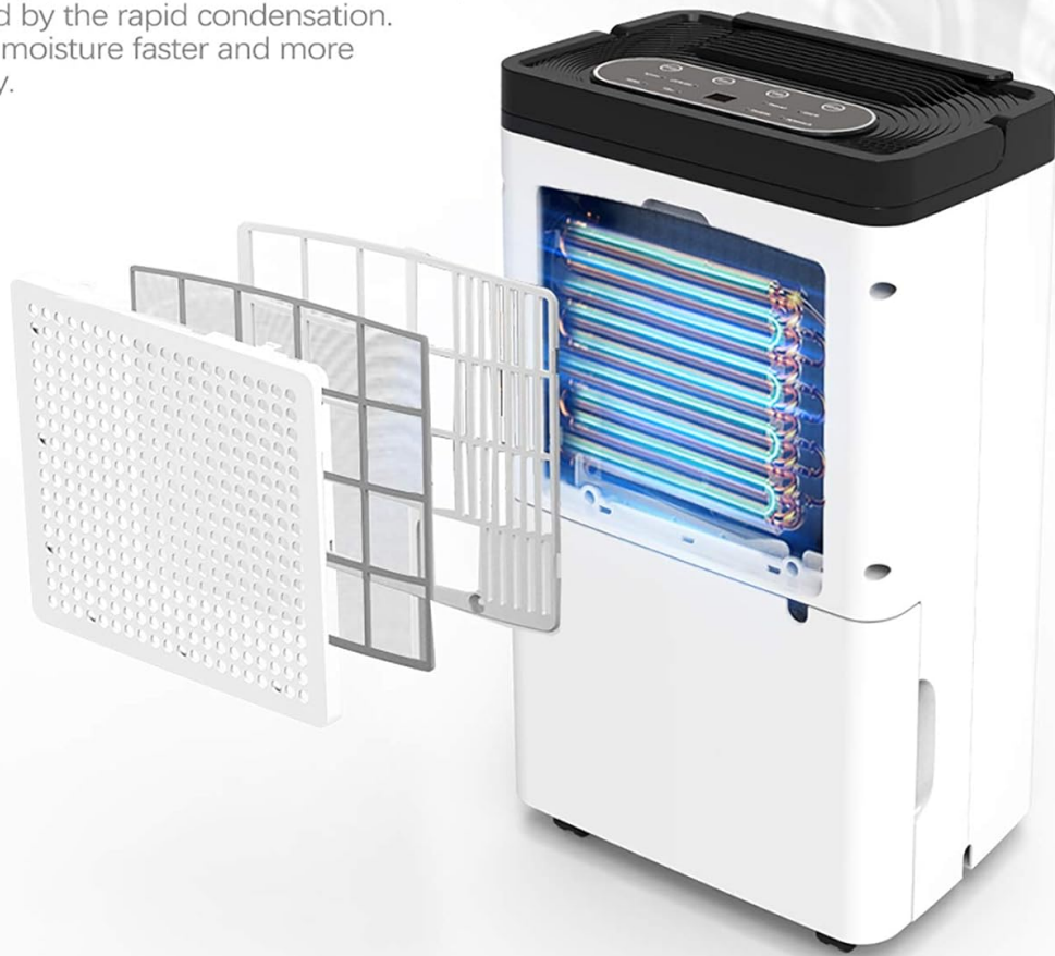
Figure 3.1: Front view of the Vacplus VA-D1909 Dehumidifier.

The efficiency of dehumidification is greatly improved by the rapid condensation. Remove moisture faster and more efficiently.