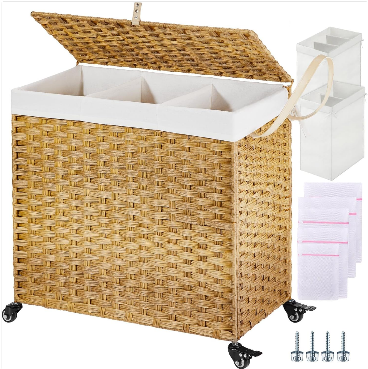
Image: The Greenstell 130L Laundry Hamper, showcasing its handwoven design, lid, and wheels.