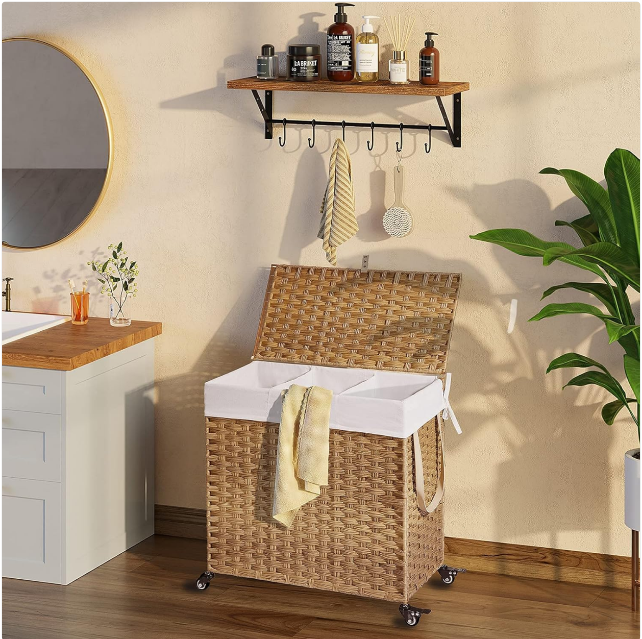
Image: The laundry hamper positioned in a bathroom, demonstrating its aesthetic integration into a home environment.