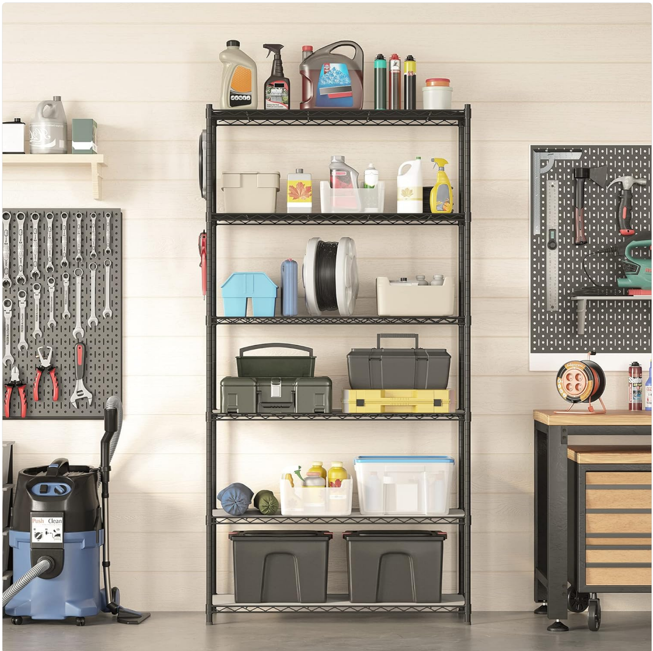
Figure 8: Key dimensions and load capacities of the shelving unit.