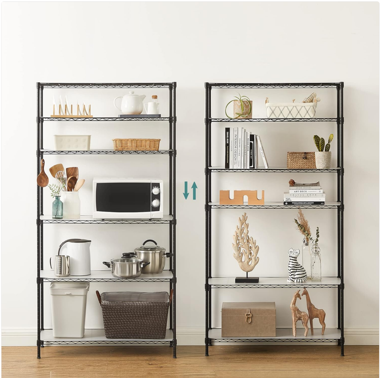
Figure 5: Demonstrating the adjustable nature of the shelves.