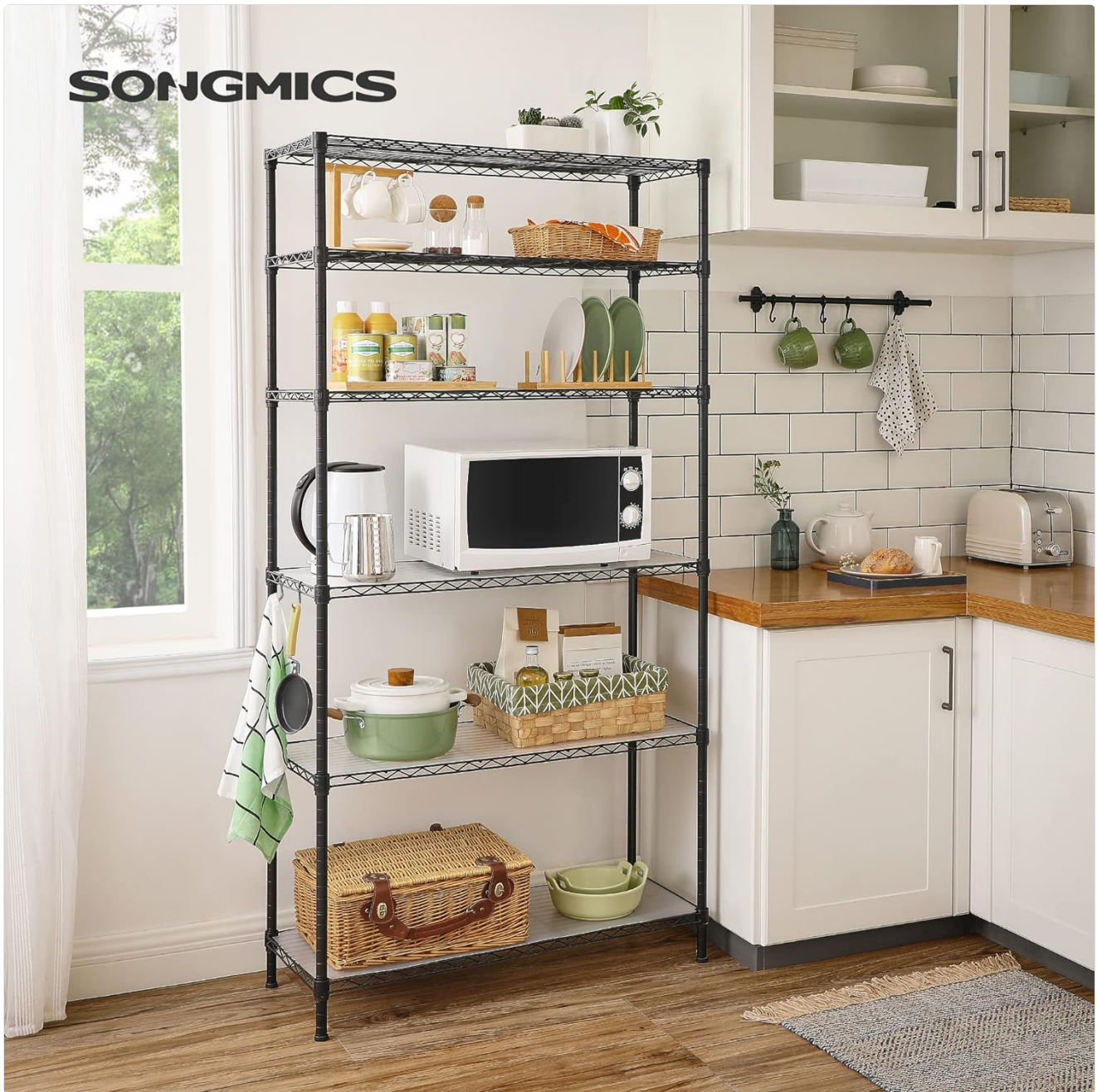
Figure 7: Shelving unit in a kitchen, demonstrating the use of S-hooks for hanging items.