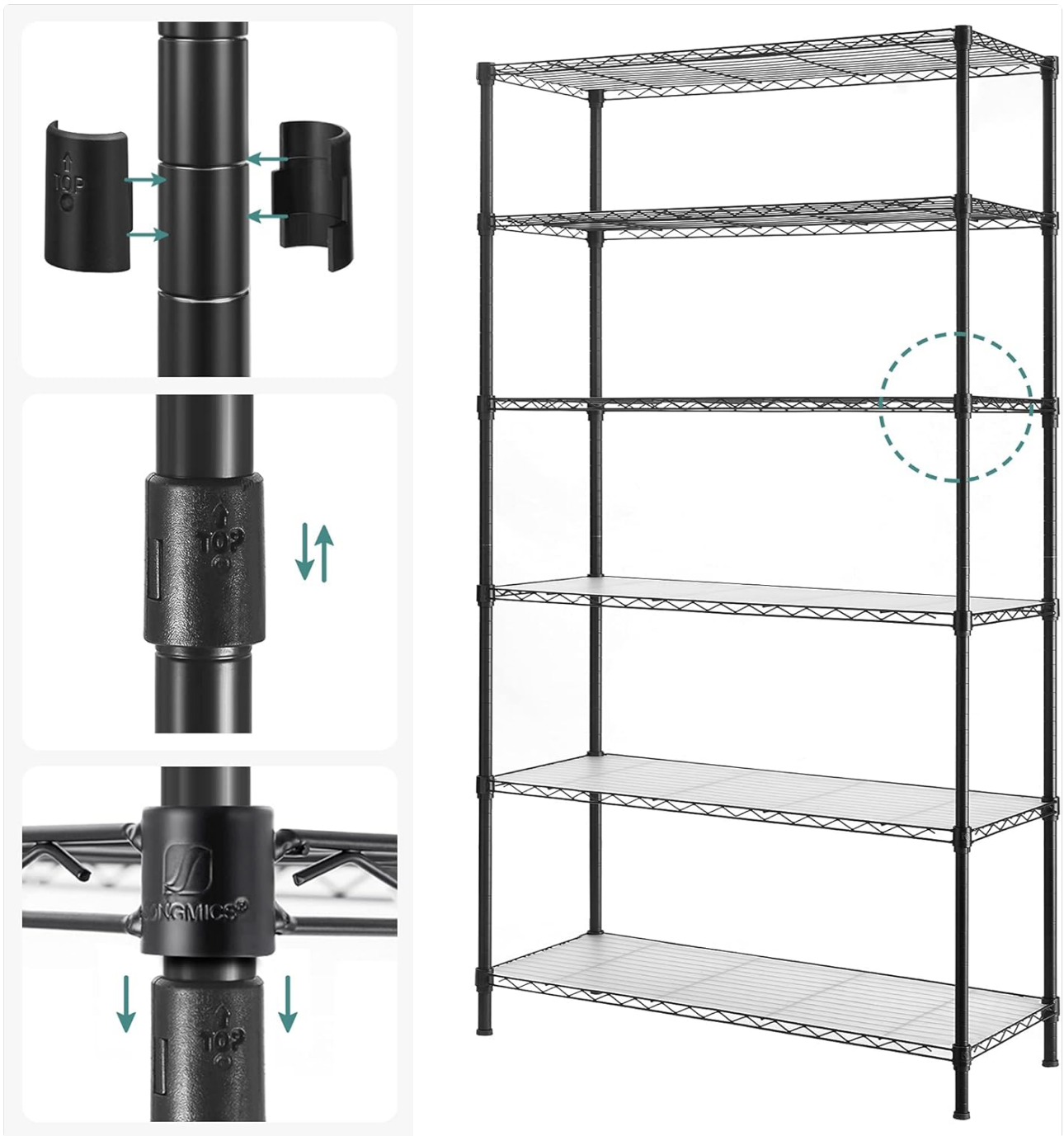
Figure 3: Overview of the shelving unit assembly process.