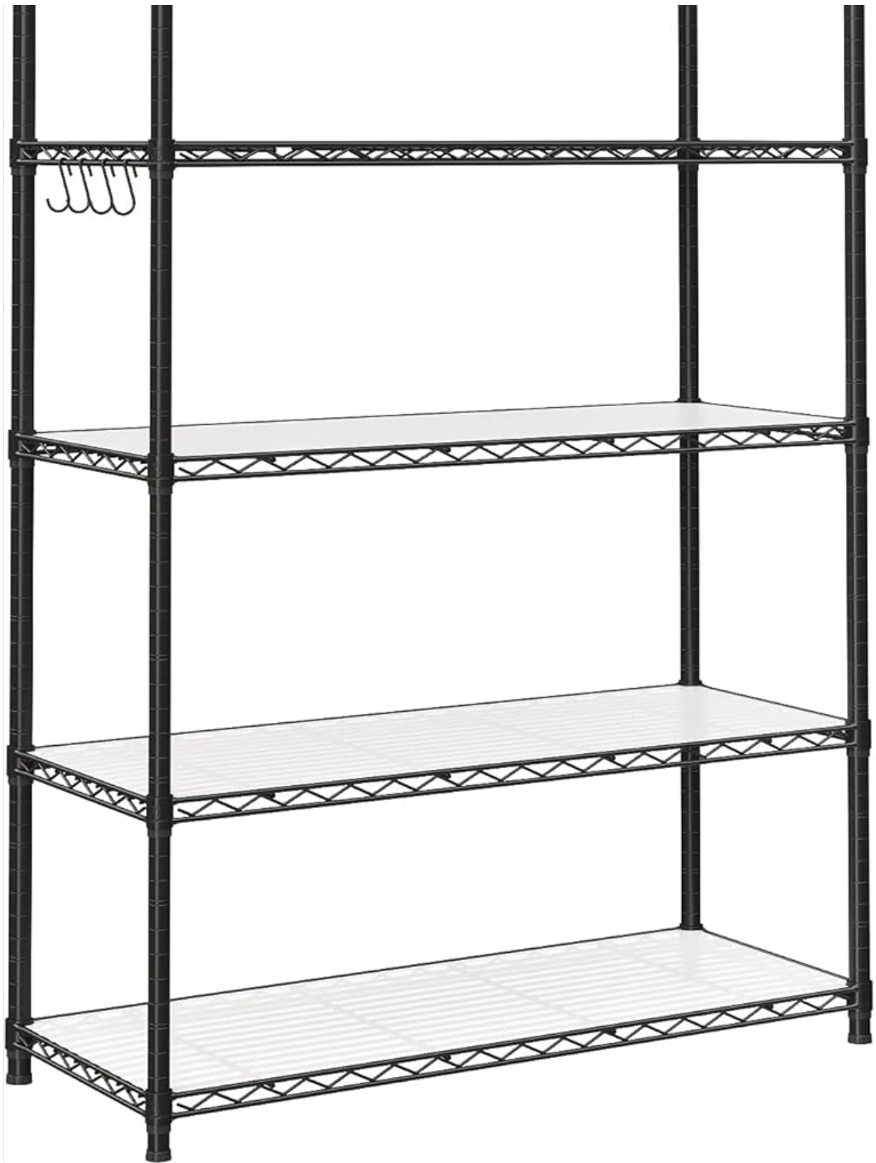
Figure 1: Fully assembled SONGMICS 6-Tier Storage Shelves.