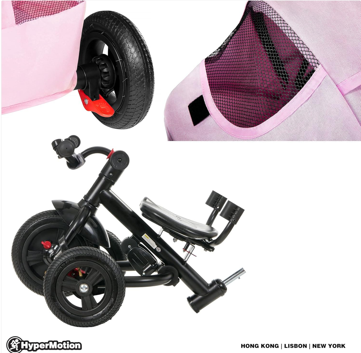
Image: The HyperMotion Tobi Velar Tricycle in its full configuration with parental handle and canopy.