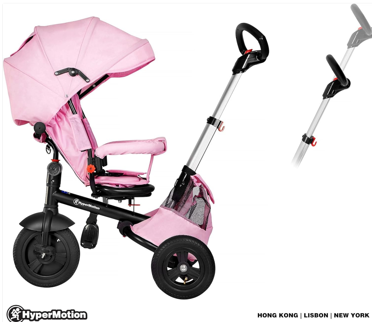
Image: Visual guide showing the various configurations and evolution stages of the tricycle.

Your browser does not support the video tag.