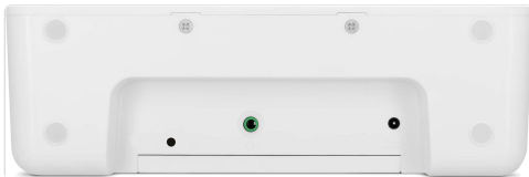
Figure 2: Rear View. This image displays the back of the radio, showing the power input and other connection ports, including a headphone jack.

The front panel features two rotary knobs (Volume and Scroll/Select) and several buttons: Standby, Mode, Sleep/Dimmer, Scan, Menu, Info, and Preset. The 2.8-inch color display provides visual feedback. The rear panel includes the power input and a headphone jack.