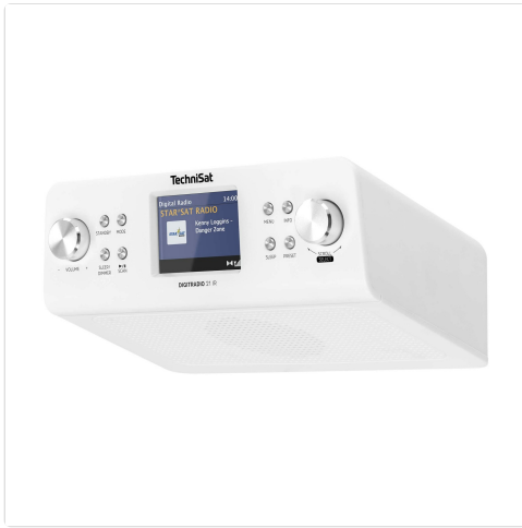
Figure 1: Front View. This image shows the front of the TechniSat DIGITRADIO 21 IR, highlighting the control knobs for volume and scroll/select, along with buttons for standby, mode, sleep/dimmer, scan, menu, info, and preset. The central 2.8-inch color display is also visible.