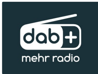
Figure 5: DAB+ Digital Radio. Enjoy high-quality digital radio broadcasts.

Press the MODE button to cycle through available radio sources.