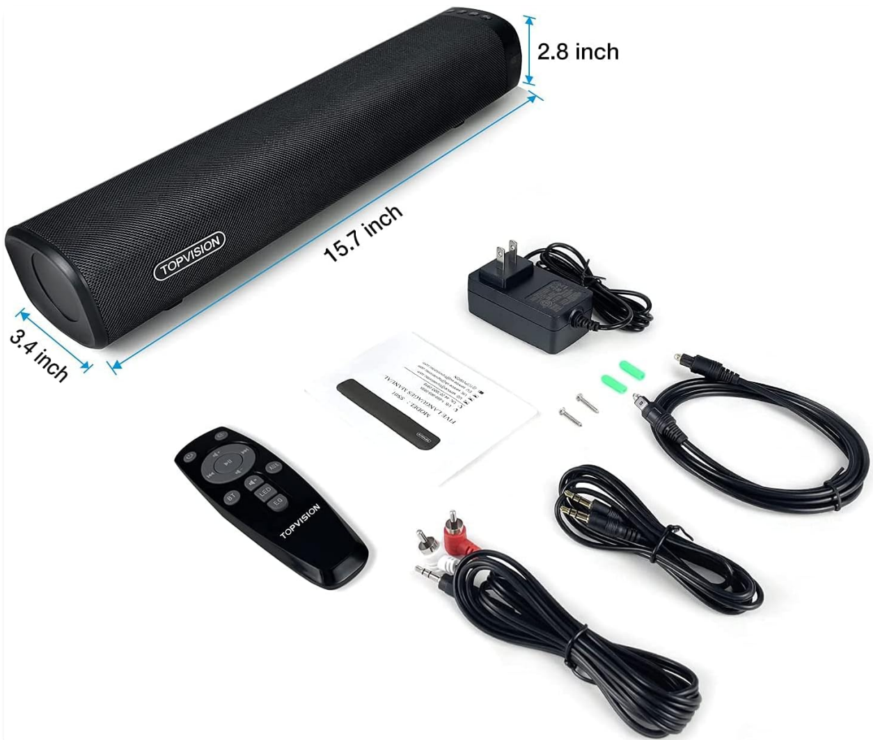
Image: Contents of the TOPVISION 50W Sound Bar package, showing the sound bar, remote control, power adapter, optical cable, 3.5mm AUX cable, RCA to 3.5mm audio cable, and wall mount accessories.