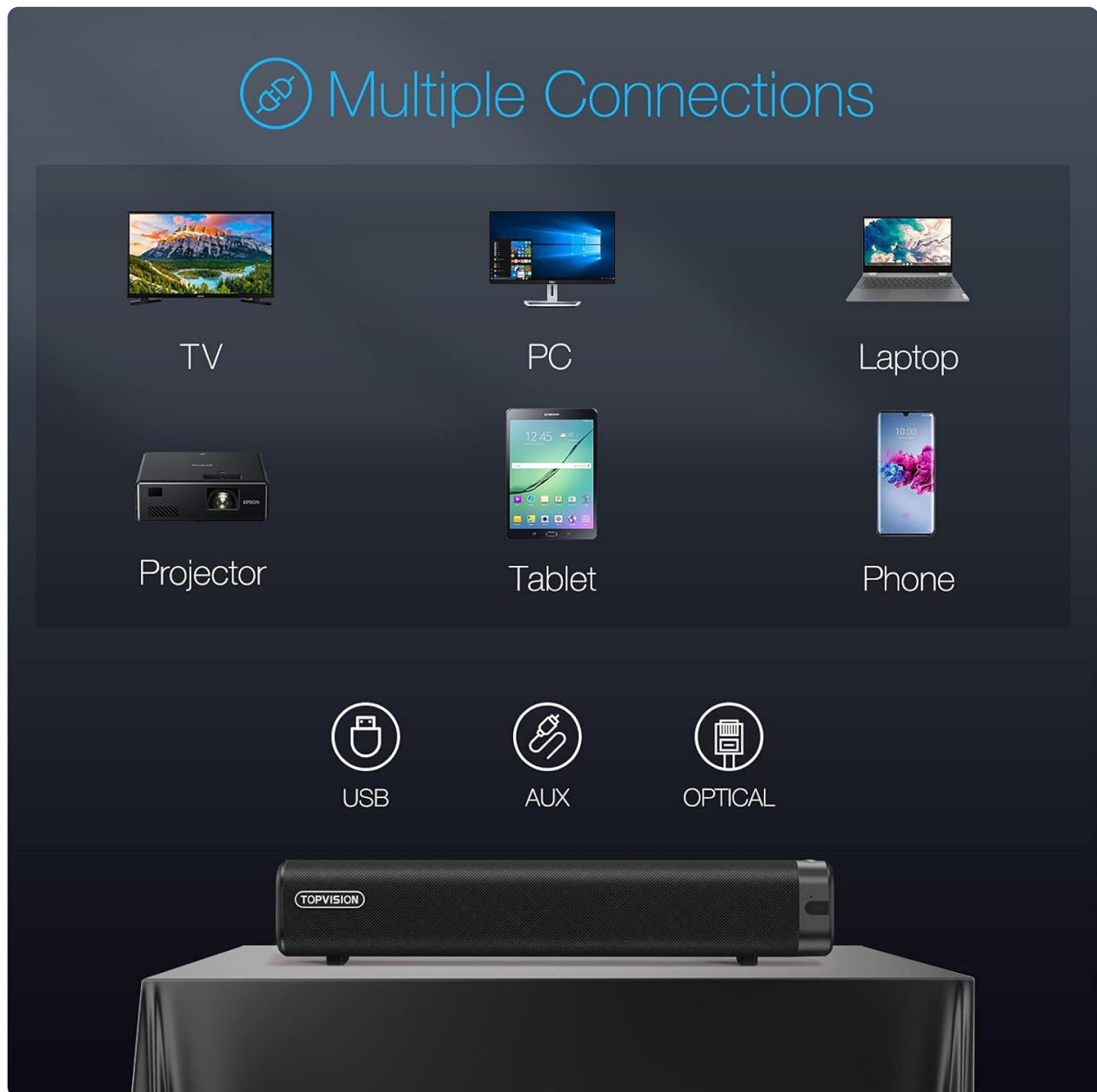
Image: A visual representation of the various connection types supported by the sound bar, including USB, AUX, and Optical inputs, along with compatible devices such as TV, PC, Laptop, Projector, Tablet, and Phone.

The sound bar supports multiple audio input options: