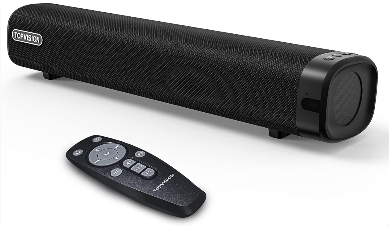
Image: The TOPVISION Sound Bar shown from the front, alongside its remote control. The sound bar features a black mesh grille and control buttons on the right side.