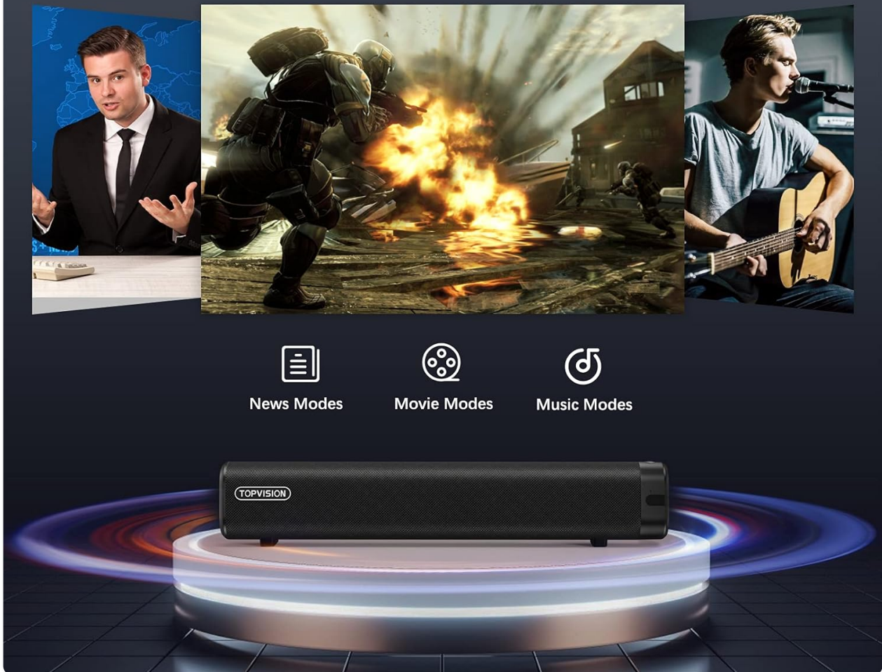
Image: A graphic illustrating the sound bar's built-in DSP technology and its three distinct equalizer modes: News, Movie, and Music, each tailored for different audio experiences.

Ensured 3 sound modes output is more stable and accurate