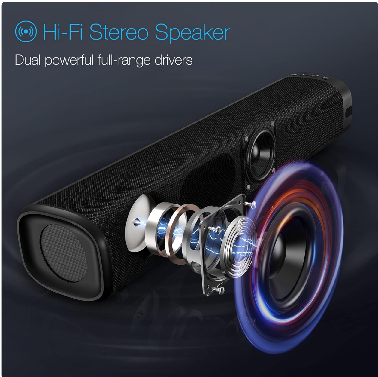
Image: An exploded view diagram of the sound bar highlighting its internal Hi-Fi Stereo Speaker components, specifically the dual powerful full-range drivers responsible for audio output.