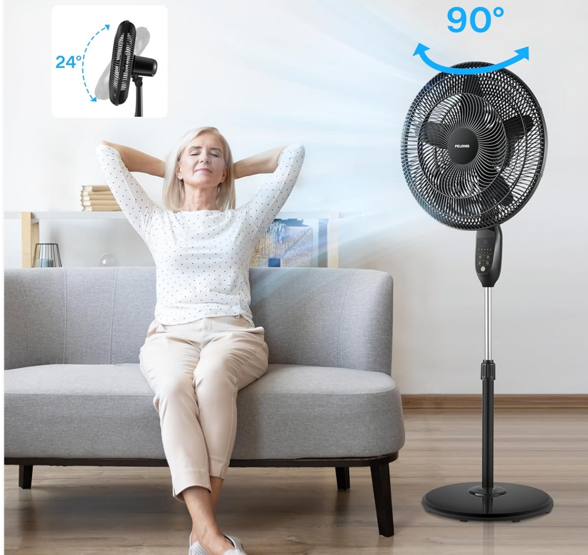
Figure 7: Wide Oscillation and Tilt

The fan offers a 90° oscillation angle and a 24° tilt angle to ensure comprehensive air circulation throughout the room.