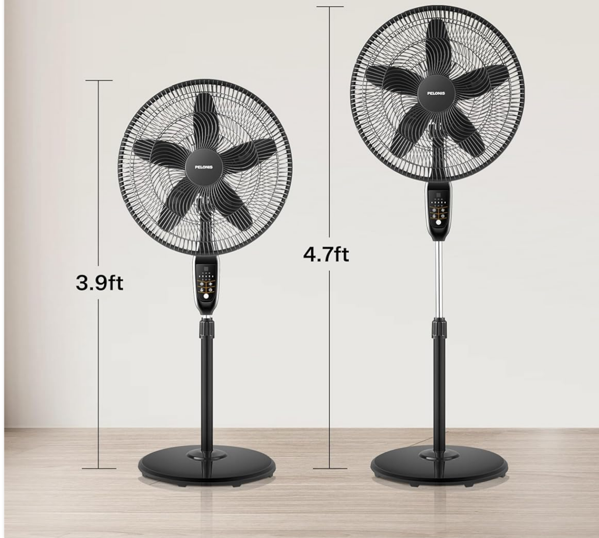
Figure 3: Adjustable Height Feature

Easily adjust the height of the fan from 3.9ft to 4.7ft