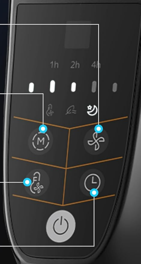
Figure 2: LED Display and Control Panel

A close-up of the fan's control panel, featuring an easy-to-read LED display for 5 speed settings, 4 modes (Eco, Normal, Nature, Sleep), and a 7-hour timer.