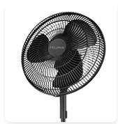
Figure 8: Easy to Clean

This icon highlights the fan's design for easy cleaning, ensuring simple maintenance for prolonged use.