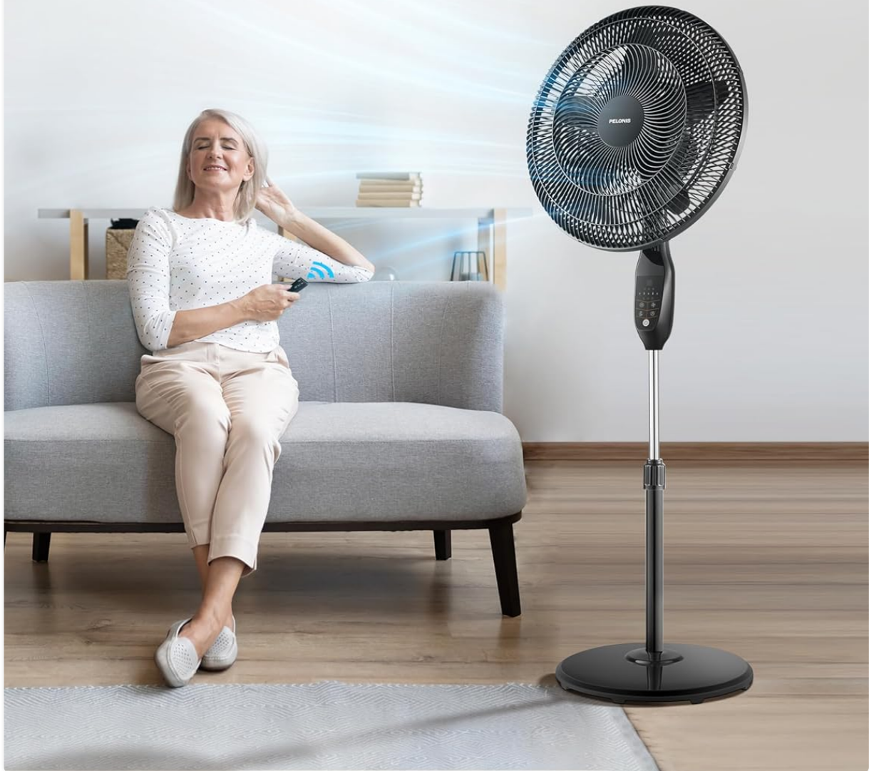
Figure 5: Remote Control Operation

Adjust power, speed, and timer with included remote control