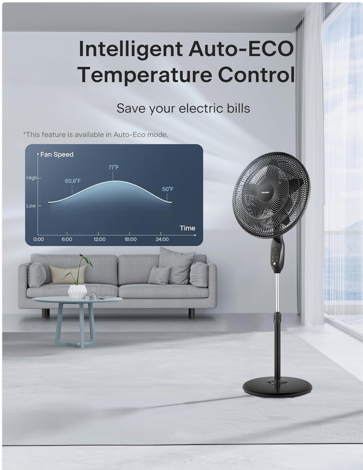
Figure 6: Intelligent Auto-ECO Temperature Control

This diagram illustrates how the fan's speed automatically adjusts based on the room temperature in ECO mode, helping to save energy.