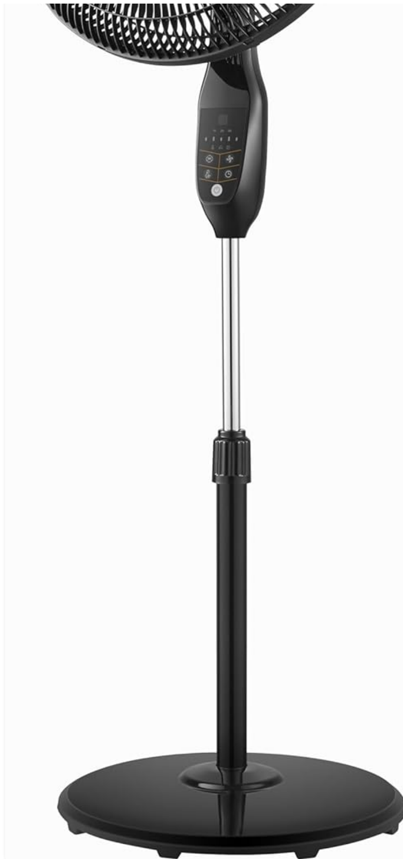
Figure 1: PELONIS PFS45A5BBB Pedestal Fan - Front View

This image shows the complete assembly of the PELONIS 18-inch 5-Blade Oscillating Pedestal Fan in black, highlighting its sleek design and adjustable height.