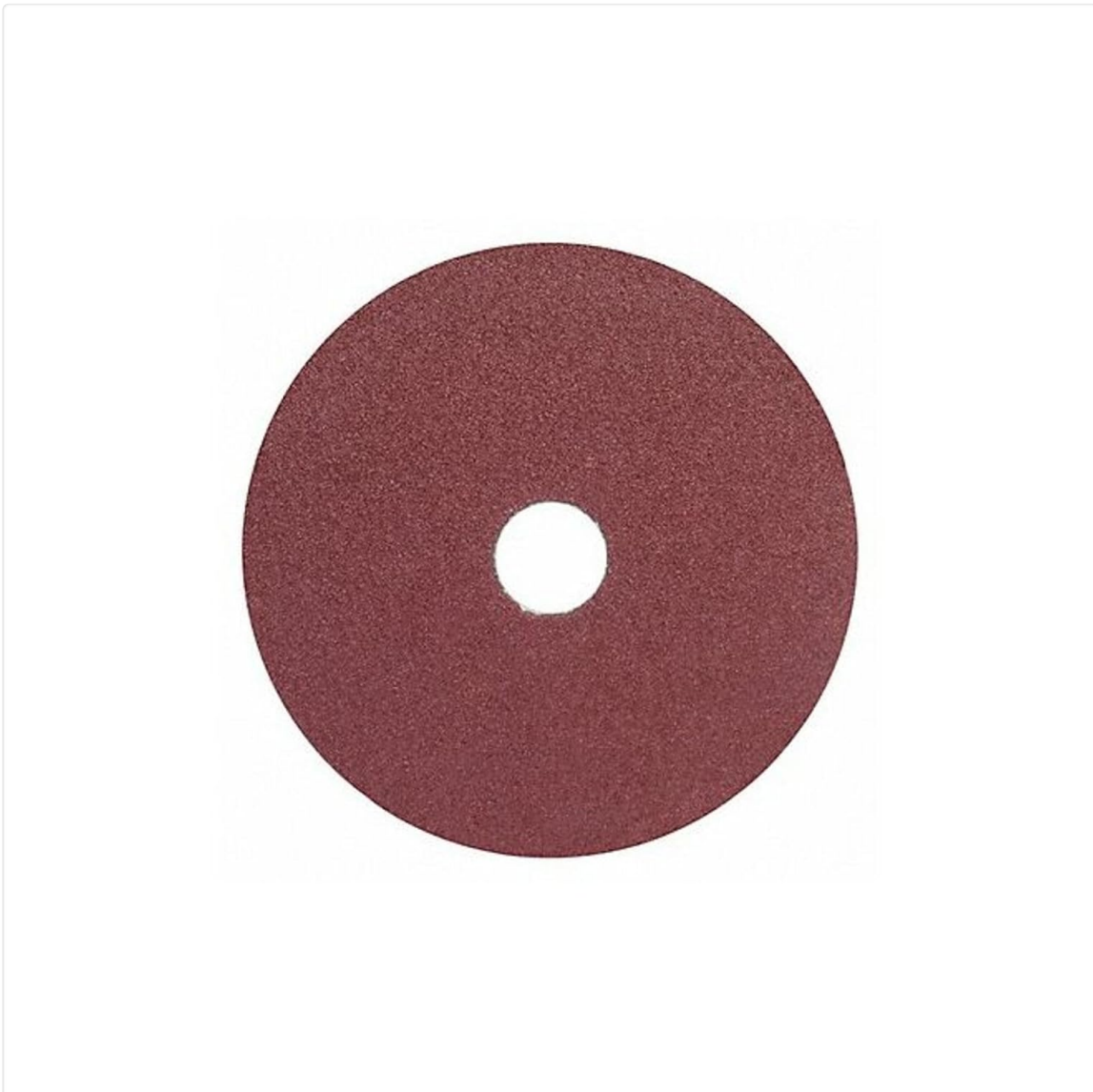
Image 1: ZORO SELECT 7-inch Fiber Disc. This image shows the brown, circular fiber disc with a central 7/8-inch arbor hole, ready for mounting on a compatible backing pad.