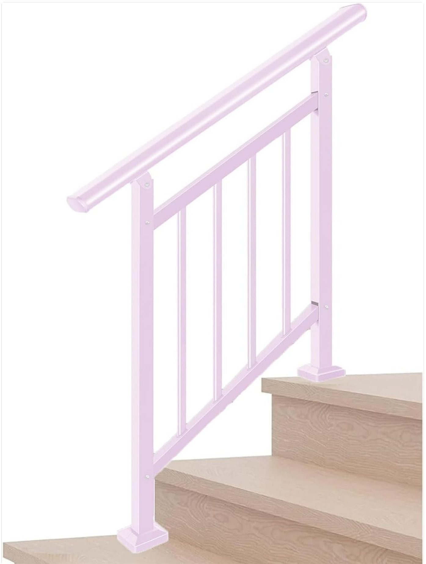
Image: Metty Metal 4-step handrail with balusters installed on outdoor steps.