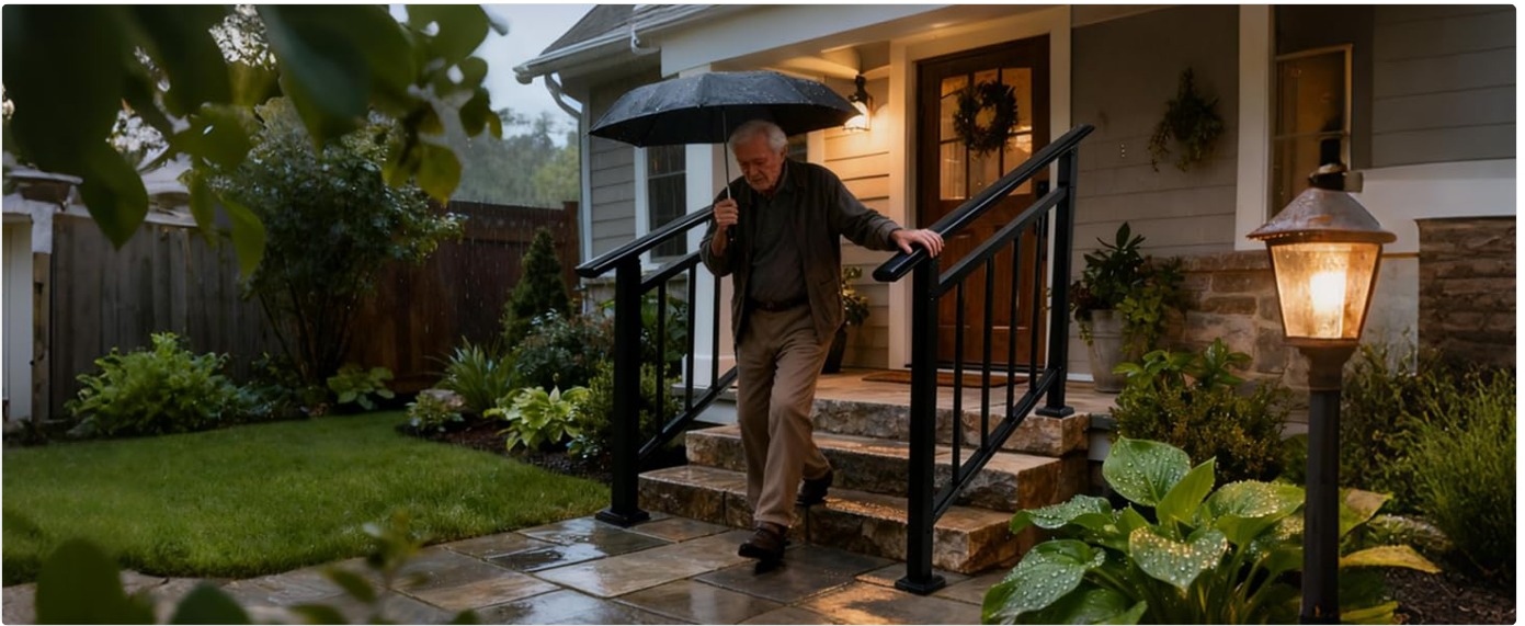
Image: An elderly person using the handrail for support on outdoor steps.