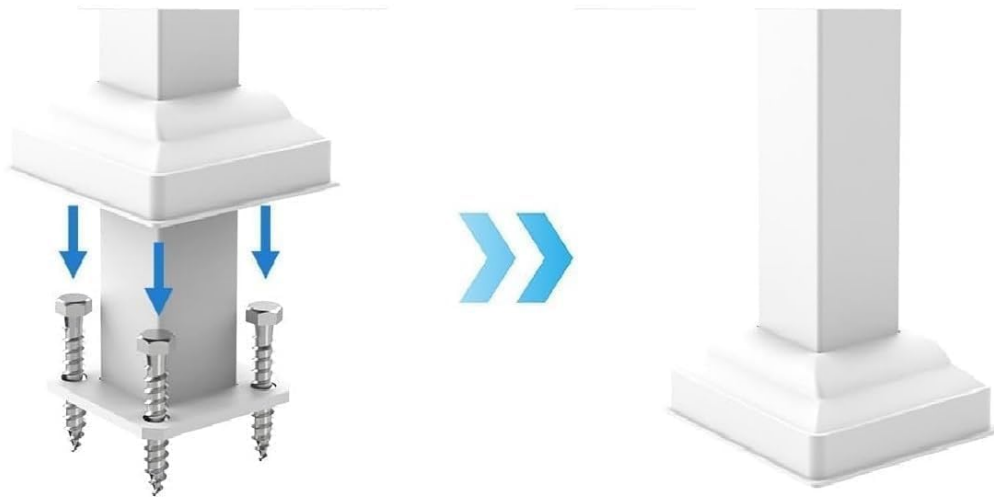
Image: Included installation kit with various screws, drill bits, and tools.