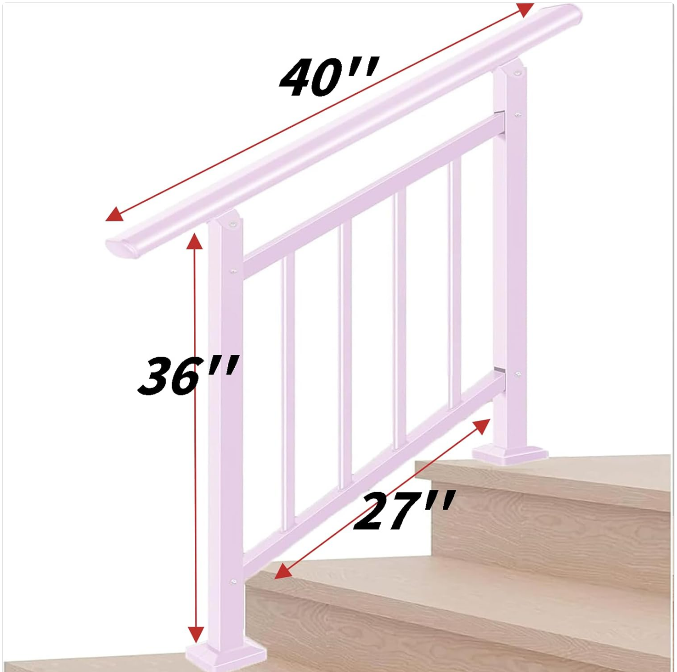
Image: Key dimensions of the 4-step handrail.