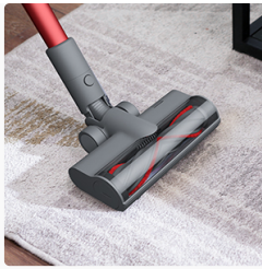
Images: Various cleaning attachments including the crevice nozzle, 2-in-1 brush, and mini electric brush.