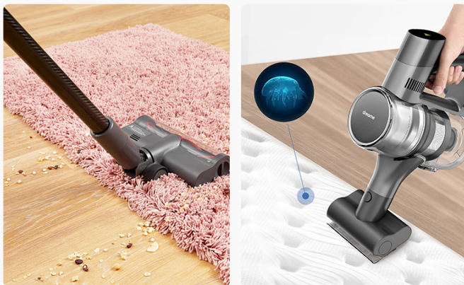
Images: The DREAME T20 vacuum cleaner effectively cleaning both hard floors and carpets.

The Smart Multi-brush Bar automatically adjusts suction level between floor/tile and carpet. For optimal cleaning, select the appropriate suction level and attachment for the surface.