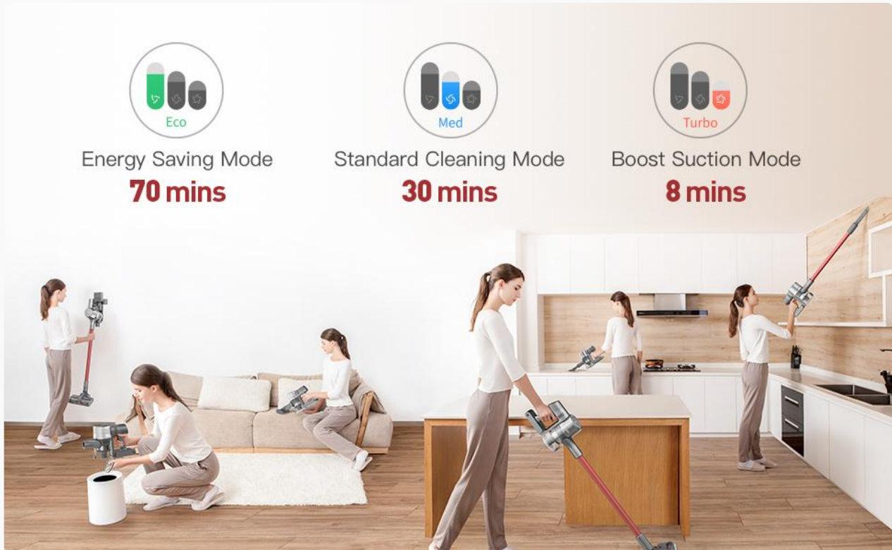
Image: The DREAME T20 vacuum cleaner illustrating its three cleaning modes: Eco, Standard (Auto), and Boost (Turbo) with corresponding battery runtimes.

Press the 'Switch Suction Level' button briefly to cycle between the three suction modes: Eco (for extended runtime), Auto (for balanced performance), and Turbo (for maximum suction).