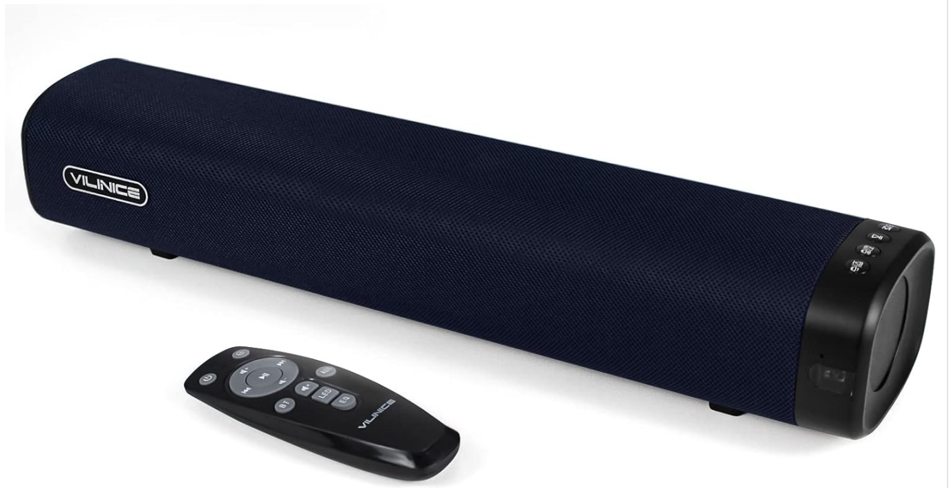
Figure 1: Front view of the VILINICE Sound Bar with included remote control.