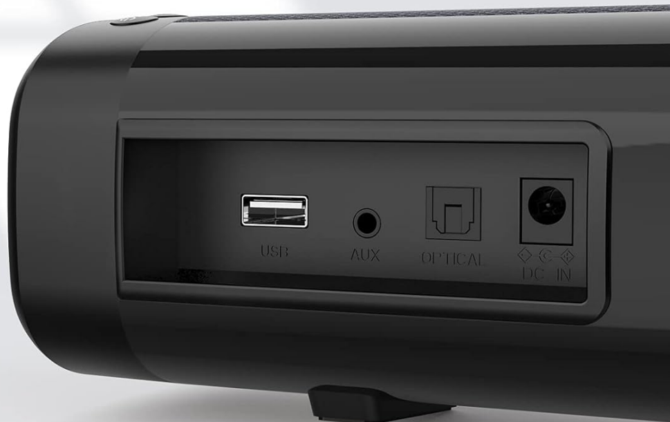
Figure 2: Rear view displaying USB, AUX, Optical, and DC IN ports.

The VILINICE Sound Bar measures approximately 16 inches in width, 3 inches in depth, and 2.8 inches in height, making it compact for various setups. It features a sleek design with a durable PVC material and a fabric mesh grille. Controls for power, mode selection, volume, and track navigation are conveniently located on the side of the unit. The rear panel houses all connectivity options, including USB, AUX, Optical, and the DC power input. It also includes integrated mounting points for wall installation.