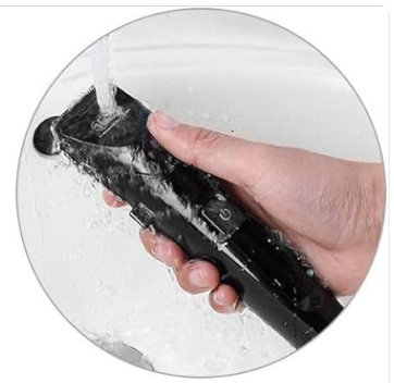
Whole Body Washable