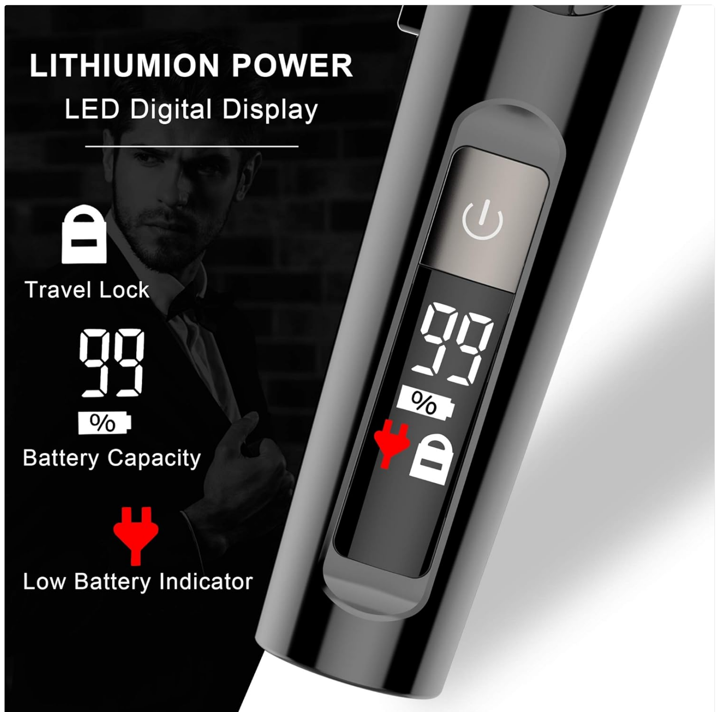
Image: A close-up of the clipper's LED display, illustrating the battery percentage, travel lock icon, and low battery warning symbol.