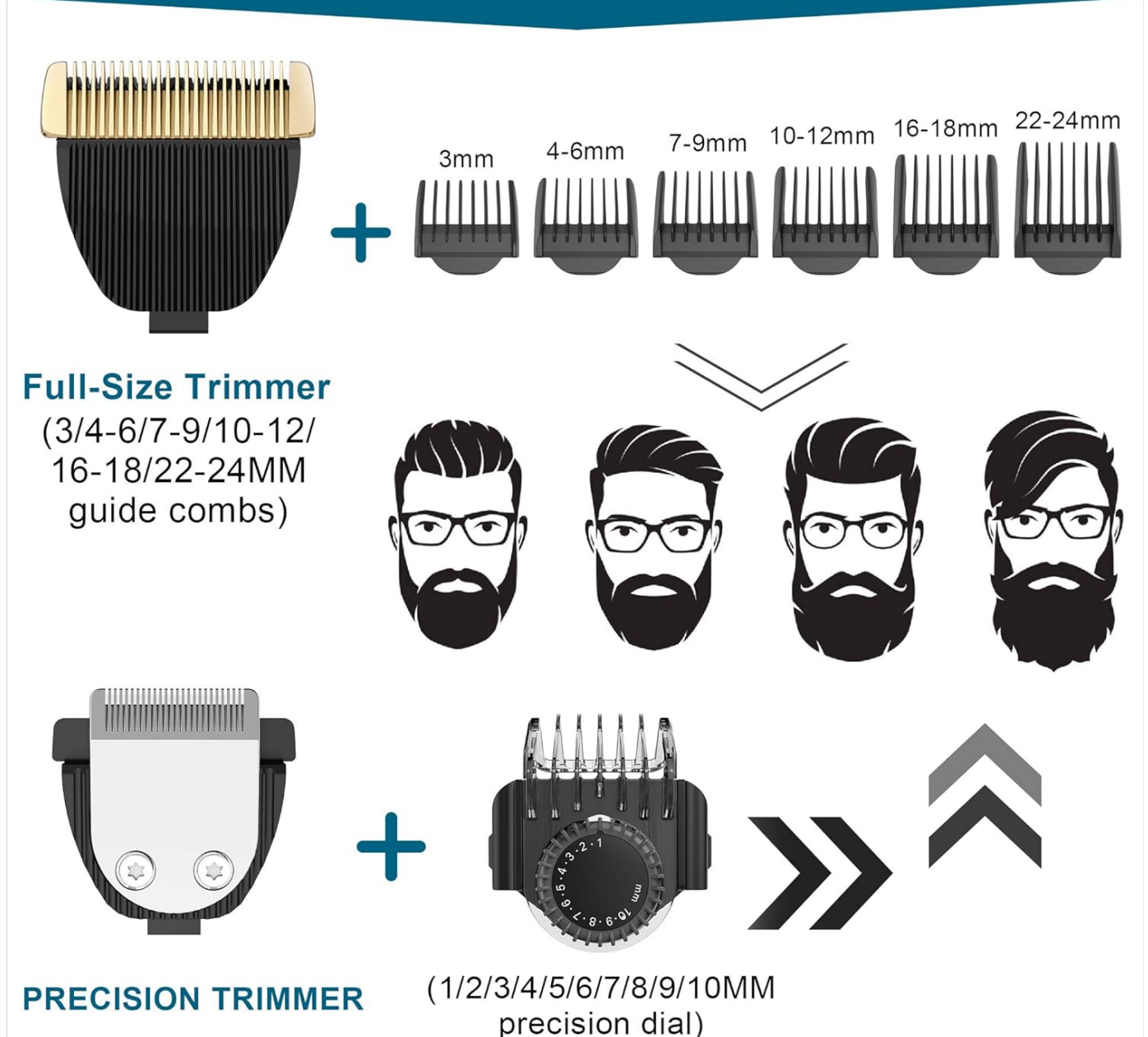
Image: An illustration demonstrating the use of various guide combs with the full-size trimmer and the precision dial with the precision trimmer for different hair and beard lengths.