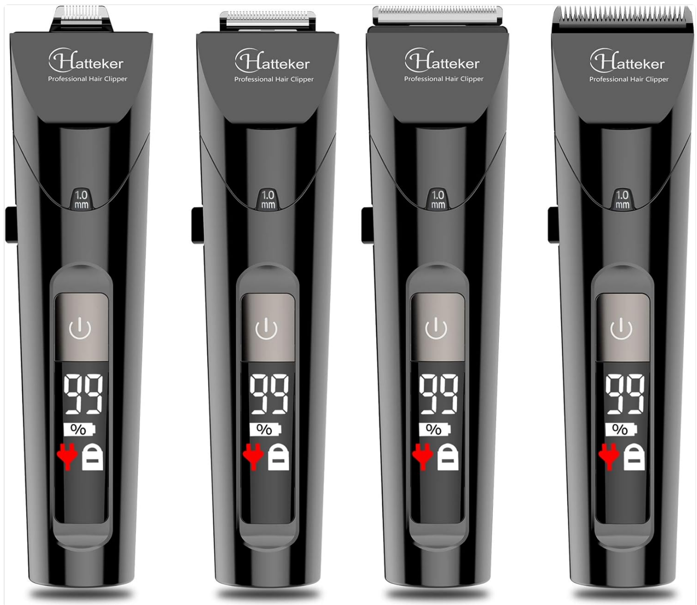
Image: A display of the four interchangeable heads included with the Hattaker clipper: the standard hair clipper head, beard trimmer head, precision trimmer head, and body trimmer head.