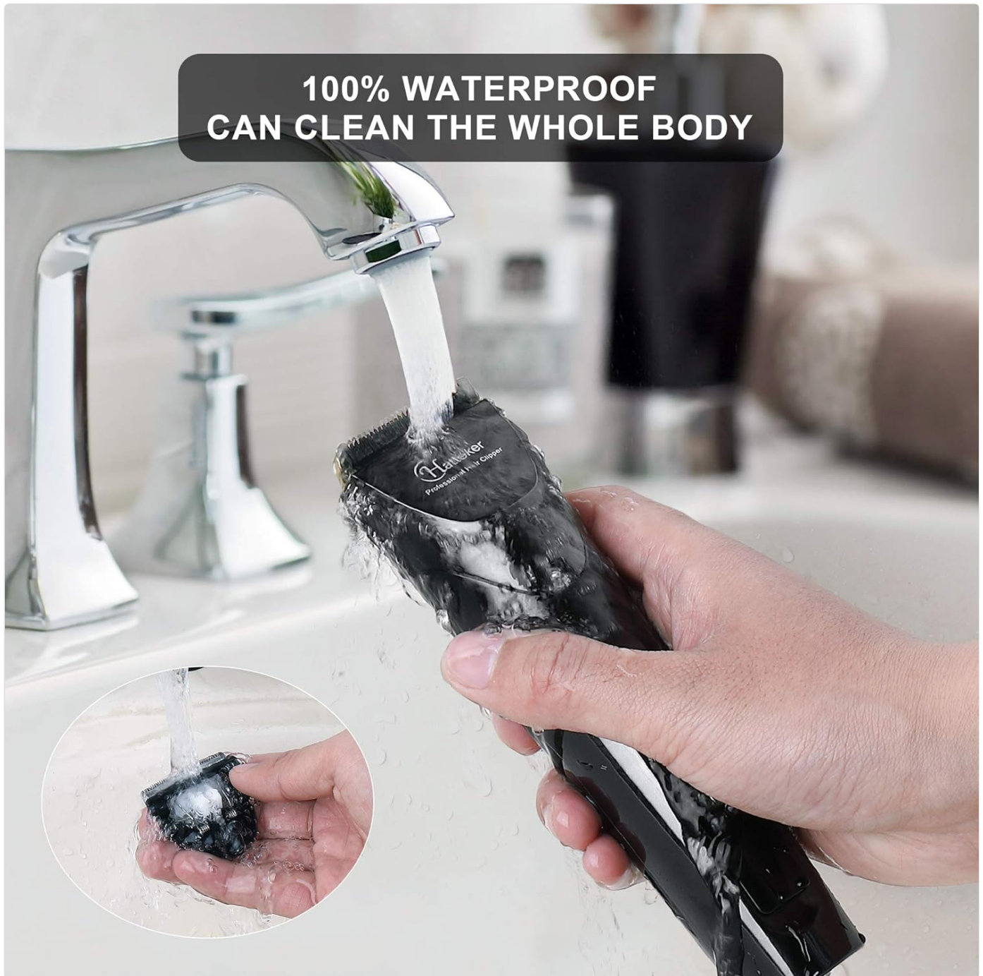
Image: The Hattaker hair clipper being cleaned under a running faucet, illustrating its fully washable design.