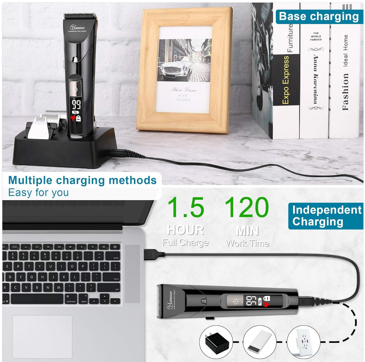
Image: The Hattaker hair clipper connected to a USB cable, demonstrating various charging methods including a wall adapter, power bank, and laptop, along with the charging base option.