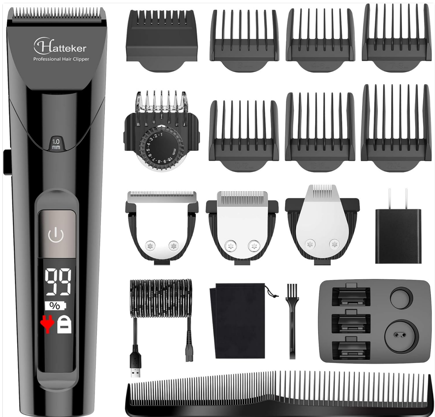
Image: The Hatteker hair clipper and trimmer, showcasing its main unit, various interchangeable heads, guide combs, charging cable, cleaning brush, and comb.