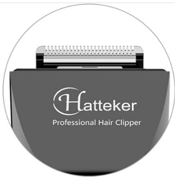
Replaceable Cutter head