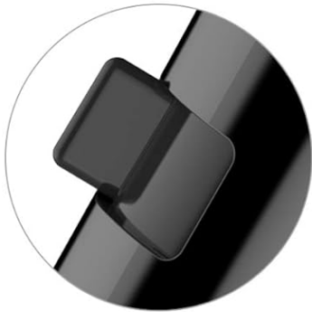
4 Precise length Setting adjustment