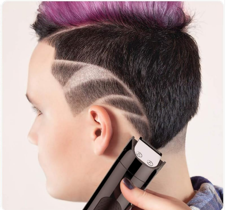
Image: A collage demonstrating the versatility of the Hatteker clipper, showing it in use for trimming a beard, cutting hair, and creating intricate hair designs.