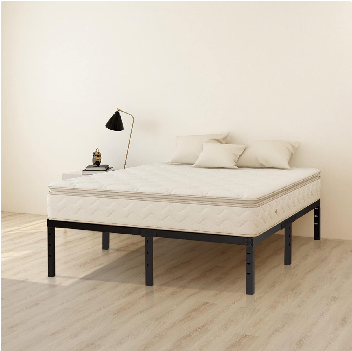
Image 5.1: Mattress placement directly on the steel slats, no box spring required.