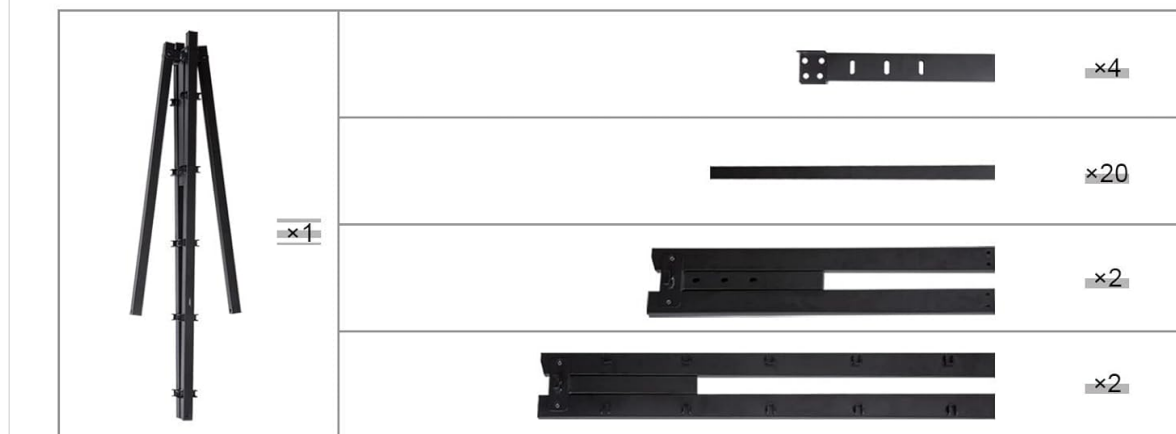
Image 3.2: Detailed view of bed frame dimensions and individual parts for assembly.